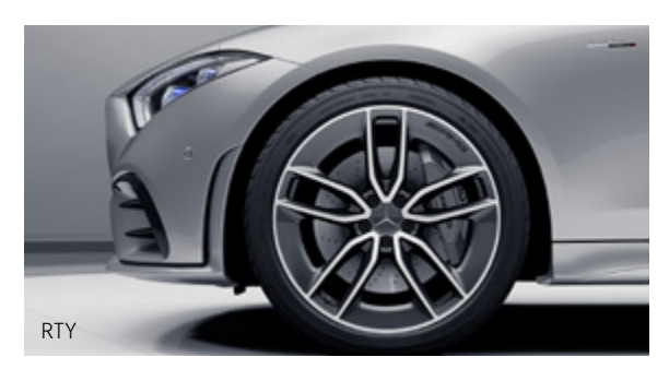
50.8 cm (20-inch) AMG 5-twin-spoke light-alloy wheels