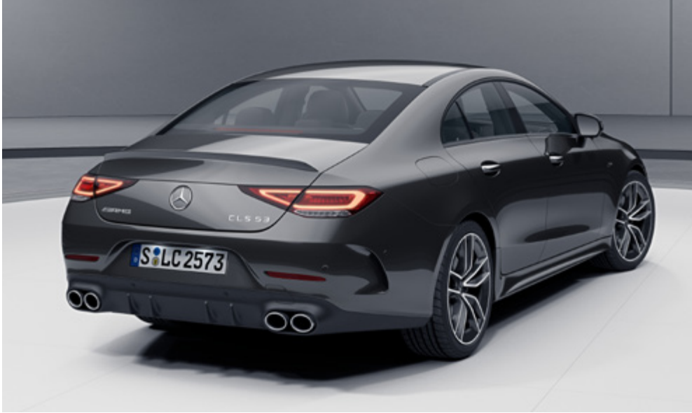
AMG bodystyling (772) | AIR BODY CONTROL (489)