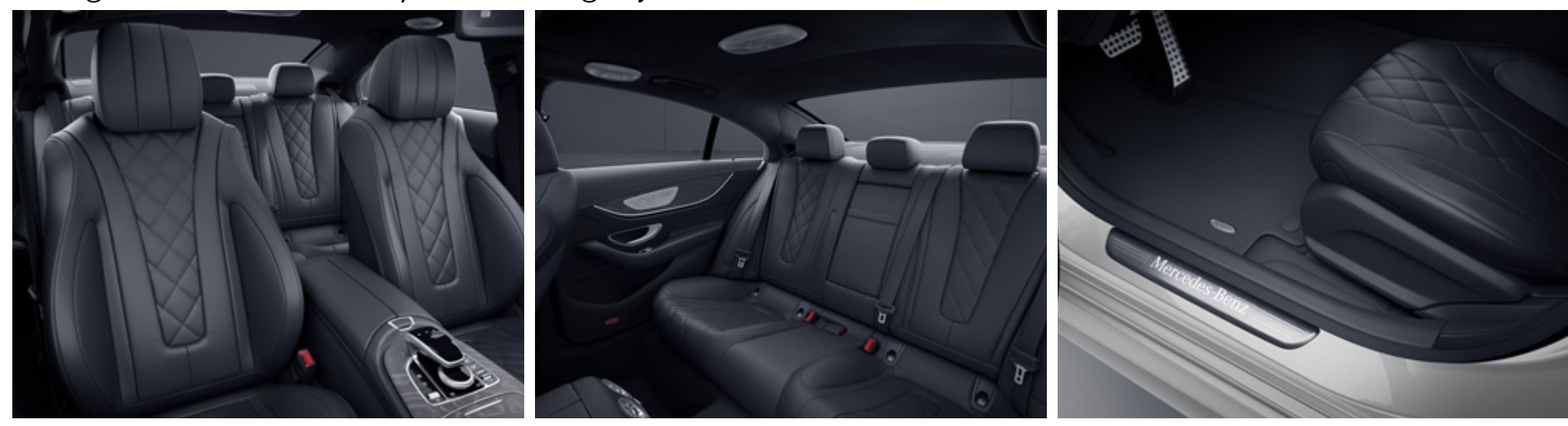
designo nappa leather black / titanium grey pearl (951A) | designo floor mats (U04) | Galvanised steering-wheel gearshift paddles (431) | Dashboard in Nappa leather (U38)