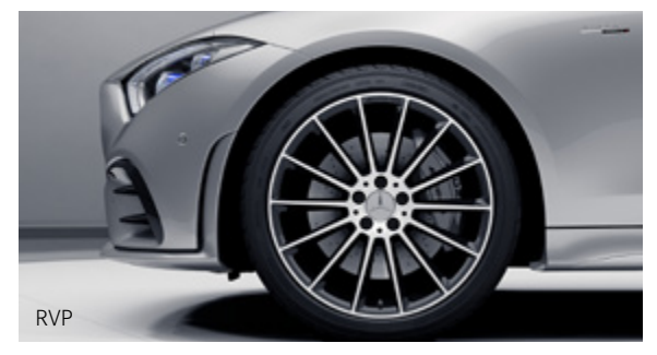
50.8 cm (20-inch) AMG multi-spoke light-alloy wheels In conjunction with P31