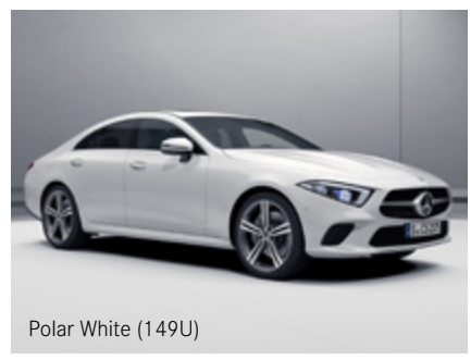
Metallic Paint - R 5,000