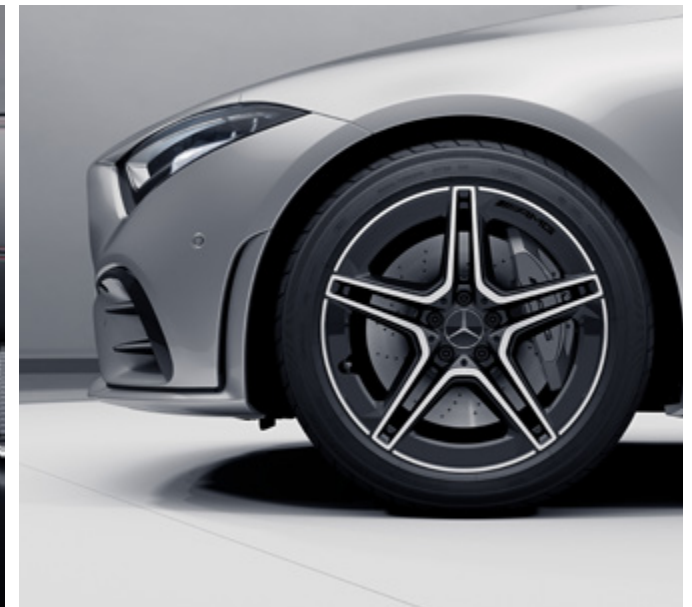
48.3 cm (19") AMG 5-twin-spoke light-alloy wheels (RRF)

P29: OICW (P31+(671A/861A/871A/875A/877A/878A/881A/951A/955A)+(51U/55U/58U/61U/65U)+(873/401/902)+(U04/U26/U66/)+(L6G/L6J/L6K/L6L)) | P31: OICW (P29+489+772+(RRF/RTY/RTZ/RVO/RVP)+(U47/U93)) | Images for illustration purposes | Item may differ due to South African Specifications