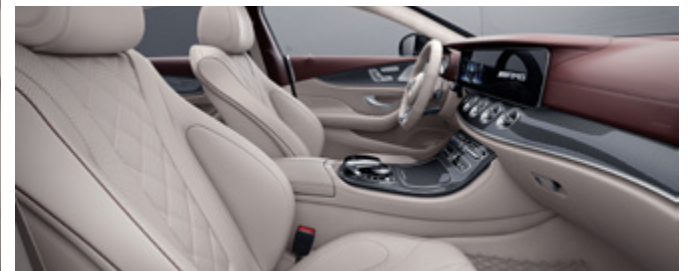
designo nappa leather macchiato beige / tizian red (955A) | designo floor mats (U04) | Dashboard in Nappa leather (U38)

P62: OICW (P29+275+287+951A)+(51U/61U)+(L6G/L6J/L6K/L6L)+U04+U38) | P87: OICW (P29+275+287+955A)+(55U/65U)+(L6J/L6L)+U04+U38)