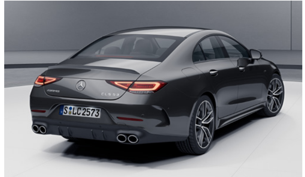
AMG bodystyling (772) | AIR BODY CONTROL (489)