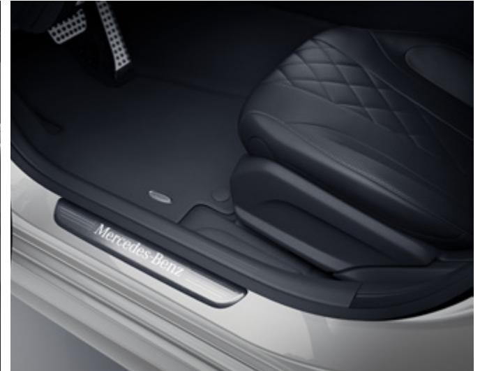
designo nappa leather black / titanium grey pearl (951A) | designo floor mats (U04) | Galvanised steering-wheel gearshift paddles (431) | Dashboard in Nappa leather (U38)