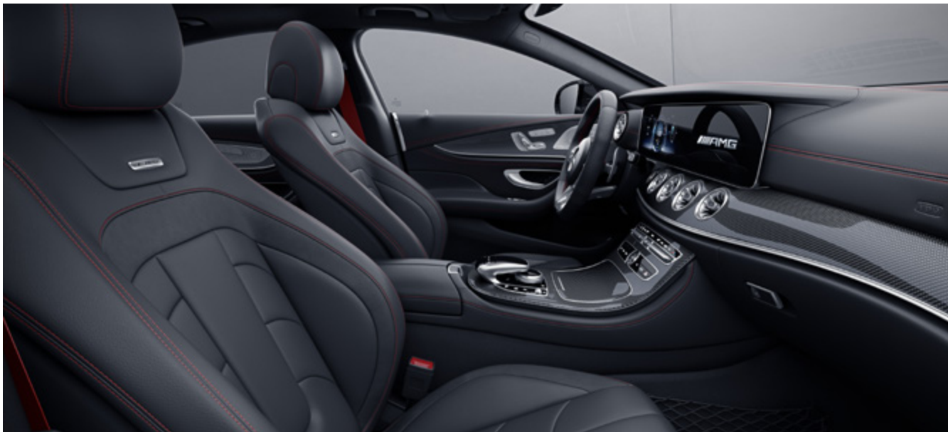
ARTICO man-made leather / DINAMICA microfibre AMG black (671A) | Heated front seats (873)