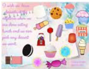
Ariana Greer (Grade 2) wishes for dessert with lunch and another students asked for a cookie on Fridays with lunch.