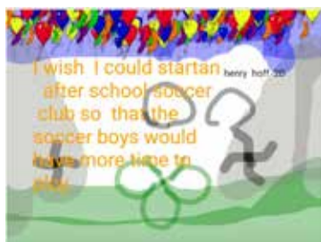
Henry Hoff (Grade 2) wishes for an after-school soccer club. This is just one of the many clubs ES students wished for. Other clubs suggestions were a computer club, STEM, another robotics club, and typing club.