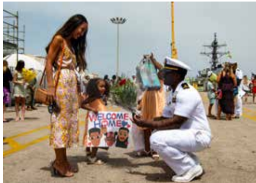
Sailors attached to the Arleigh Burke-class guided-missile destroyer USS Paul Ignatius (DDG 117) greet their families after pulling into port to complete their homeport shift to Naval Station Rota, Spain, June 17, 2022.