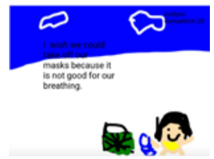
Acelynn Gemahlich (Grade 2) wishes for no more masks. Now that masks are optional, this student's wish has been granted!