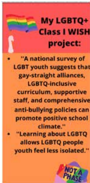
One 7th grader researched why a class about LGBTQ+ history, facts, statistics, and issues is important to have in schools. She created a poster showcasing her research. This is one part of the poster that she felt was important to showcase.