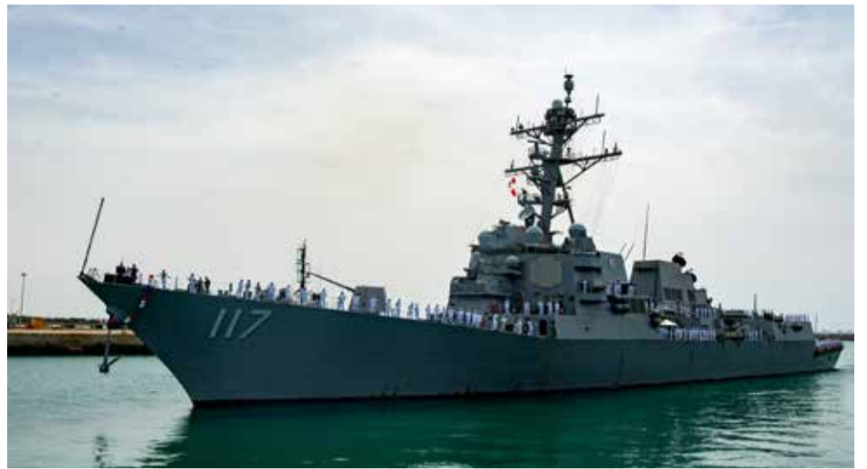
Arleigh Burke-class guided-missile destroyer USS Paul Ignatius (DDG 117) pulls into port, completing its homeport shift to Naval Station Rota, Spain, June 17, 2022.

"The uniqueness of this homecoming cannot be understated, as we are both returning to our families and arriving at our new homeport," said