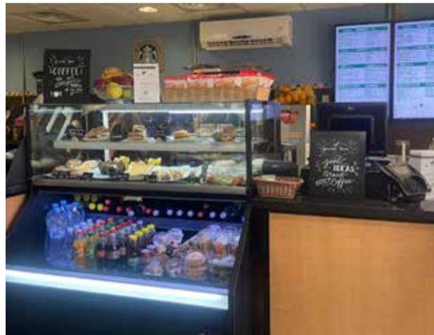
Gourmet Bean offers community members numerous coffee drinks, breakfast and lunch sandwiches, pastries, smoothies, healthy snacks, and more at their library and Fleet Landing locations.