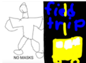
This elementary school student wishes for no masks, and more field trips. Now that masks are optional, one of this student's wishes has been granted! Field trips are also accessible again and there are plans for them to start 2022-2023 school year.