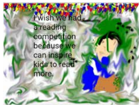
This elementary school student wishes for a reading competition. A collaboration for a school-wide reading incentive program is in the works for next school year!