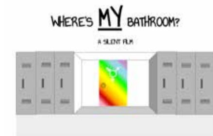
A high school student created a stop-motion video / silent film wishing for a gender-neutral bathroom. This wish was granted but it didn't happen overnight! Student Council had been working diligently with the administration to grant this wish for students.