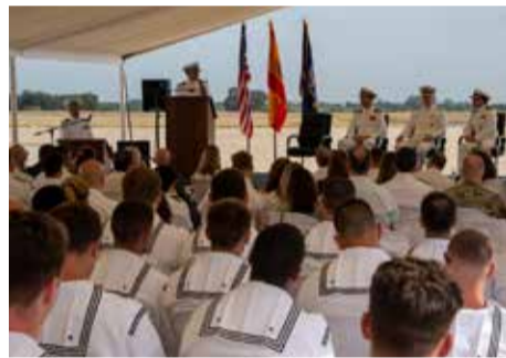
Sailors attend the establishment ceremony for Helicopter Maritime Strike Squadron (HSM) 79 detachment, Rota, Spain, June 16, 2022.