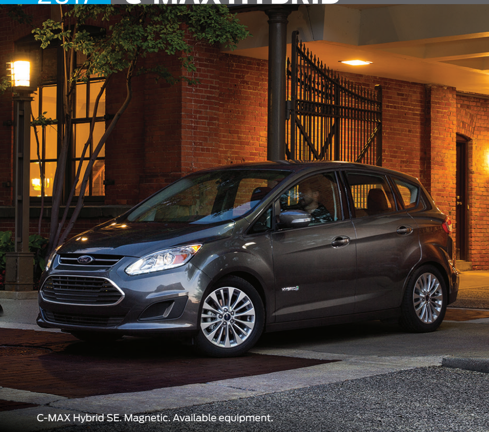
C-MAX Hybrid SE. Magnetic. Available equipment.

Small Hybrid Vehicle Class 1 Series: Hybrid SE, Hybrid Titanium