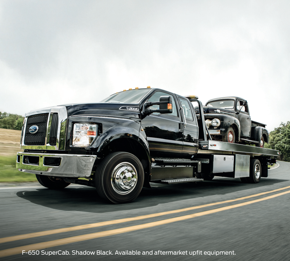
F-650 SuperCab. Shadow Black. Available and aftermarket upfit equipment.