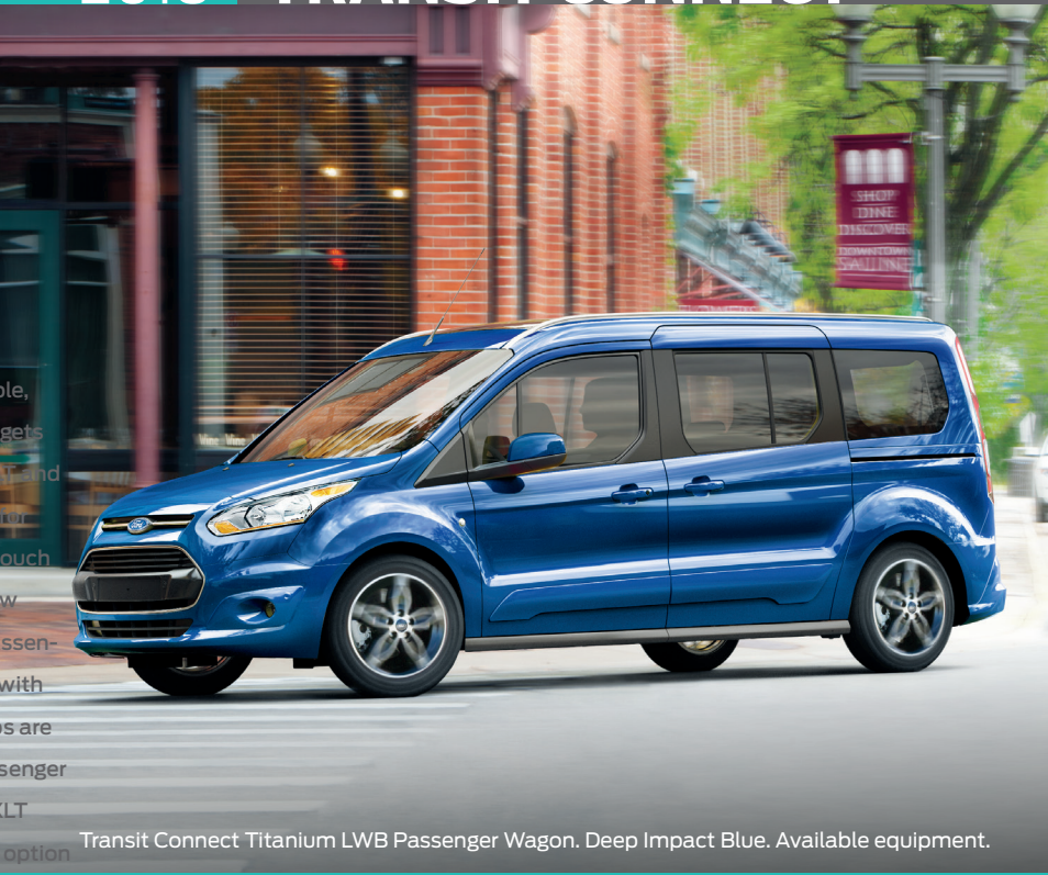
Transit Connect Titanium LWB Passenger Wagon. Deep Impact Blue. Available equipment.