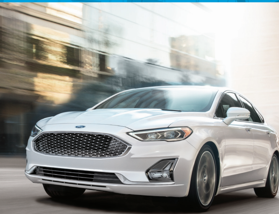
Fusion Titanium. White Platinum Metallic. Available equipment.

Midsized Sedan Class 1 Models: S, SE, SEL, Titanium, V6 Sport