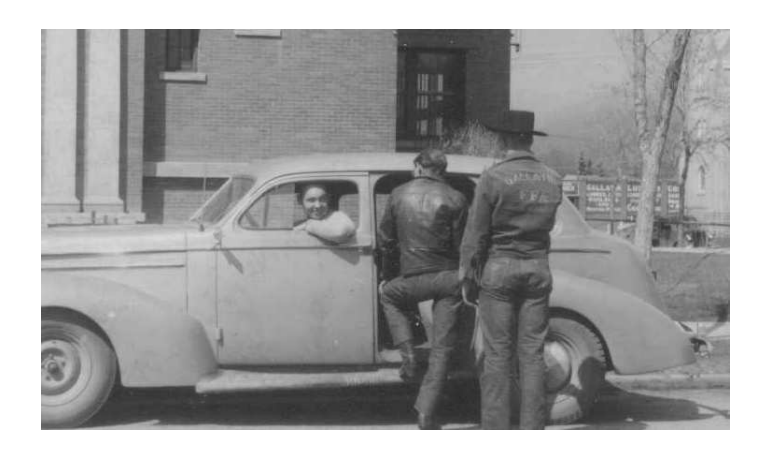
Wonder what we are up to? Look closely at the back of our FFA Jackets, and notice the name of the chapter is above the emblem. To learn who suggested the change, read the history inside.