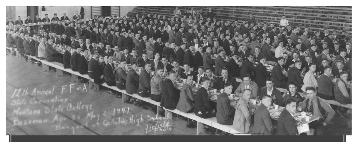
THE TWELFTH STATE FFA CONVENTION ASSEMBLED IN THE GYM AT THE GALLATIN COUNTY HIGH SCHOOL ON APRIL 30, 1941.