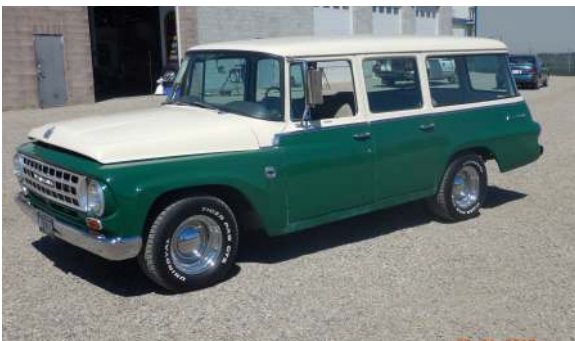
1964 C1000 Travelall