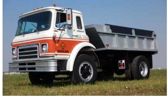
1975 CARGO STAR GRAVEL TRUCK