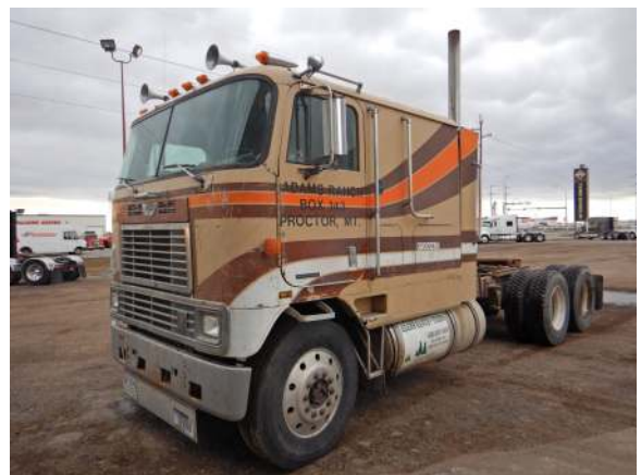
1982 COF9670 EAGLE 110 in Sleeper, Awaiting Preservation