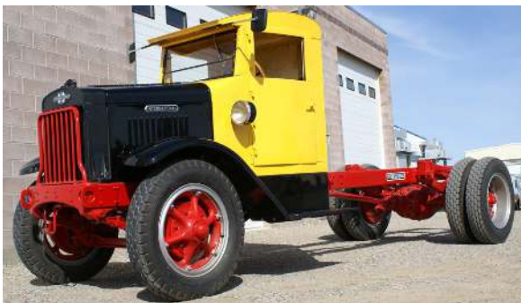
1929 HS 54