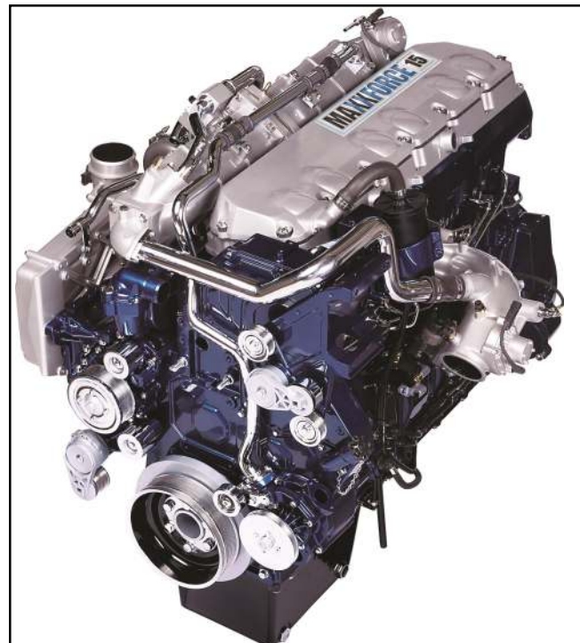
MaxForce 15 550 HP