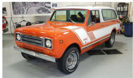
1979 Scout Traveler