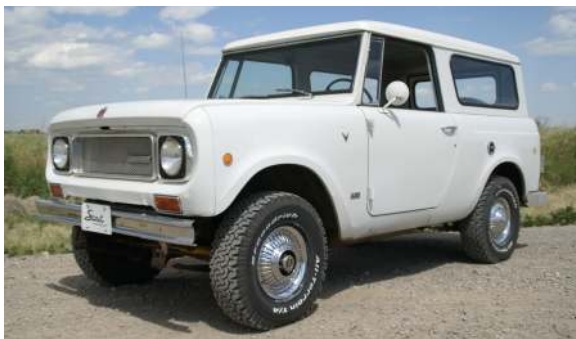
1970 Scout 800A