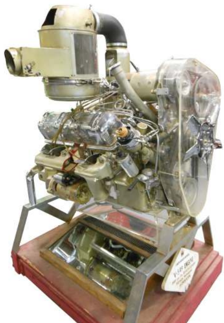
1955 549 V8 Cutaway Display Engine built by International for the 1955 Chicago Auto Show.