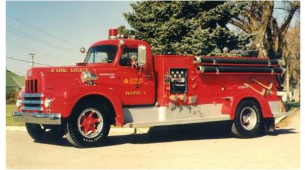
1956 R185-6 FIRE TRUCK