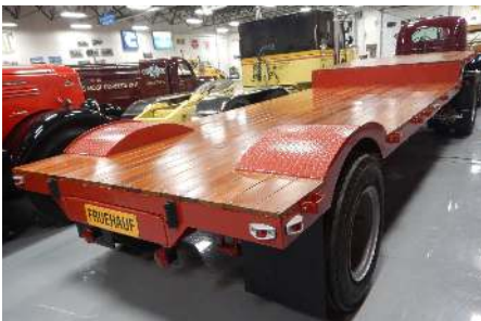
1939 Fruehauf Drop Deck Trailer