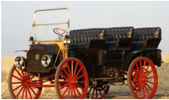
1913 MW High Wheeler