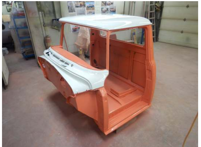
Cab Painted Persimmon and White