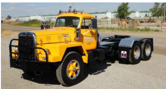
1959 RDF-230-H with a Rolls Royce Diesel