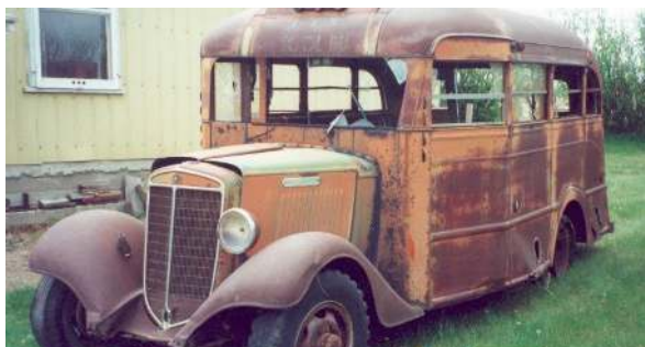
1935 C-15 School Bus