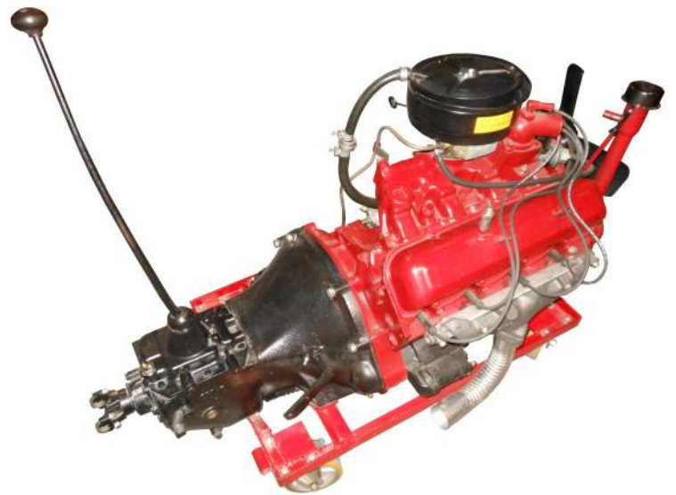
152 CID - 4 Cylinder used in Scouts, Metros & C-99 Pickups