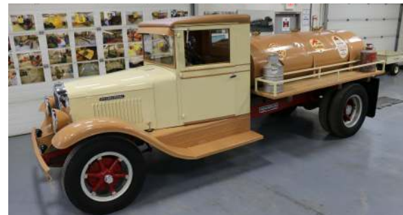
1933 International B-3