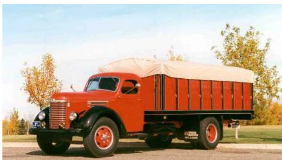
1949 KBS-7 FREIGHT BODY