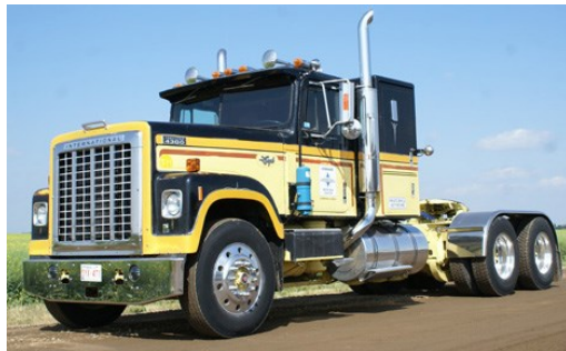
1981 F4370 Eagle