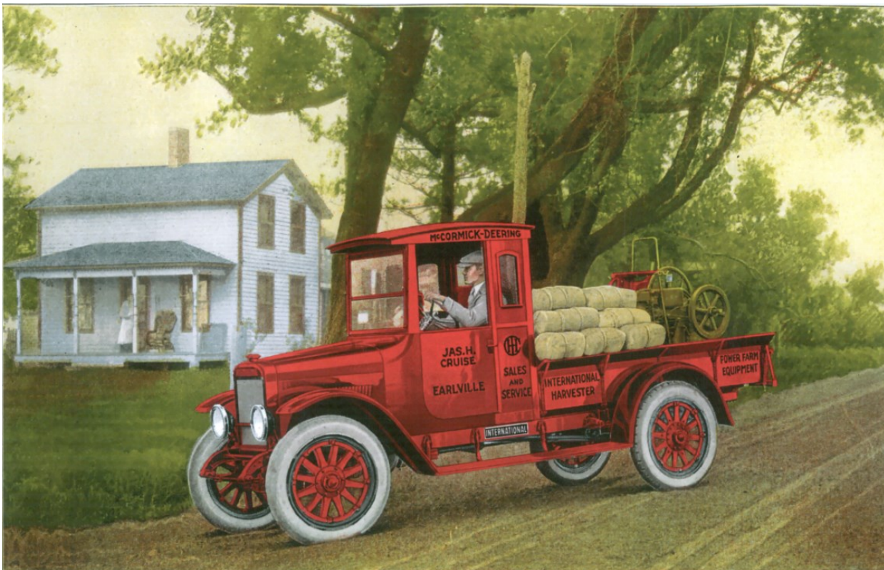
1923 Red Baby Model S