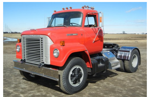
1974 FleetStar 2010A