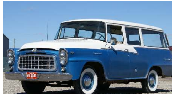
1960 International B-100