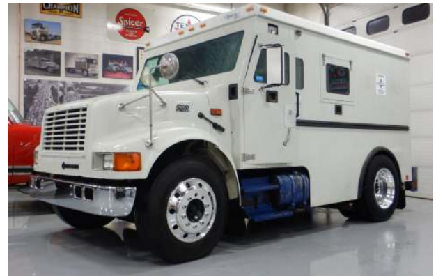
1999 4700 Armored Truck