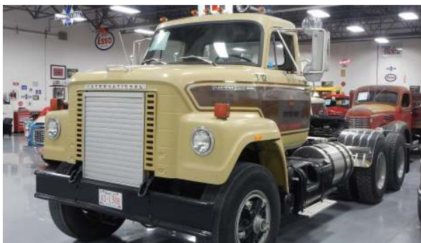
1977 FleetStar F-2070-A NTC-290