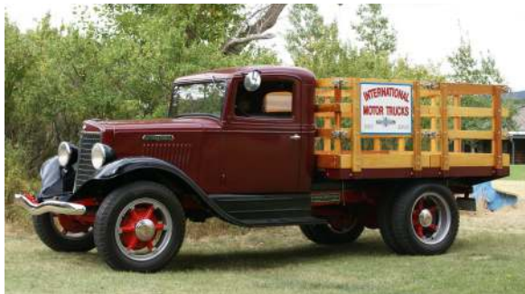
1935 C-30 1 1/2 TON