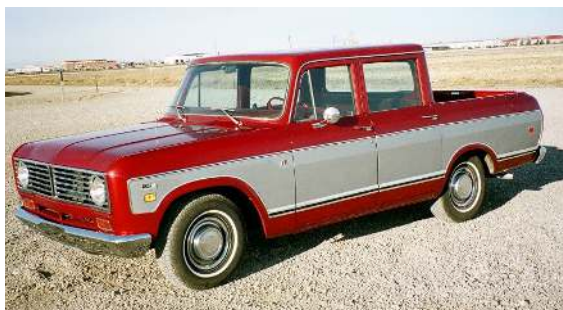
1973 Wagon Master