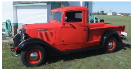
1936 C-1 1/2 TON