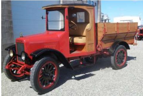
1923 Model S GRAIN BOX