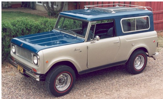
1969 Scout Aristocrat