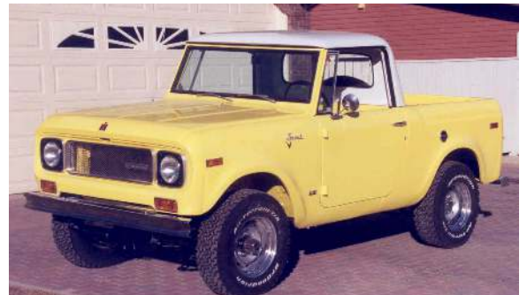
1970 Scout 800A