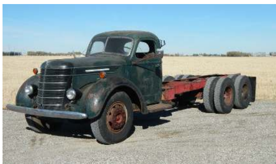
1940 D-246-F Full Tandem