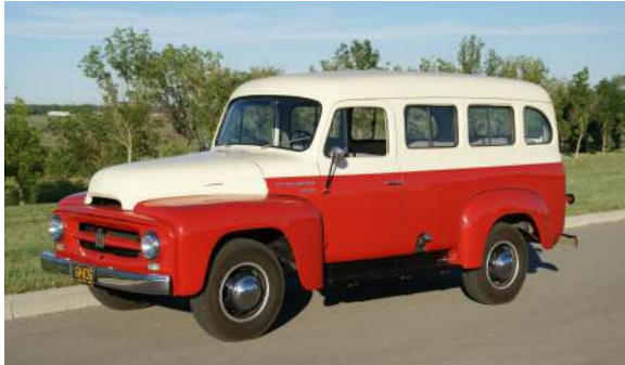
1955 R120 TRAVELALL