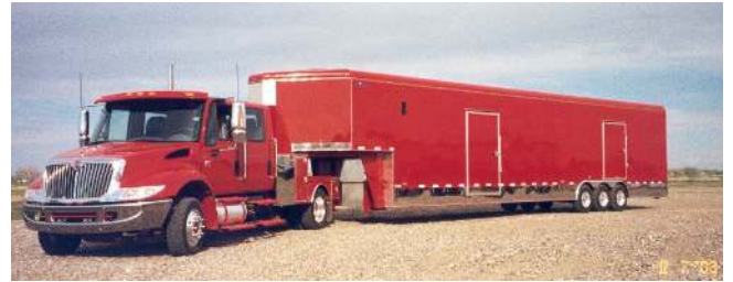
2003 4400LP With 48Ft Trailer