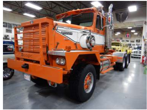
1980 Pacific P510-S