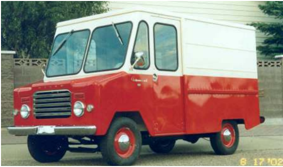
1962 CH-90 Metro