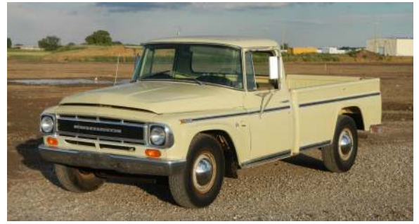
1968 1200C 3/4 Ton