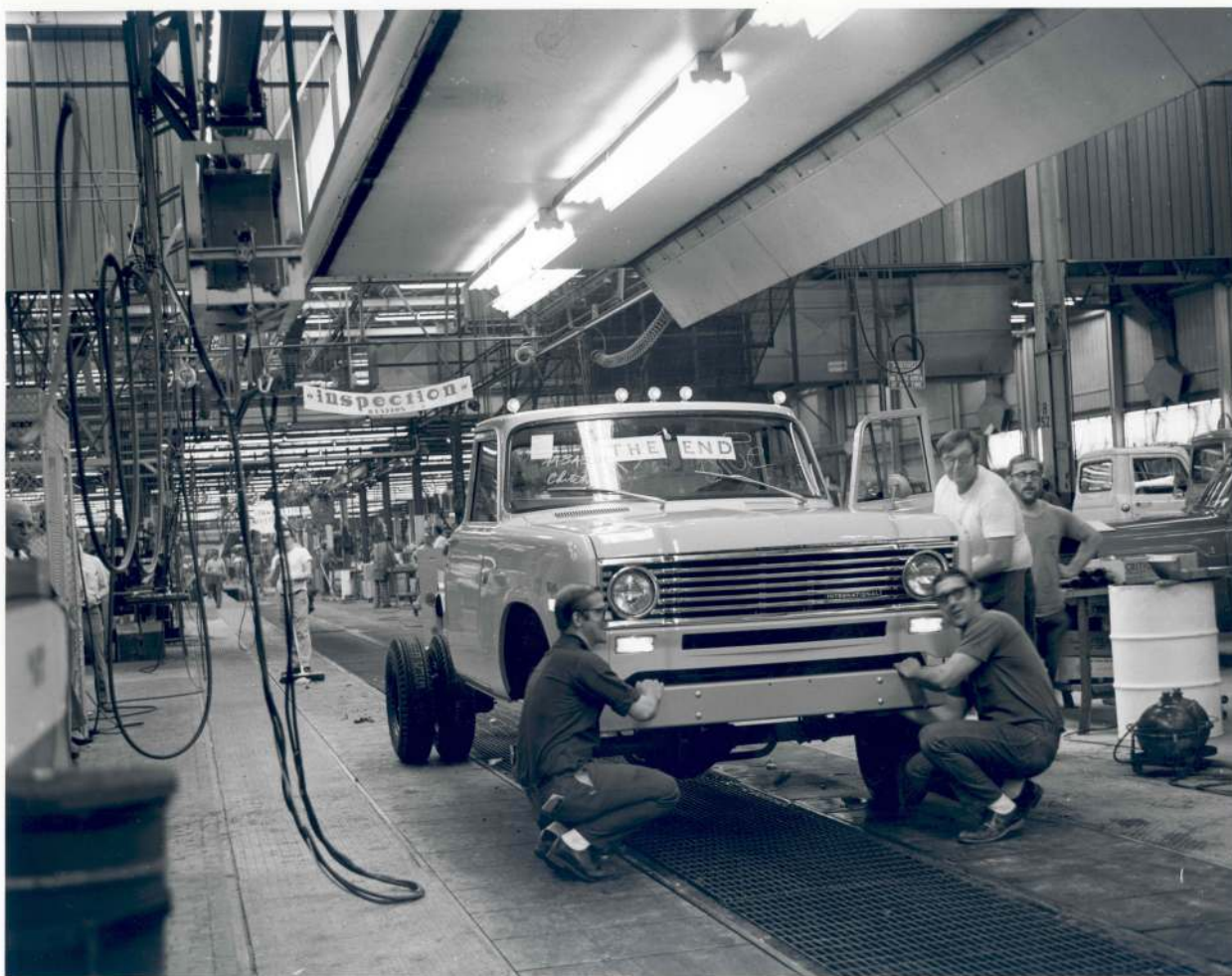
May 5 1975 Last Light Duty Model 200 4X4