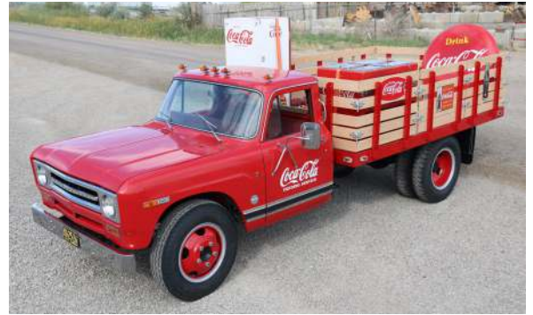
1969 1 1/2 Ton 1500D