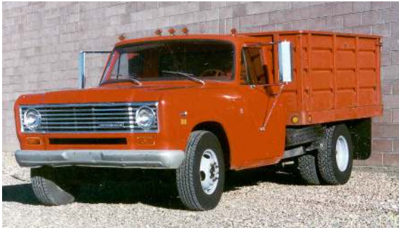
1975 200 1 TON