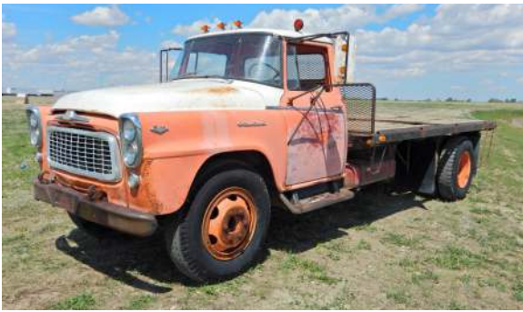
1960 B174 3 TON