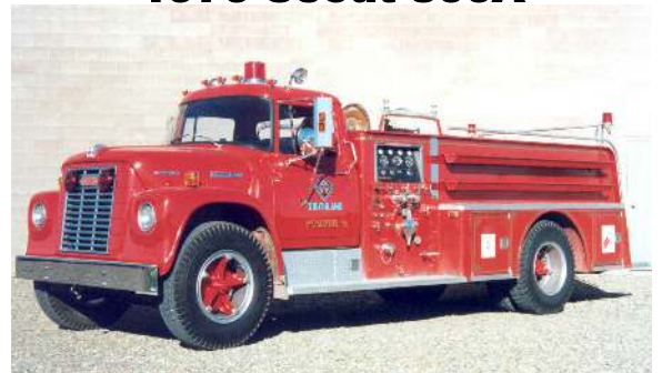
1973 1700 Loadstar Fire Truck