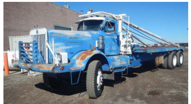
1957 RDF 320