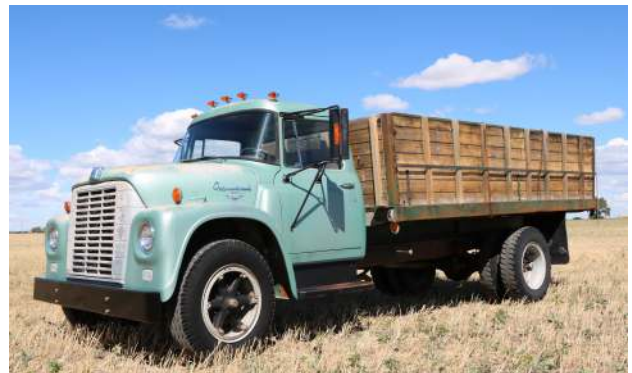
1967 International 1600 LoadStar