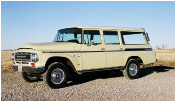
1968 1100C Travelall 4X4