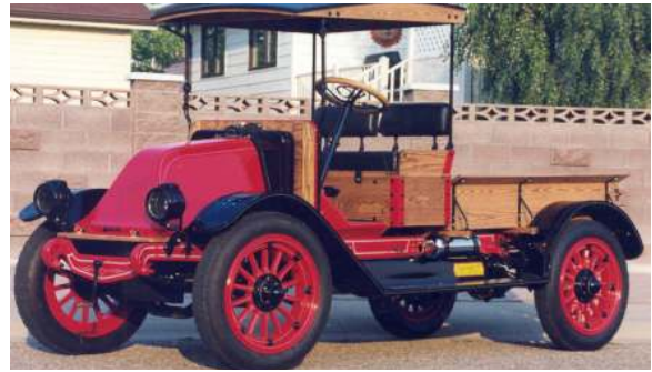
1917 Model H