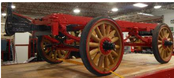
1920 Highway Trailer Chassis