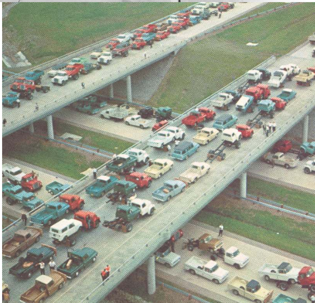
1968 Worlds Largest Drive Away, 946 Trucks From Spring Field Ohio