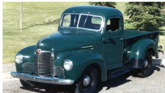
1949 KB1 1/2 TON