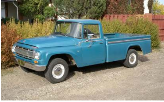
1967 1100B 1/2 Ton