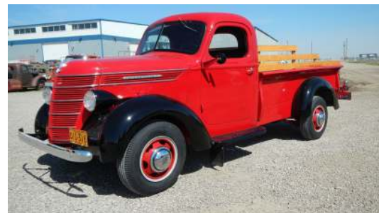
1940 D15 Pickup 3/4 Ton