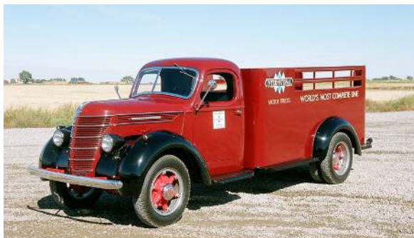
1937 D30 1 1/2 Ton