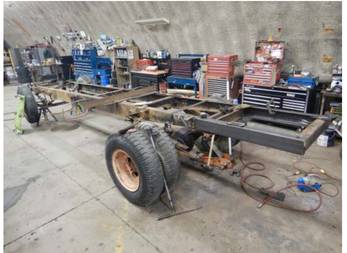
Getting New Rear Frame Rails