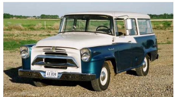
1958 A-100 TRAVELALL