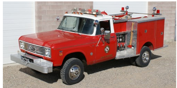
1975 200 4x4 Mini Pumper