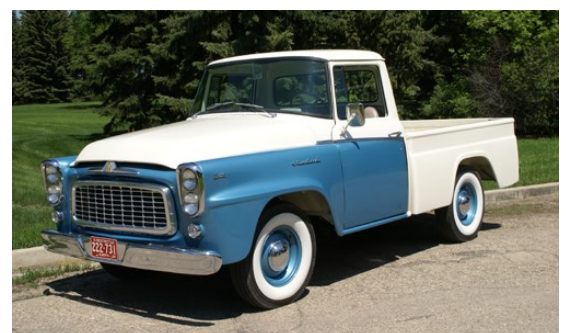
1960 B-100 1/2 Ton