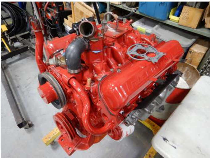
304 V8 Engine Ready To Install