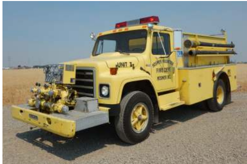
1979 1724 FIRE TRUCK