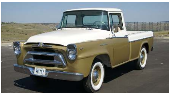
1957 A-100 GOLDEN JUBILEE