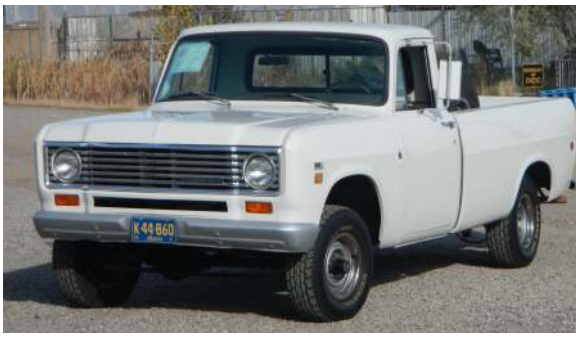
1974 100 4X4