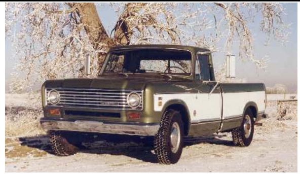
1974 200 3/4 TON