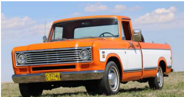
1975 D-150 1/2 Ton