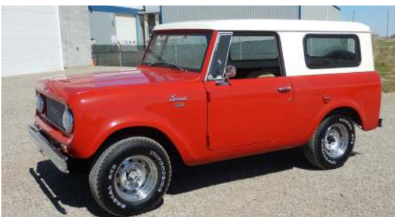
1967 Scout 800