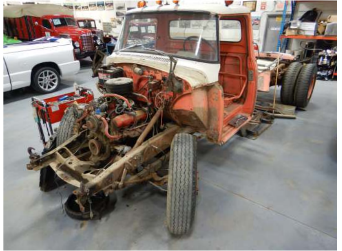
Tearing it Apart