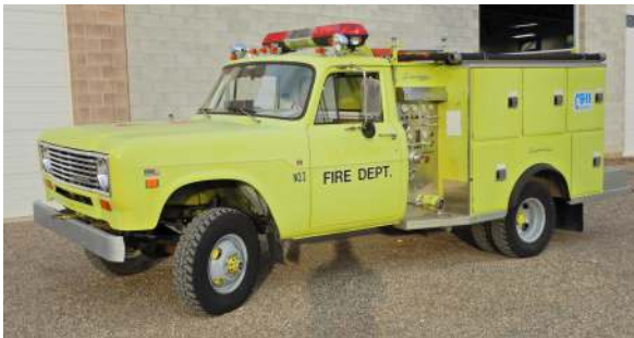
1975 200 4X4 Mini Pumper