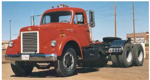
1966 VF190 TRACTOR