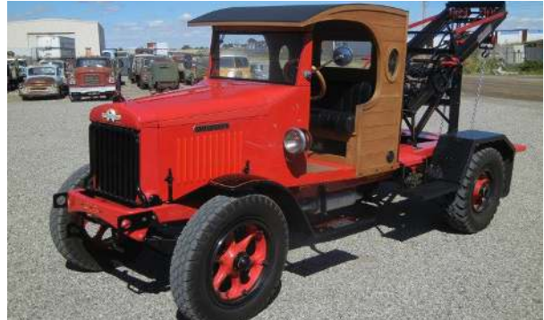
1927 54-C Tow Truck