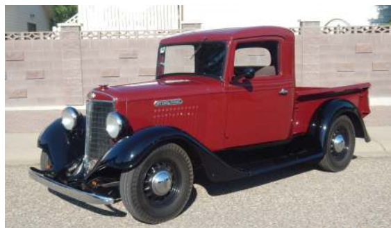
1935 C-1 1/2 TON