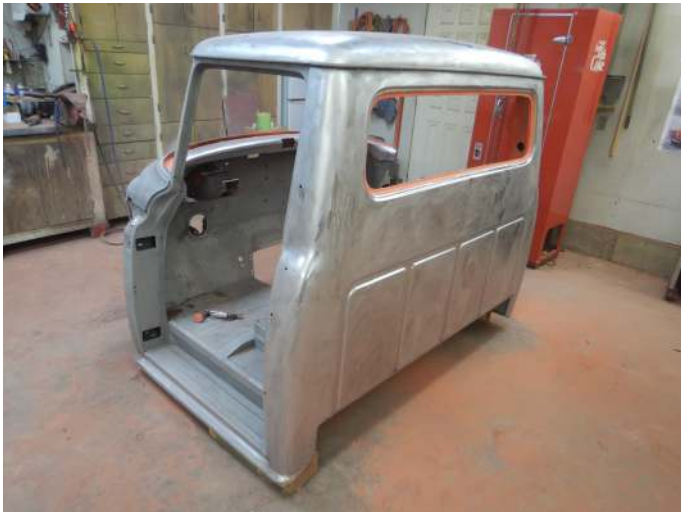
Cab Stripped Down