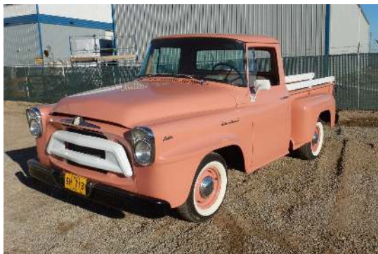
1958 International A-100