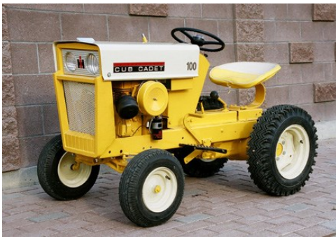
1964 Cub Cadet 100