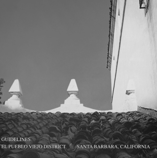
GUIDELINES EL PUEBLO VIEJO DISTRICT SANTA BARBARA, CALIFORNIA