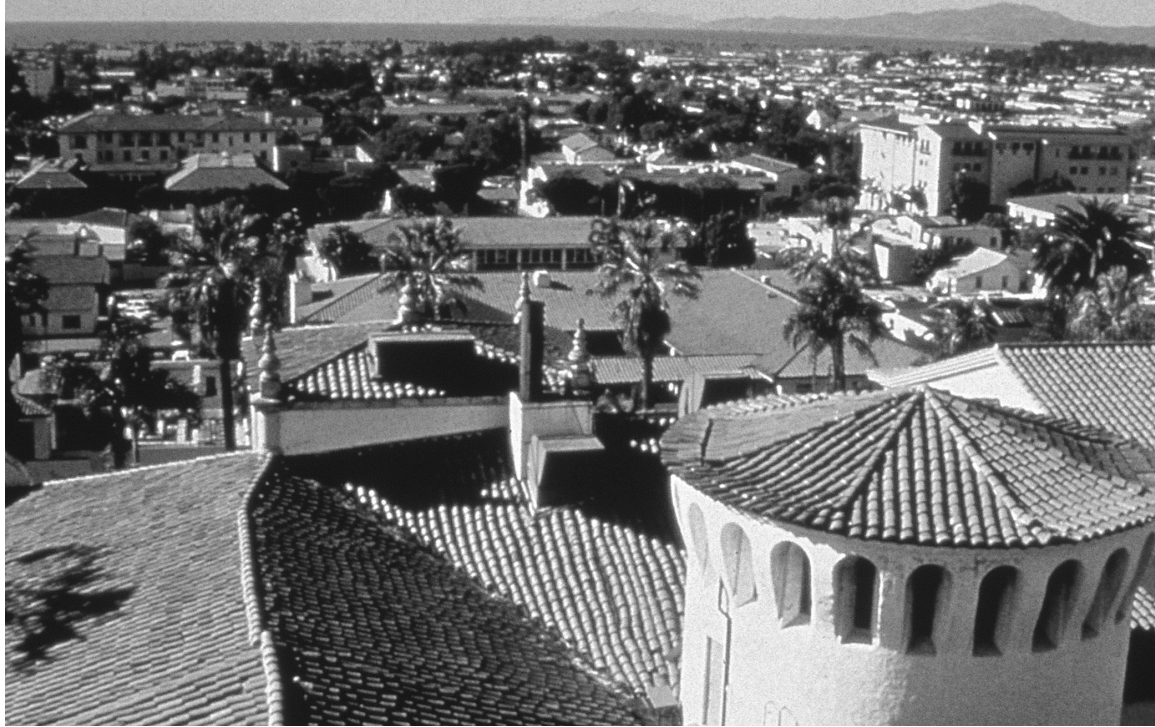
Santa Barbara rooftop