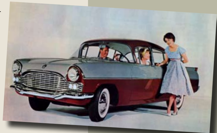
1960 Vauxhall Cresta.