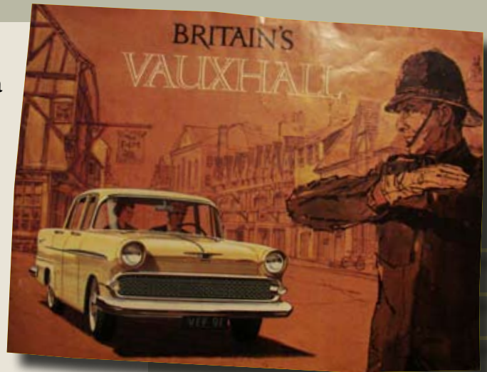
1959 Vauxhall Victor sales brochure for the North American market.

U.S. Vauxhall memorabilia is pretty scarce. This is a 1958 printing plate for a letterpress, a very rare piece. I flipped it and adjusted the color so you could see it better. This was for a newspaper advertisement.