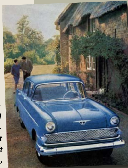
Ads almost always depicted people behind the cars and not in them, so the car would appear larger.