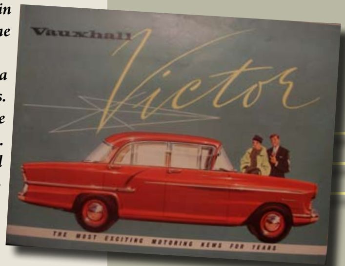
1958 Vauxhall Victor sales brochure for the North American market.