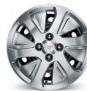
15" Steel with Bolt-On Wheel Cover (LS)