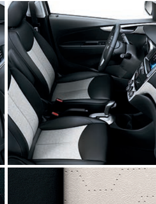
Jet Black Leatherette with Beige Seat Inserts and Beige Dash Trim 7