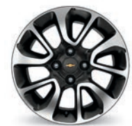
15" Gunmetal Silver-Painted Alloy (ACTIV)