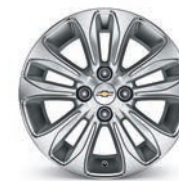
15" Silver-Painted Alloy (1LT and 2LT)