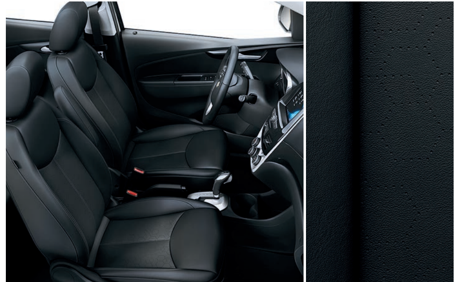
Jet Black Leatherette with Piano Black Dash Trim 4 (Dash Trim also available in White 5 )