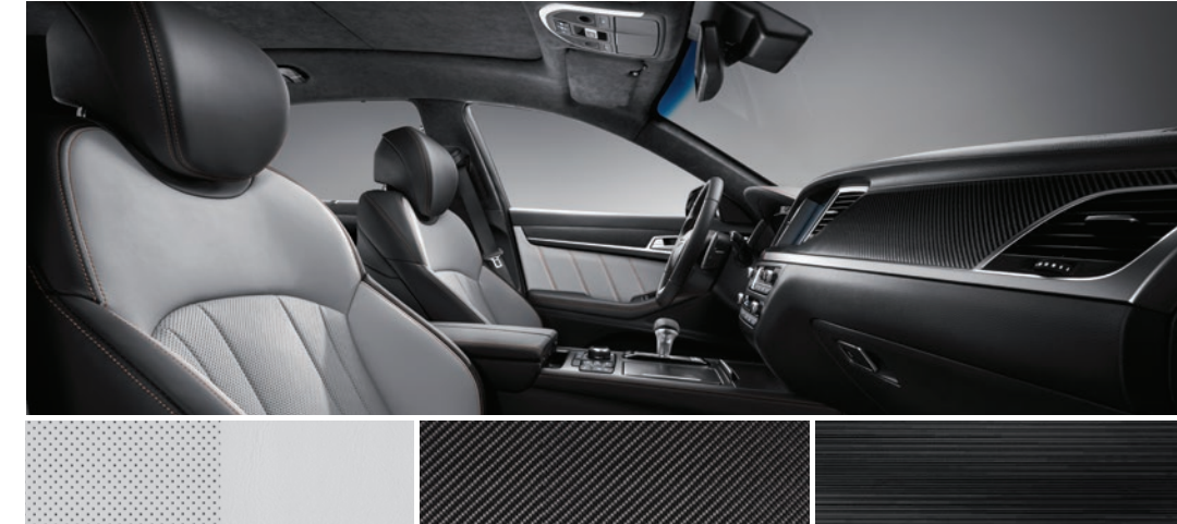
LIGHT GREY NAPPA LEATHER GENUINE CARBON FIBRE DARK FINISH ALUMINUM ACCENTS