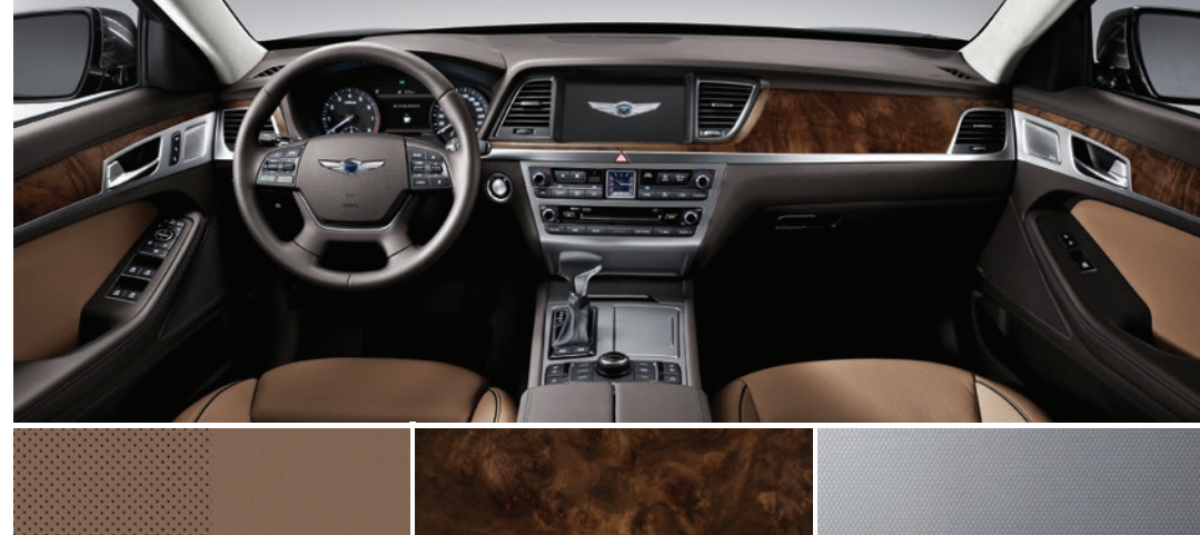
BROWN NAPPA LEATHER WALNUT OPEN PORE WOOD ALUMINUM ACCENTS