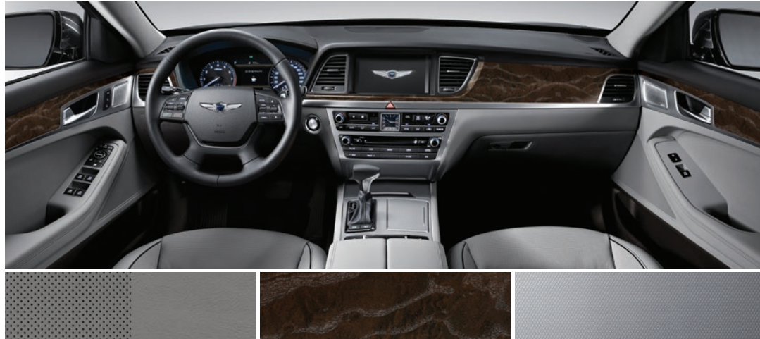
GREY NAPPA LEATHER BROWN ASH OPEN PORE WOOD ALUMINUM ACCENTS