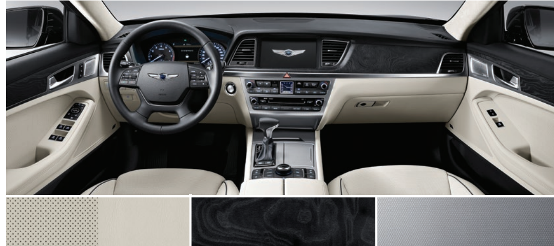
IVORY NAPPA LEATHER BLACK ASH OPEN PORE WOOD ALUMINUM ACCENTS