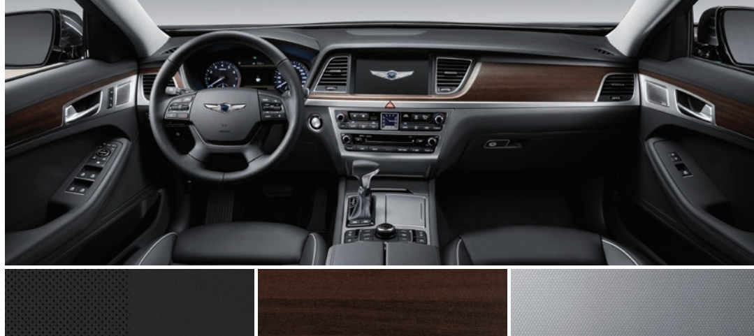
BLACK NAPPA LEATHER SAPELE OPEN PORE WOOD ALUMINUM ACCENTS