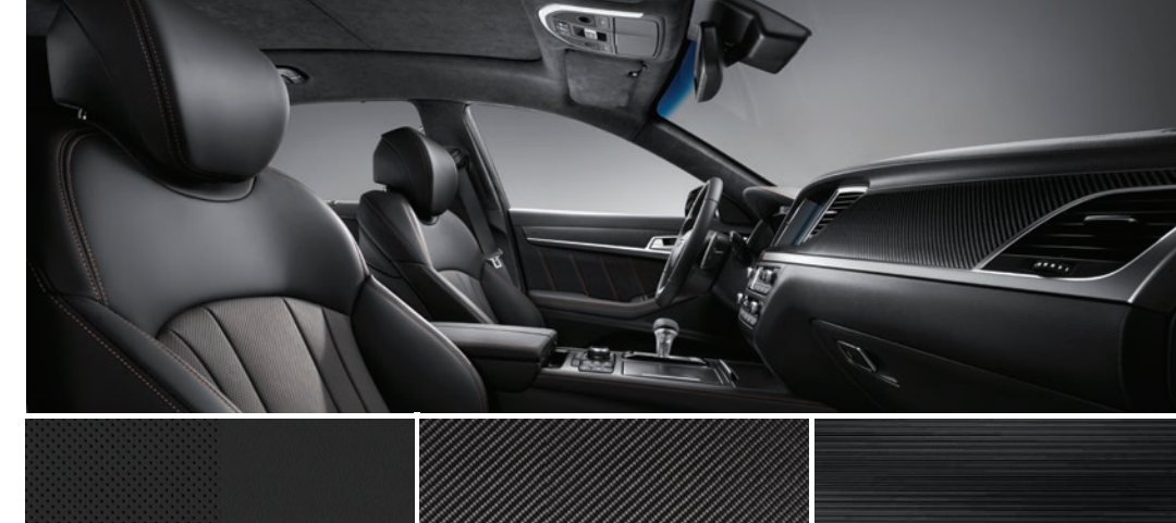
BLACK NAPPA LEATHER GENUINE CARBON FIBRE DARK FINISH ALUMINUM ACCENTS