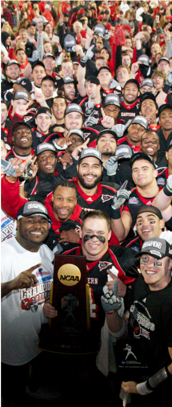
Eagles pose with the 2010 Championship Trophy.

The Eastern Washington football program has experienced a tradition of success felt by few others across the country, thrilling fans in Cheney with high-flying offenses, crushing defenses, playoff victories and national attention.