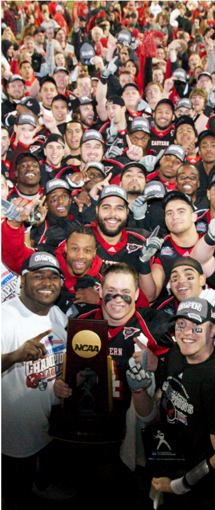
Eagles pose with the 2010 Championship Trophy.

The Eastern Washington football program has experienced a tradition of success felt by few others across the country, thrilling fans in Cheney with high-flying offenses, crushing defenses, playoff victories and national attention.