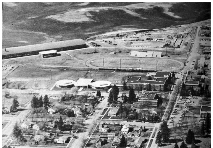
Aerial view of Woodward Field in 1961.

2014: On Aug. 23, down 21-14, top-ranked Eastern out-scored No. 17 Sam Houston State 42-14 in the final 36 1/2 minutes to register a 56-35 victory in the "FCS Showcase" televised by ESPN.