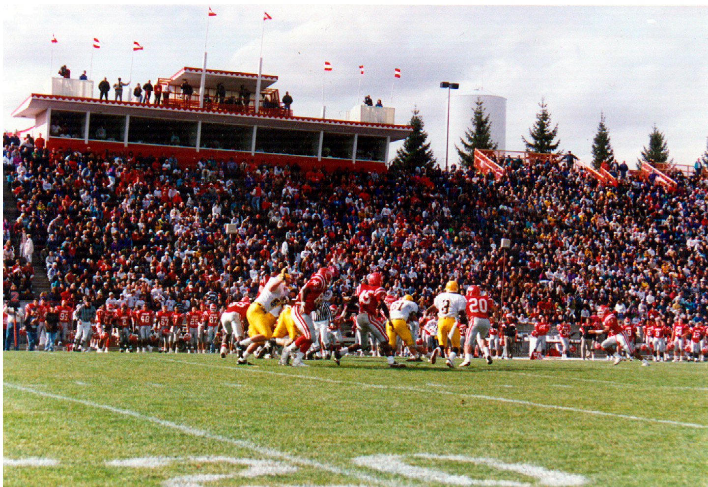
A then-record crowd of 6,879 watches EWU vs. Idaho at Woodward Field in 1992.