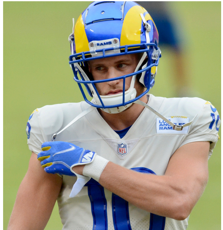
Kupp warms up at Washington on October 11, 2020.