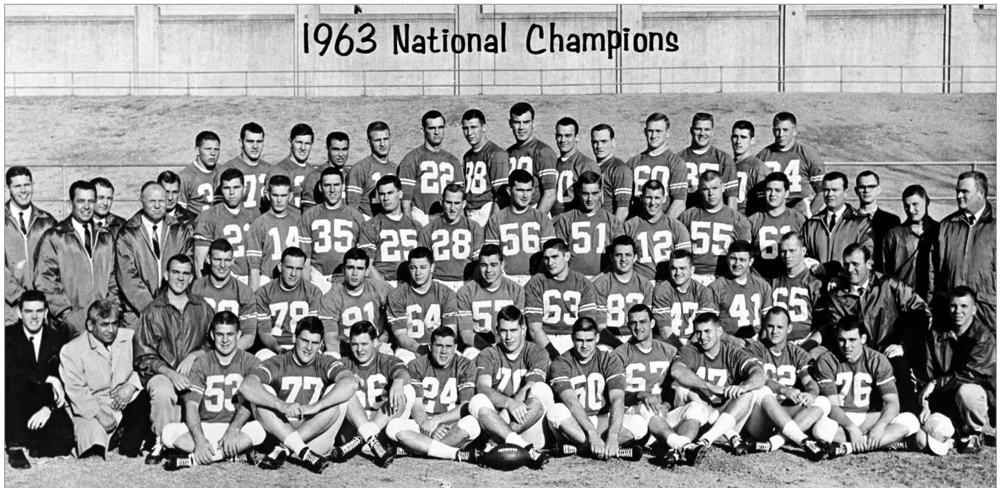
1963 National Champions

^ at Cotton Bowl (Dallas) // + Cotton Bowl (Dallas)