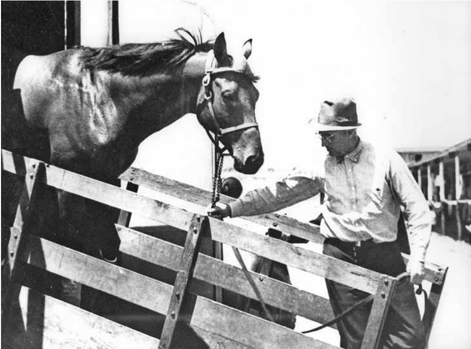
Triple Crown-winner Seabiscuit exiting the train to Del Mar with trainer "Silent" Tom Smith.

and owner who owns a house in Del Mar and usually performs once a season. Many famous musicians and bands including Ziggy Marley, The Cult, Billy Idol, and Christina Aguilera, also came to the track. Movie and television stars like Kevin Costner, Uma Thurman, Mario Lopez, Sean Astin, and California Horse Racing Board member Bo Derek also appear. 26