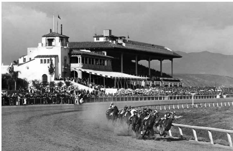
Agua Caliente Racetrack, Tijuana, Mexico ca. 1938.

alcohol discouraged many sporting events. Racing, however, soon made its reappearance just across the border in Mexico.