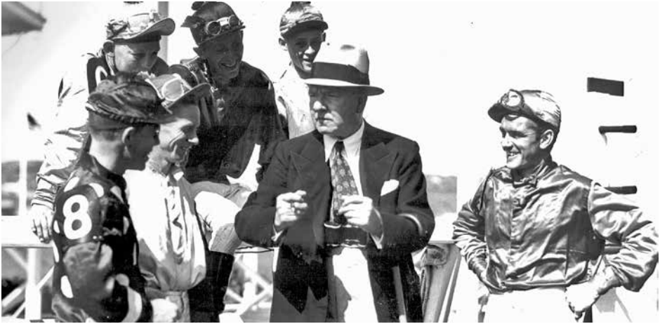
W.C. Fields sharing comedic stories with riders 1937.