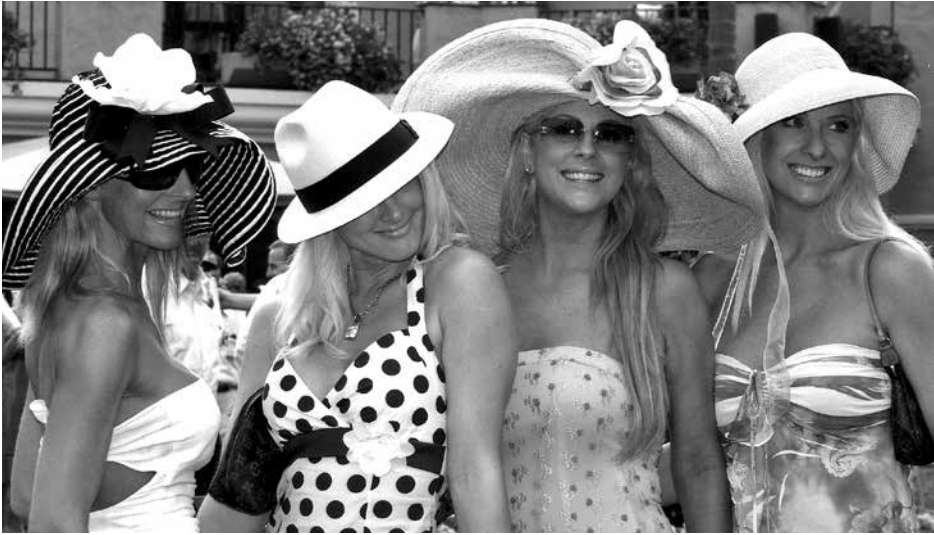
Opening Day Hats Contest Finalists.

going to the racetrack with his mother when he was about four or five years old and the old rattan chairs pinched his legs in his summer time shorts. “There were so many old memories that I almost cried,” he said. 52