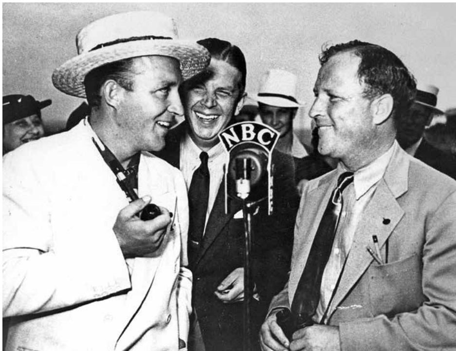
Bing Crosby live on NBC's Kraft Music Hall.

The song was plugged on NBC's radio show before the 1938 race meeting by Crosby, Pat O'Brien and Oliver Hardy. Today, the song still plays before the first race and the last race every racing day. 22