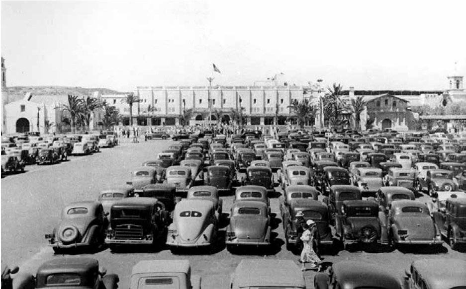
Cars fill the parking lot during Del Mar's 1937 opening season. Note the Mission Revival architecture in the background.