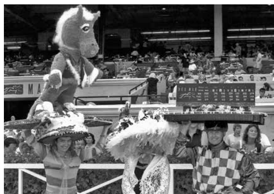
Opening Day, Hat Contest Winners.

Unfortunately, not all fans appreciated the new facilities. Those who had attended the racetrack for years missed the rickety old grandstand. They had