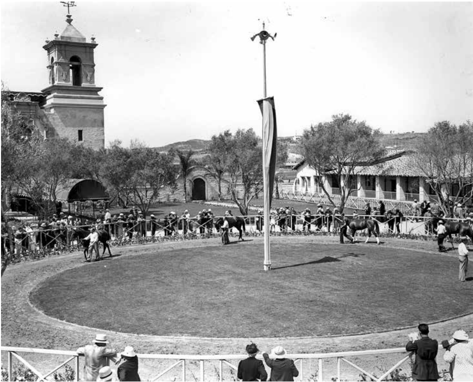
Del Mar's original paddock area.

William Lee “Bill” Shoemaker (1931-2003), nicknamed “Willie,” “Soft hands” or “Shoe,” was among the greatest jockeys Del Mar has ever showcased. In 1949, he became the first-ever apprentice jockey to win the leading rider title at Del Mar and he continued to break records there for the next forty years. In 1953, he set a record for 485 wins in a year. His record held for twenty years. Hall of Fame Jockey Chris McCarron said of him, “It’s a puzzlement to me how the guy got runs of horse after horse after horse after horse. His smooth, calm style was deceiving.” 33