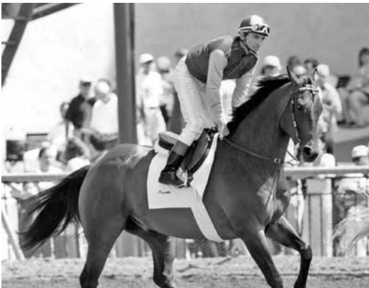
Best Paul, winner of the inaugural Pacific Classic, returned yearly to the track to lead other horses to the track in the one million dollar race.