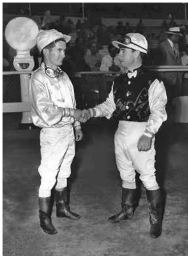
Jockeys Johnny Longden and Bill Shoemaker shake hands after deadlocking for the 1950 Del Mar riding title with sixty wins.