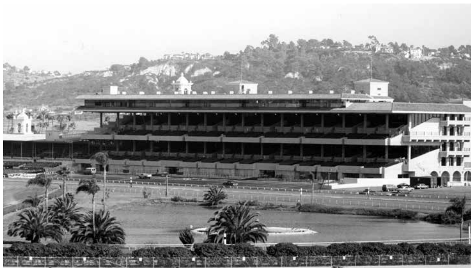
Del Mar Racetrack after 1991 renovation.

The National Racing Museum and Hall of Fame describes him as “one of the greatest Thoroughbred trainers of the 20 th century.” 42