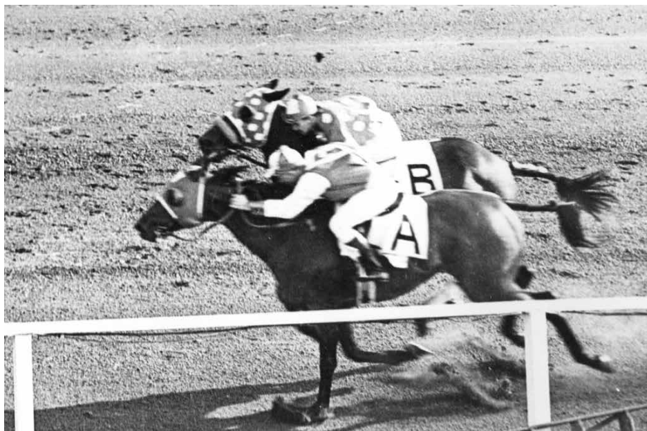
Seabiscuit and Ligaroti, head to head, come down the stretch, August 12, 1938.