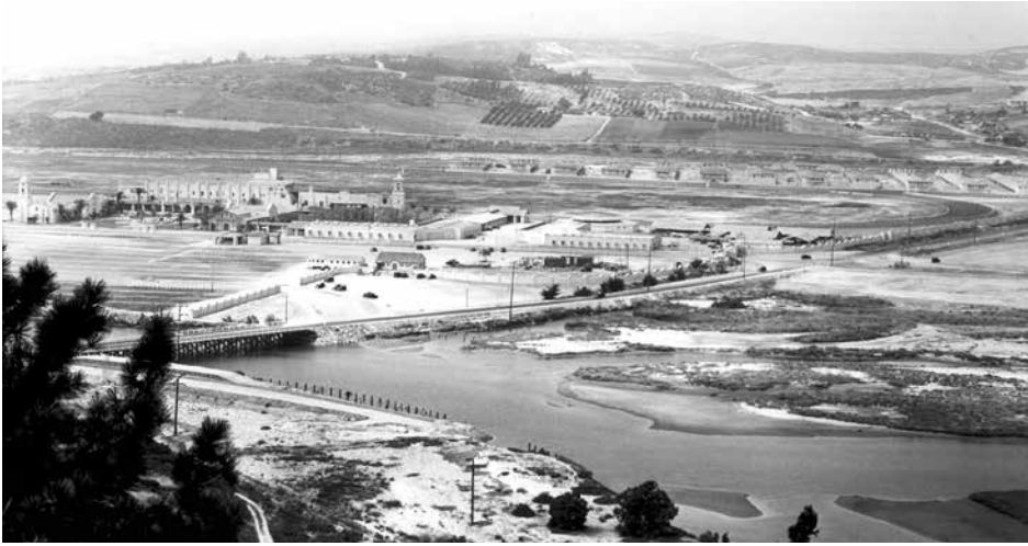
Del Mar fairgrounds and track, c. 1937-41.

Hollywood stars like Bing Crosby were also crucial to Del Mar's success. They saw horseracing as "the sport of kings" and found themselves becoming a kind of American royalty. Celebrities like Buster Keaton, Mary Astor, and Rita Hayworth had frequently joined Crosby and friends at Agua Caliente. Many of them had survived the depression and stock market crash and possessed the cash necessary to support construction costs. After Agua Caliente was shut down in 1934, they looked to other racing venues like Hollywood Park, Santa Anita, and Del Mar.