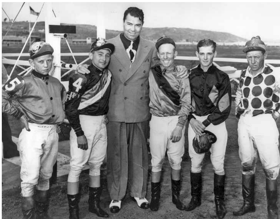
World Heavyweight Champion Jack Dempsey posing with jockeys, 1937.

Today, Del Mar works hard to maintain an amicable relationship with the film industry. Modern celebrities included Burt Bacharach, a horse racing fan