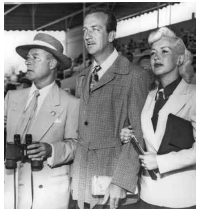
George Jessel, Harry James, and Betty Grable at Del Mar.