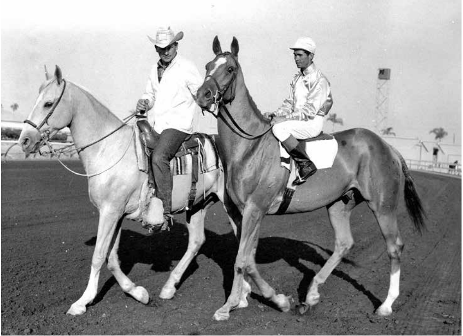
White Star Stables' Star Fiddle, winner of the Inaugural Del Mar Futurity 1948.