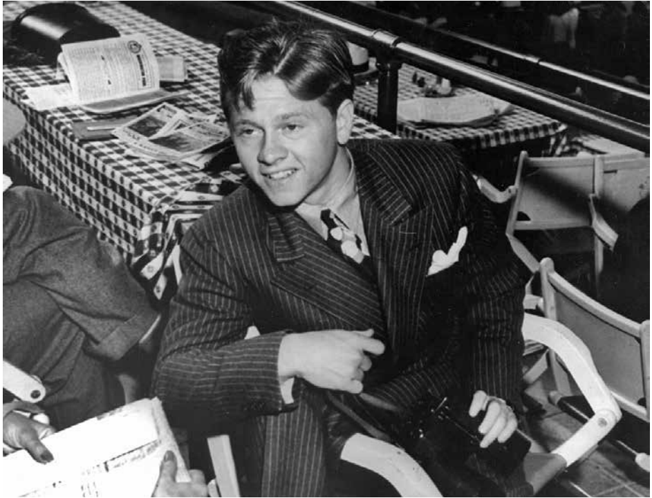
Mickey Rooney piloted his own plane to Del Mar.