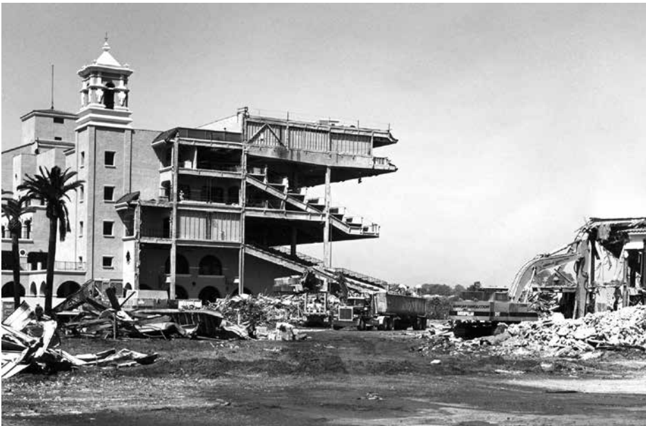
The eastern half of the original racetrack building and grandstand were demolished in 1992.