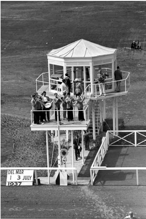
The steward's stand and bandstand, 1937.