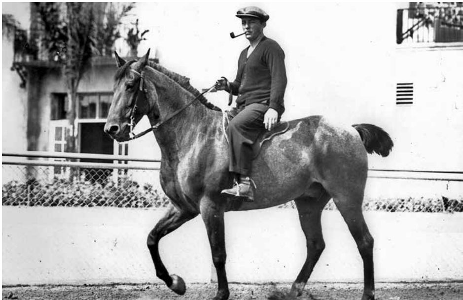
Bing Crosby on horseback viewing the grounds of Del Mar.

Del Mar’s enduring success results from its skill at attracting top horses, jockeys, and breeders, and its ability to draw in fans of every kind. It also created a bridge