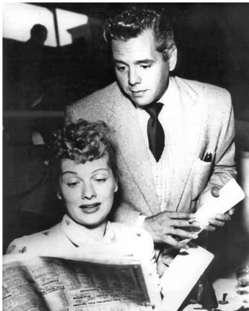
Hollywood stars Lucille Ball and Desi Arnaz, regulars at Del Mar, look at past performances in the racing form.

Seabiscuit broke out a half-length ahead of Ligaroti. Ligaroti drew right next to him and remained there