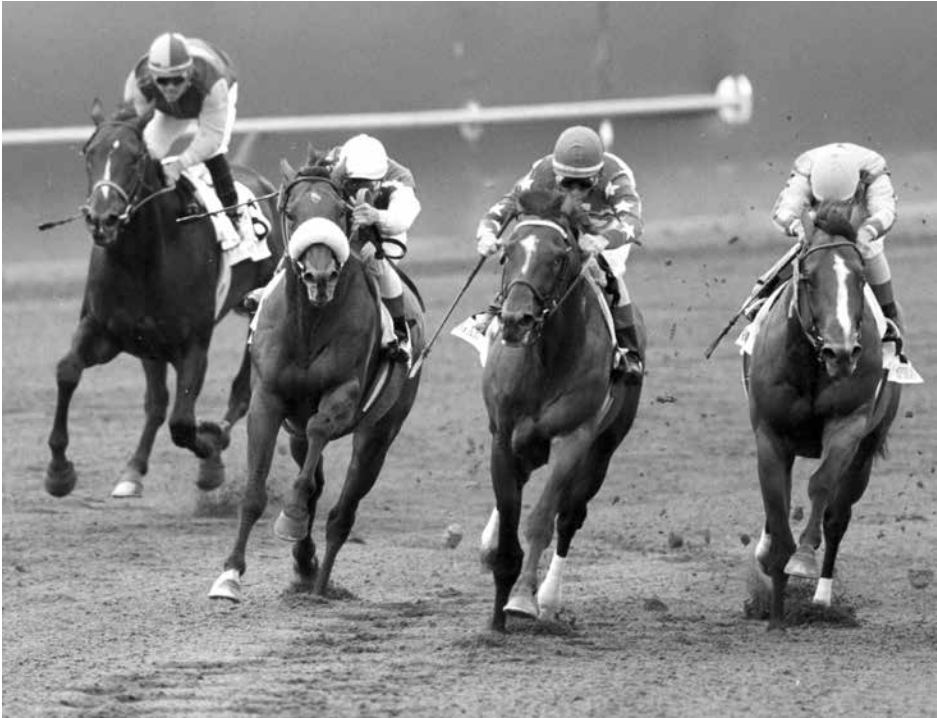
Horses continue to run at Del Mar.