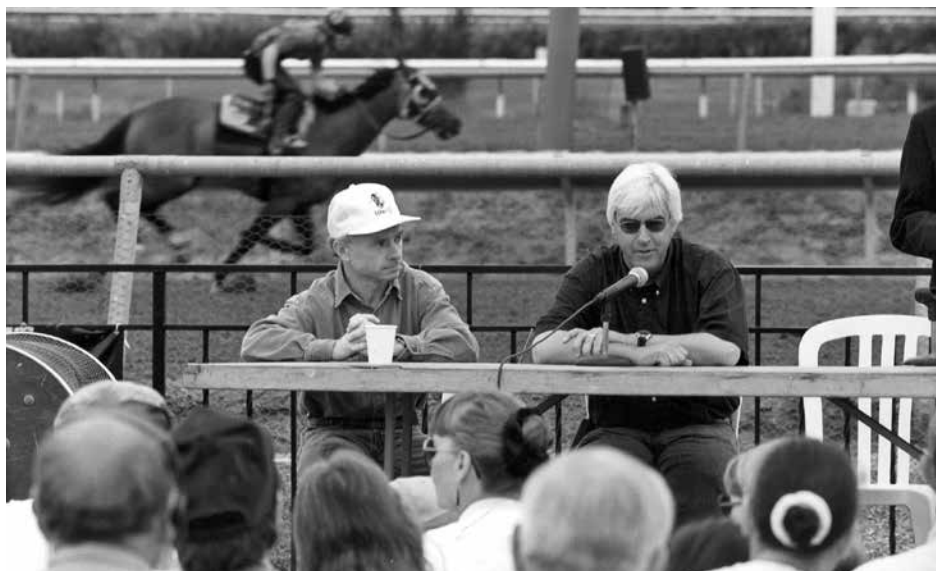
Trainer Bob Baffert speaking to fans at a morning workout.