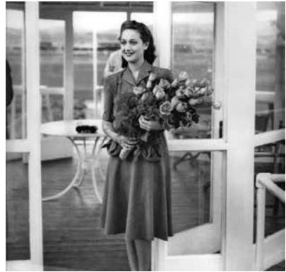
Dorothy Lamour poses in the summer of 1940.