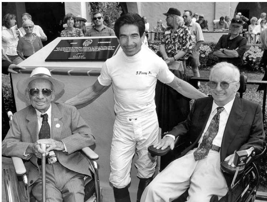
Del Mar's great jockeys, from left, Johnny Longden, Laffit Pincay, Jr., and Bill Shoemaker next to a plaque commemorating their accomplishments. Laffit won a total of 9,530 races before retiring.