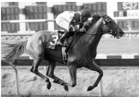
American Hall of Fame champion thoroughbred racehorse Azeri racing at Del Mar.

The Del Mar Fairgrounds made headlines in 2010 when California State Senator Christine Kehoe proposed selling the 400-acre site to the City of Del Mar and private investors for $120 million. The suggestion was intended to address two problems: California's ongoing budget crisis and tensions between the State of California's 22nd District Agricultural