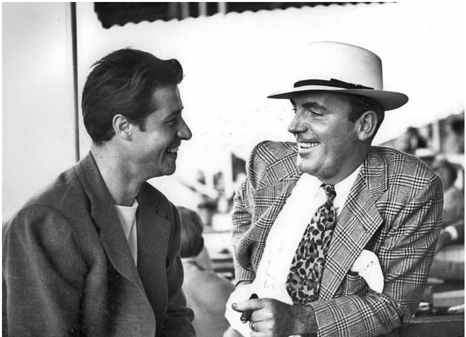
Pat O'Brien (right) with fellow actor Don Ameche.