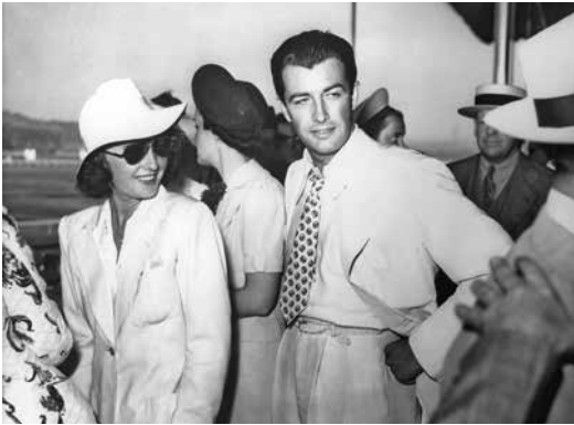
Barbara Stanwyck and Robert Taylor, 1937.