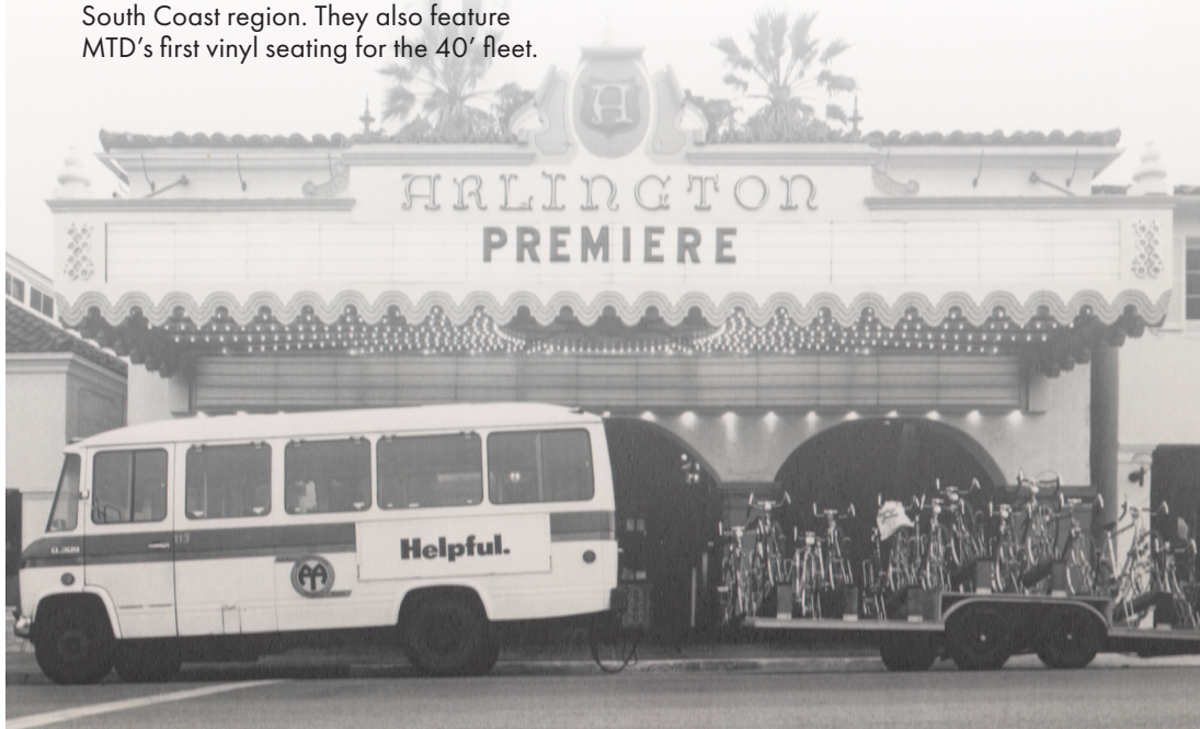
A-6 Santa Barbara, Calif., News-Press, Tues. Evening, Dec. 30, 1969

In 2018, MTD purchased 17 12-year old 40' buses with air conditioning from San Mateo Transit District to replace 20-year old 40' buses. In a financially prudent move, MTD reduced the average age of its overall fleet, reduced its emissions and expanded its fleet to provide First / Last Mile service to support the re-timed Amtrak train service from Ventura County.