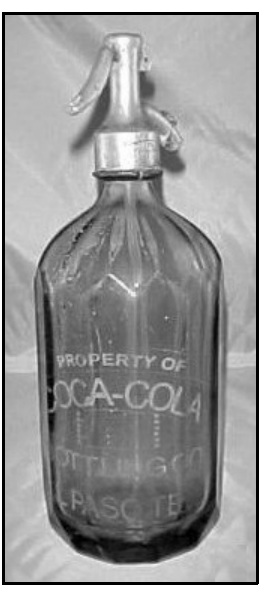
Figure 8-106 – Magnolia Coca-Cola siphon bottle

The variety of additional promotional objects offered by the Coca-Cola Co. is endless. This includes trays, pens, pencils, calendars, toys, and a huge number of other items. While Magnolia was less prolific in its extras, the local firm created various items through the years