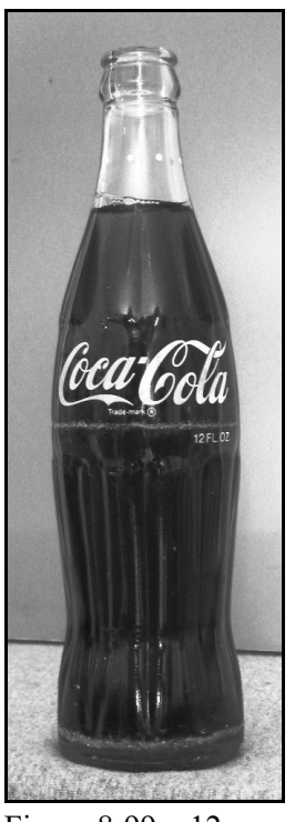
Figure 8-99 – 12ounce ACL bottle