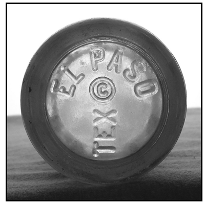
Figure 8-99 – IN U.S. PATENT OFFICE transitional base – Chattanooga Glass Co.