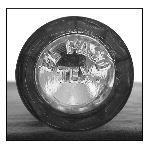
Figure 8-78 – Base of later Owens-Illinois 1923-patent base

The base of the bottle was embossed "EL PASO (arch) / TEX. (horizontal) / 2" The "TEX." was placed a the center of the base, almost enclosed within the arch formed by "EL PASO." The "2" is very faint (see Figure 8-77). Even though the Owens-Illinois logo is present