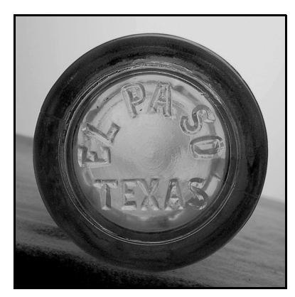
Figure 8-82 – D-patent base – Chattanooga Glass Co., 1941

1. With its Circle-C logo, the Chattanooga Glass Co. used two variations of basemarks during this period. The earliest, used by at least 1941, had an arched "EL PASO" at the top and a horizontal "TEXAS" at the bottom (Figure 8-82). The embossing is very bold and strong on the examples I have seen. This style of basal embossing probably continued until 1946. 2. By at least 1948, Chattanooga Glass had adopted a new basemark. The "EL PASO" was still arched at the top, but "TEX." was now vertical, coming up from the bottom (Figure 8-83). Note also the skirt embossing for the bottle in Figure 8-80.