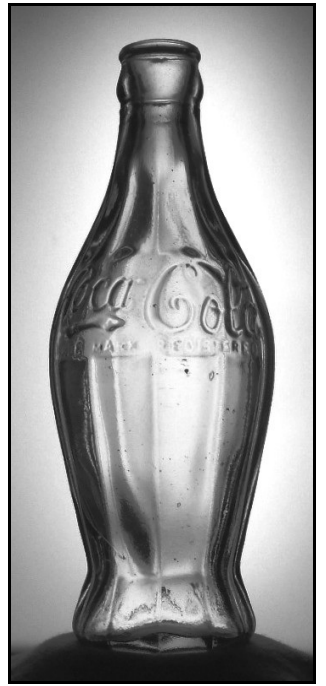
Figure 8-68 – Copy of the prototype 1916 bottle – These were never used

Currently, we have no certain way to discern how early Magnolia adopted the hobble-skirt bottle. The date of hobble-skirt bottle adoption was probably dependent on the last year that Magnolia ordered the straight-sided bottles. There is virtually no question that Smith required his employees to get as much use out of bottles as possible. As noted above, straight-sided El Paso Coke bottles are rare. Since Magnolia bottled Cokes in those bottles from at least 1911 to 1917, that means the bottles were used until they wore out.