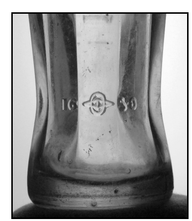
Figure 8-86 – Skirt embossing from Owens-Illinois, 1950

4. During the entire D-105529 period, the Owens-Illinois Glass Co. continued to use its Oval-I and elongated diamond mark on the skirt (Figure 8-86). The base, however, used the typical arched "EL PASO" above "TEX." – but