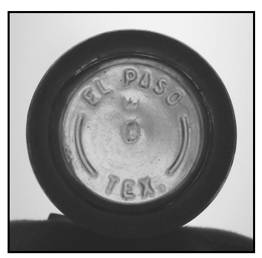
Figure 8-92 – IN U.S. PATENT OFFICE base with line spacers – Owens-Illinois (new logo)