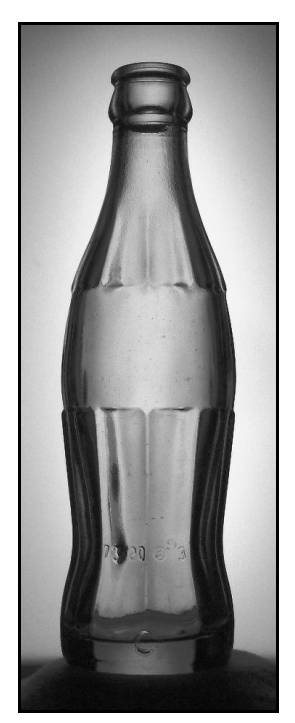
Figure 8-104 – 1973 bottle with ACL missing; note lack of ribs at center labeling

Very little has appeared in the literature about non-returnable bottles. According to Dean (2010:149), Coca-Cola produced straightsided, non-returnable glass bottles in 1961 and test marketed re-sealable plastic contour bottles in 1970. The plastic bottles entered the regular market in 1975. In 1992, however, Coke introduced an eight-ounce, non-returnable, green-glass contour bottle, and other types followed. The ribs separating the front and back labeling areas were removed to allow the insertion of refund instructions and bar codes. An unusual bottle with an El Paso (random) base somehow missed the ACL but clearly shows the lack of ribs separating the labeling areas (Figure 8-104).