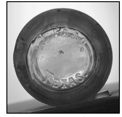
Figure 8-74 – Base of 1915patent bottle with "TEXAS" in inverted arch and no number – blue bottle

Although the original design patent was good for 14 years, thus expiring in 1929, Chapman J. Root applied for a new patent in 1922. Root received Design Patent No. 63,657 on December 25, 1923 – a bottle forever after known as the "Christmas" Coke bottle (Figure 8-75).