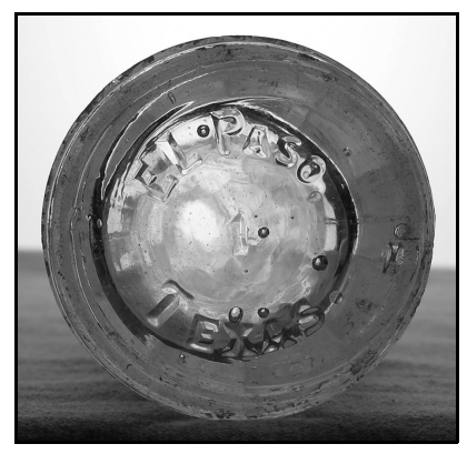
Figure 8-73 – Base of 1915patent bottle with "TEXAS" in inverted arch and "1"