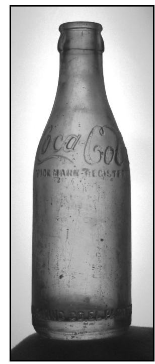
Figure 8-64 – Mouthblown, straight-sided Coke bottle from Magnolia

Dating: [1911-ca. 1914] Mouth-blown Coke bottles with no volume information may have been used as early as 1911 (although generic