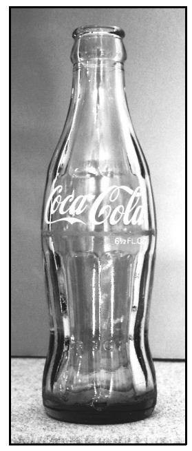
Figure 8-97 – ACL hobble-skirt bottle with case wear

The 1965-1968 bottle was almost identical except that volume was included on both front and back and the word "TRADE" was above the word "MARK" – also on both sides. By this point, Coca-Cola had entered the Random Baseplate period, so the city/state designation was irrelevant (McCoy 2009:56-59). However, these exist with the El Paso basemarks.