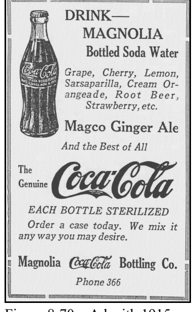
Figure 8-70 – Ad with 1915patent Coke Bottles (El Paso Herald 6/9/1920)

Even better drawings appeared in the 1921 El Paso City Directory (Figure 8-71). Kendall (1979:13) placed the final manufacture of the 1915 hobble-skirt bottles at 1930, and, again, Porter's empirical evidence supports that date, although Porter noted that only the Root Glass Co. continued to produce the 1915 bottles after 1927. All other glass factories ceased the manufacture of this earliest hobble-skirt style during 1927.