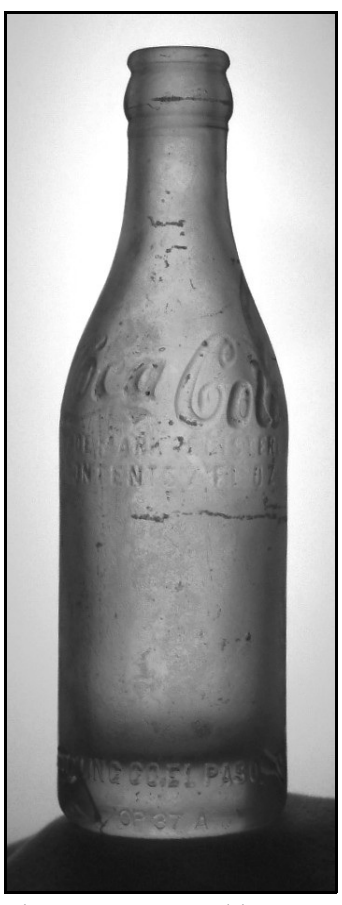
Figure 8-65 – Machinemade, straight-sided Coke bottle from Magnolia

1916, none of the bottles were actually made until the following year, and all franchises had not implemented the new container until 1920. Even if Magnolia adopted the "hobble-skirt" bottle early (by 1917), there should still have been a 1916 or 1917 straight-sided bottle.