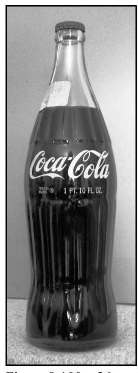
Figure 8-100 – 26ounce ACL bottle

12-ounce bottle embossed with the El Paso designation and a 1970 date code (Figure 8-99). Because of the Random Baseplate, the El Paso name is completely irrelevant and does not even mean that the El Paso