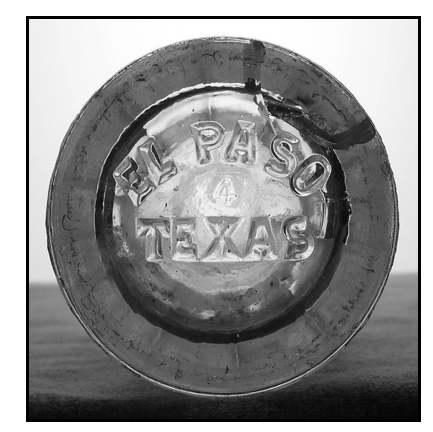
Figure 8-72 – Base of 1915patent bottle with horizontal "TEXAS" and "4"

Dating: (ca. 1918-ca. 1919 or later) Although there are (at least) four variations of the 1915-patent bottles, all are quite scarce. It is quite possible that Magnolia did not use the hobble-skirt bottles until 1919 (the only date-coded bottle I have found thus far), although the lack of other date codes suggests an earlier use (see discussion below). Since the Coca-Cola Co. did not require the use of city/state designations until May 1918, bottles with "EL PASO" basemarks were probably not made until after that point. The Coca-Cola main office requirement for manufacturer's marks and date codes did not take effect until July 1919. Although there were exceptions (e.g., bottles with no city/state markings made long after 1918), these dates are probably reflected in the El Paso bottles. Thus, the bottles with no date codes or manufacturer's logos were