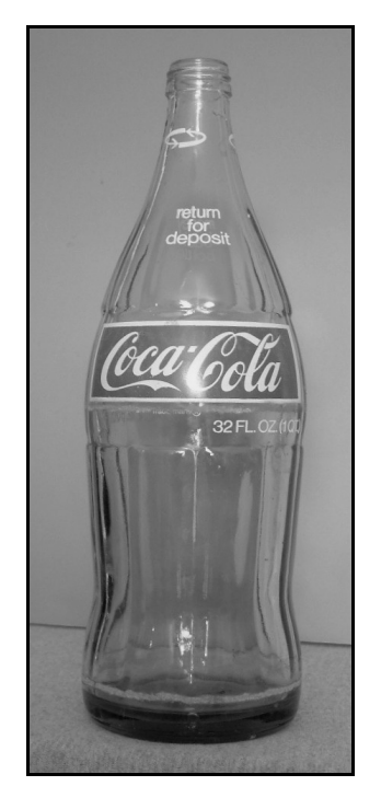
Figure 8-105 – Red label Coke bottle

Another variation was used during the 1972-1990s period. These are distinctive with "Coca-Cola" in white ACL on a white-outlined, red rectangular background (Figure 8-105). The