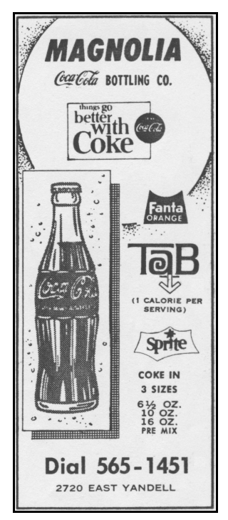
Figure 8-98 – Magnolia ad for 6½-, 10- and 16-ounce sizes (El Paso City Directory, 1964)