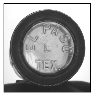
Figure 8-90 – IN U.S. PATENT OFFICE transitional base – Laurens Glass Works

3. In 1952, Magnolia shifted its purchases to Owens-Illinois, and that may have continued until 1957 – although it is possible that I have just not found bottles made by others during that period. A 1957 Owens-Illinois bottle has the I, O, and elongated diamond mark in the center of the line spacer base format (Figure 8-91). A "W" is embossed above the logo, indicating a manufacture at Plant No. 15, Waco, Texas. The state designation "TEX." included a period.