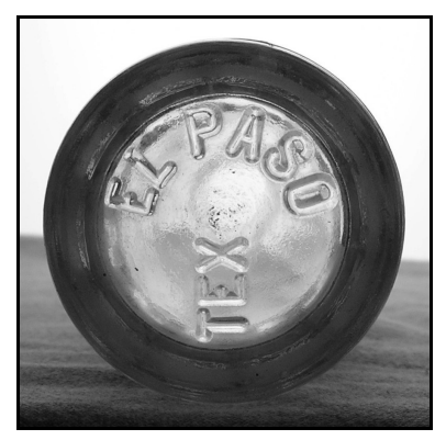
Figure 8-83 – D-patent base – Chattanooga Glass Co., 1948

According to D. Lyon, Chattanooga Glass began engraving bases by machine in 1946 (Bill Porter, personal communication, 6/20/2010), so that may have been the year of the design change also.