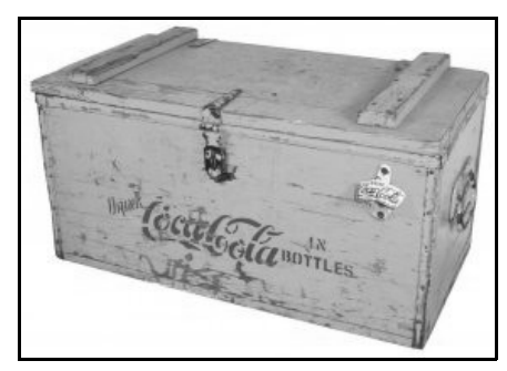
Figure 8-108 – Wooden Coca-Cola cooler

An eBay auction featured a very unusual wooden chest type cooler. Although the seller believed it was used during the depression to transport cokes from the bottler to the distributor, it was more likely the precursor of the aluminum cooler that was later developed. The box is 26" wide, 13" high, and 13 3/4" deep. The paint is a mustard yellow with red letters. The front of the chest is marked "Drink Coca-Cola" with "When empty return to Coca-Cola" stenciled on the back. The bottom is stenciled in black "Coca-Cola Bottling Co, 321 Myrtle Ave., El Paso, Texas" (Figure 8-108) The inside is lined with tin for insulation, and an opener is mounted on the top right corner.