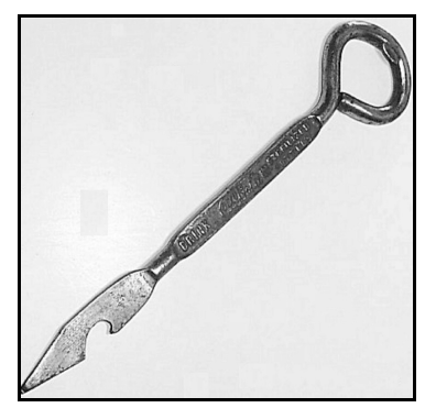
Figure 8-107 – Magnolia bottle opener

The development of cases, of course, parallels the development of bottles. The older, Hutchinson-style bottles were transported in cases made to hold the bottles with the finishes down to keep the leather or rubber gaskets wet and provide a good seal. The bases of the bottles were therefore at the top and visible to easy inspection.