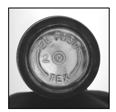
Figure 8-94 – IN U.S. PATENT OFFICE base with line spacers – Chattanooga Glass, Corsicana plant

5. By 1954, Magnolia was once again buying bottles from the Chattanooga