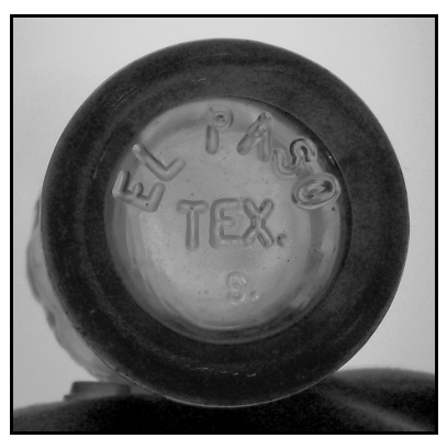
Figure 8-87 – D-patent base – Owens-Illinois, Streator plant, 1950

3. When the position of the manufacturer's marks migrated from the heels of the Coke bottles to the skirt position, in 1934, the Laurens Glass Works stopped using its traditional "LGW" logo and used a capital "L" – but only on Coke bottles. The "L" was noticeably larger than the surrounding numbers (Figure 8-84). The basemark on the D-105529 bottles included the arched "EL PASO" above "TEX." centered at the bottom of the base (Figure 8-85). This remained through 1951.