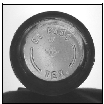
Figure 8-91 – IN U.S. PATENT OFFICE base with line spacers – Owens-Illinois (old logo)