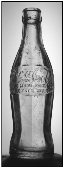
Figure 8-69 – Hobble-Skirt Coca-Cola bottle – BOTTLE PAT'D NOV. 15, 1916.

The date may also be predicated by how many paper labels Smith had on hand. His documented business practices almost certainly indicate that he made full use of all his resources. It would therefore be entirely in character for Smith to have delayed the adoption of the hobble-skirt bottles until the entire supply of embossed, straight-sided Coke