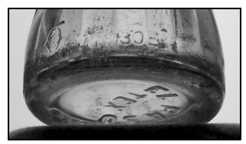
Figure 8-77 – Heelmarks on 1923patent bottle with Owens-Illinois logo and Graham codes

The heel of the bottle is embossed with the Owens-Illinois I-oval-and-diamond mark. To the right of the logo is "30E" – followed by "G899" about a quarter-turn of the bottle to the right. To the left of the Owens-Illinois logo is