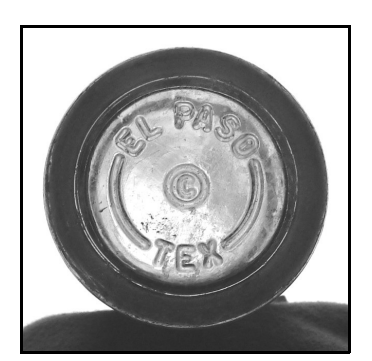
Figure 8-93 – IN U.S. PATENT OFFICE base with line spacers – Chattanooga Glass, Chattanooga plant

4. In 1954, Owens-Illinois formally adopted a new, simplified logo – and "I" within an "O" – although old marks continued to be used sporadically until at least 1960 (Figure 8-92). Again, I have not discovered when the shift occurred with El Paso Coke bottles, but the new logo was in place by the time Magnolia ordered its 1956 bottles. The only difference with the 1956 bottle is the logo change; it was still made at Waco. Note that both logos were being used during the 1956-1957 period.