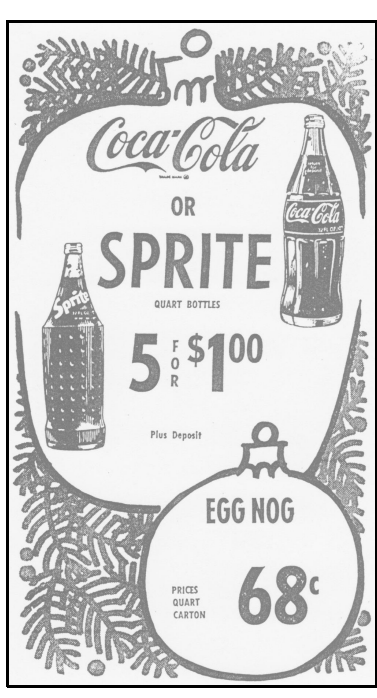
Figure 8-102 – Ad for Sprite ( Alamogordo News 12/31/1973)