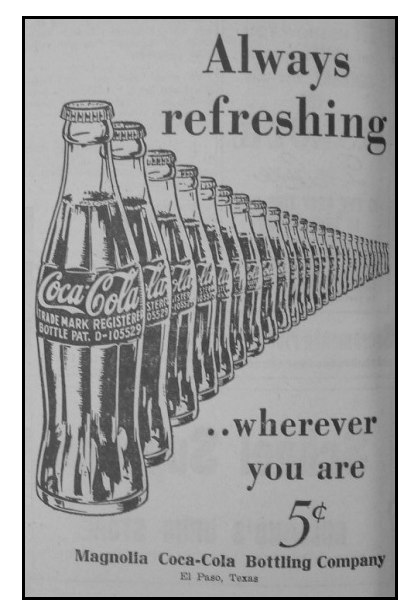
Figure 8-81 – D-105529 bottle in 1940 ad ( Alamogordo News 9/5/1940)