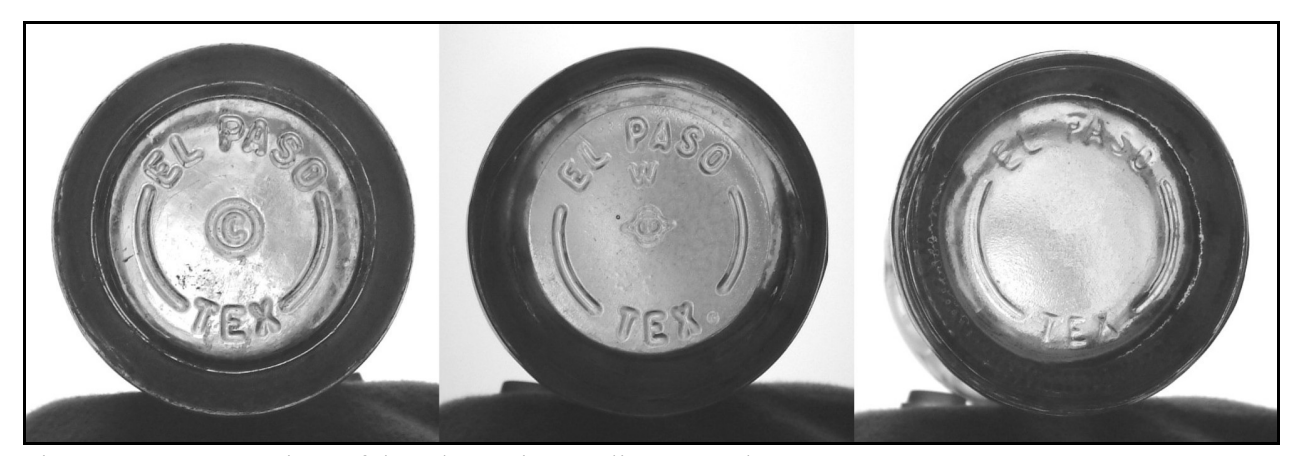
Figure 8-95 – Comparison of three letter sizes on line spacer bases

Line space bottles from El Paso come with three different sizes of letters – small, medium, and large (Figure 8-95). The first two of these appear to vary by manufacturer, but the later bottles all tend toward the smaller letters. The size may have became standardized at some point, although I have no documentary evidence of that.