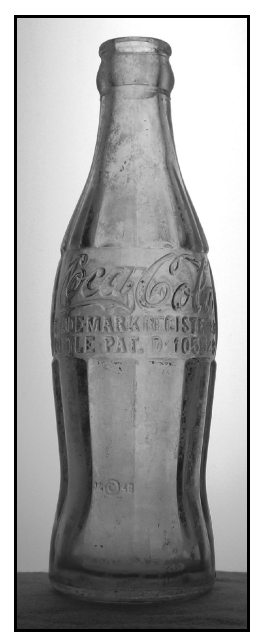
Figure 8-80 – Hobble-Skirt Coca-Cola bottle – BOTTLE PAT. D-105529

The third and final patent was issued to Eugene Kelly of Toronto, Canada. Kelly received Design Patent No. 105,529 on August 3, 1937, and assigned it to the Coca-Cola Co. For the first time, the Coca-Cola Co. had actual control of the bottle that made it famous (Figure 8-79).