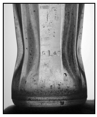
Figure 8-84 – Skirt embossing from Laurens Glass Works, 1948