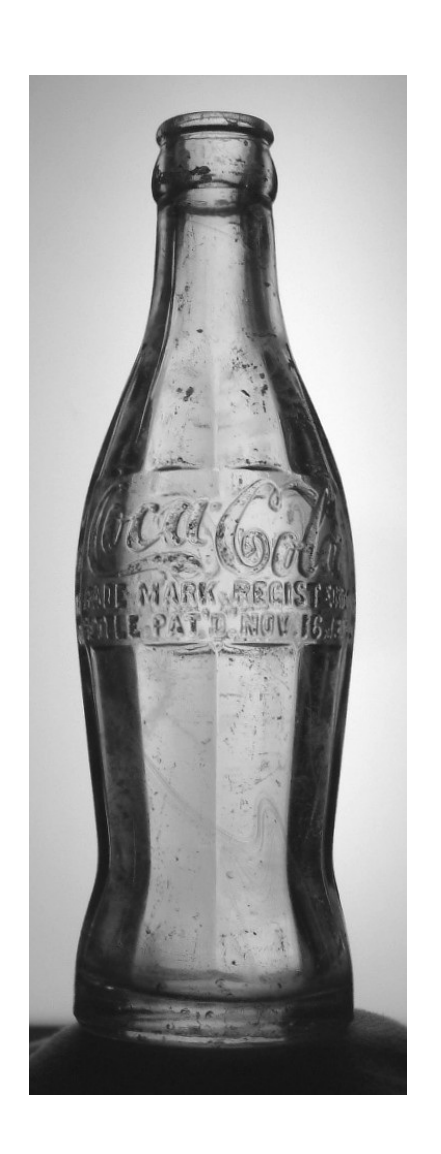
© Bill Lockhart 2010 [Revised Edition – Originally Published Online in 2000]