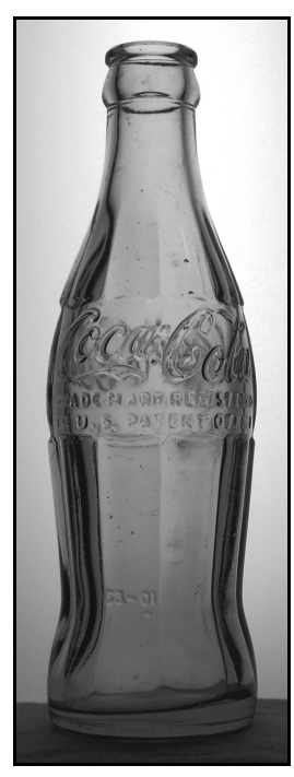
Figure 8-88 – Hobble-Skirt Coca-Cola bottle – IN U.S. PATENT OFFICE

1. To deal with the sudden change mandated by Coca-Cola and still use up the old molds, the glass houses engraved their logos on the baseplates for the first runs of the new bottles. The Chattanooga Glass Co. added the Circle-C to its baseplate just above the vertical "TEX." (Figure 8-89). I have not discovered how long the altered baseplates were used, but I suspect it was only during the first year of the change. The 1952 bottle was altered, but, by 1954 (the next example I have seen), the line spacer baseplates were in use.