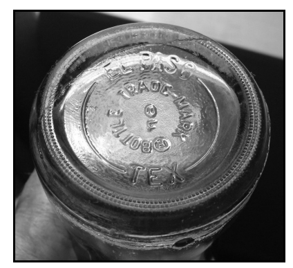
Figure 8-96 – Original Random Baseplate format – central embossing refers to the bottle trademark

Another way to recognize a Random Baseplate Bottle is by an addition to the basemark. A typical mark from 1965 or later reads "EL PASO (arch) / BOTTLE TRADE MARK ® (in a circle around the manufacturer's mark) / TEX (inverted arch with line spacers connecting TEX to EL PASO)" (Figure 8-96). The words "BOTTLE TRADE MARK" refer to the 1960 trademarking of the bottle discussed in the section on the "IN U.S. PATENT OFFICE" variation above (Porter [2009]:[2].