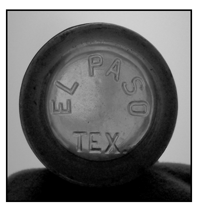
Figure 8-85 – D-patent base – Laurens Glass Works, 1948

3. When the position of the manufacturer's marks migrated from the heels of the Coke bottles to the skirt position, in 1934, the Laurens Glass Works stopped using its traditional "LGW" logo and used a capital "L" – but only on Coke bottles. The "L" was noticeably larger than the surrounding numbers (Figure 8-84). The basemark on the D-105529 bottles included the arched "EL PASO" above "TEX." centered at the bottom of the base (Figure 8-85). This remained through 1951.