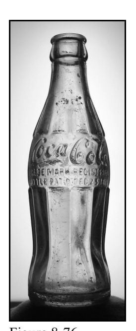
Figure 8-76 – Hobble-Skirt Coca-Cola bottle – BOTTLE PAT'D DEC. 25, 1923

Unfortunately, my information about these bottles in El Paso is very