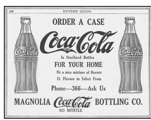
Figure 8-71 – Ad with 1915-patent Coke Bottles (El Paso City Directory 1921)