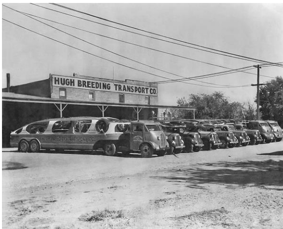
Hugh Breeding Terminal at Baxter Springs