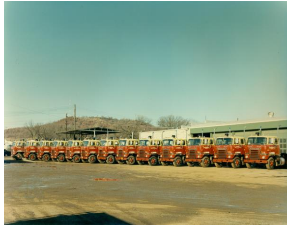
Hugh Breeding Truck Yard Late 1960's