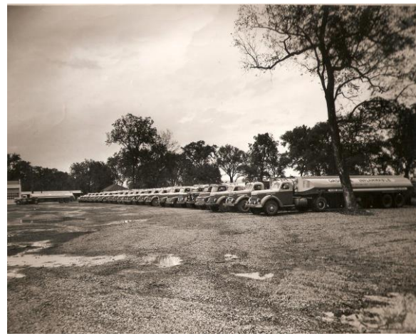
Hugh Breeding Truck Yard 1951