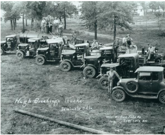
Hugh Breeding Seminole Trucks