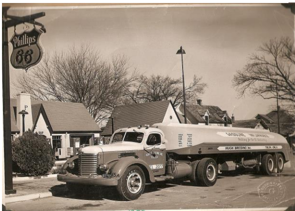
Truck at Phillips 66 Station in 1950