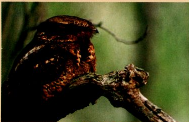
A spring overshoot, well north of its breeding range, was this Chuck-will's-widow at Marblehead, Massachusetts, May 12, 1990.