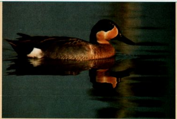
This hybrid duck at Saint-Zacharie, Quebec, on April 27, 1990 presented a mystery. Green-winged Teal was clearly one of the parent species, but it was not immediately evident what the other parent species could have been.