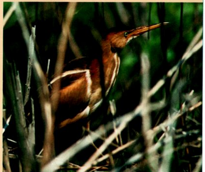
Reports of bitterns were up slightly in the Appalachian Region this season. This female Least Bittern was at Presque Isle State Park, Pennsylvania, on May 27, 1990.