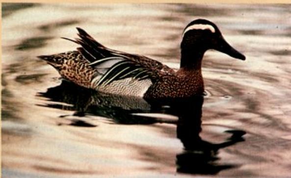
Male Garganey near Bismarck, North Dakota, on May 12, 1990. First state record. Individuals of this species were widely scattered over the continent this spring.