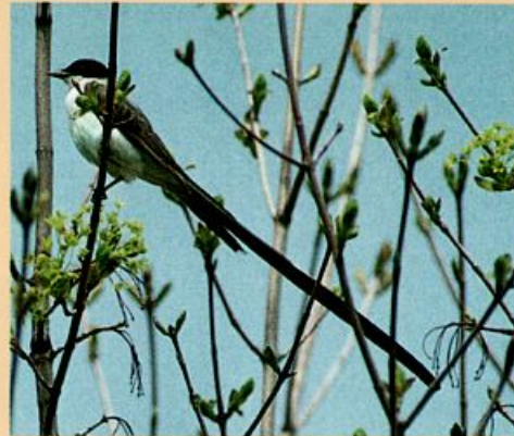
Fork-tailed Flycatcher at Concord, Massachusetts, May 2, 1990. Spring records of this South American visitor in North America are far less frequent than fall records.