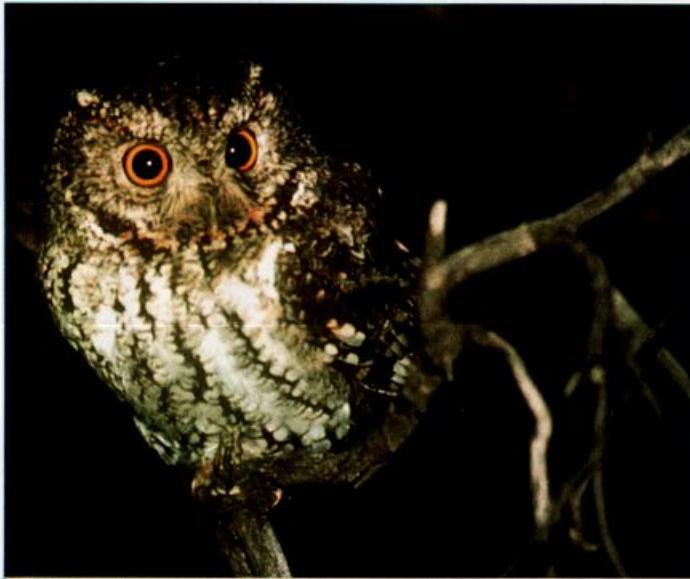
Whiskered Screech-Owl in Cottonwood Canyon, Peloncillo Mountains, New Mexico, March 13, 1990. The species may have colonized this area only recently.