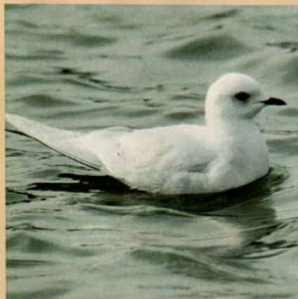
Vision from the Arctic: this Ross' Gull that visited Baltimore, Maryland, in March and April 1990 was one of the southernmost ever recorded.