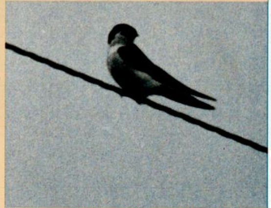
Violet-green Swallow in Holmes County, Ohio, May 16, 1990. First state record, and one of very few for the east.