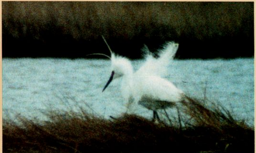
Adult Little Egret at Hampton Falls, New Hampshire, April 29, 1990. Second for the United States. The feathers are being raised by the wind, showing off the two very long single head plumes that are thought to be diagnostic for this species.