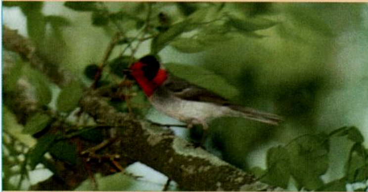
The first Red-faced Warbler ever recorded in the Central Southern Region. This vagrant dazzled over 200 observers in Cameron Parish, Louisiana, April 27-30, 1990.