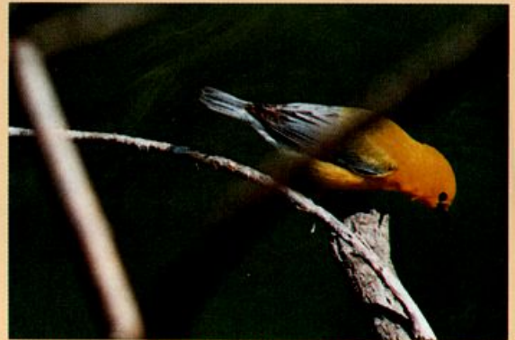
Prothonotary Warbler at Wheat Ridge, Colorado, May 20, 1990.