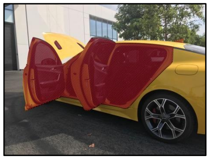
Inner Body / Interior