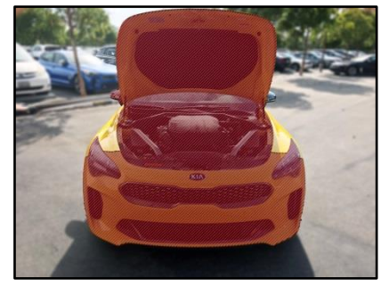
Engine Bay & Inner Hood