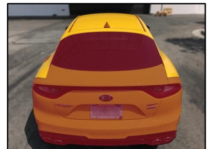
Tail Gate Assembly (except metal part of tail gate), Roof Antenna, Roof Molding