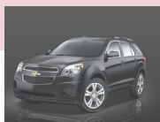
Chevy Equinox $500/mo.