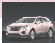
Cadillac XTS Luxury $900/mo.