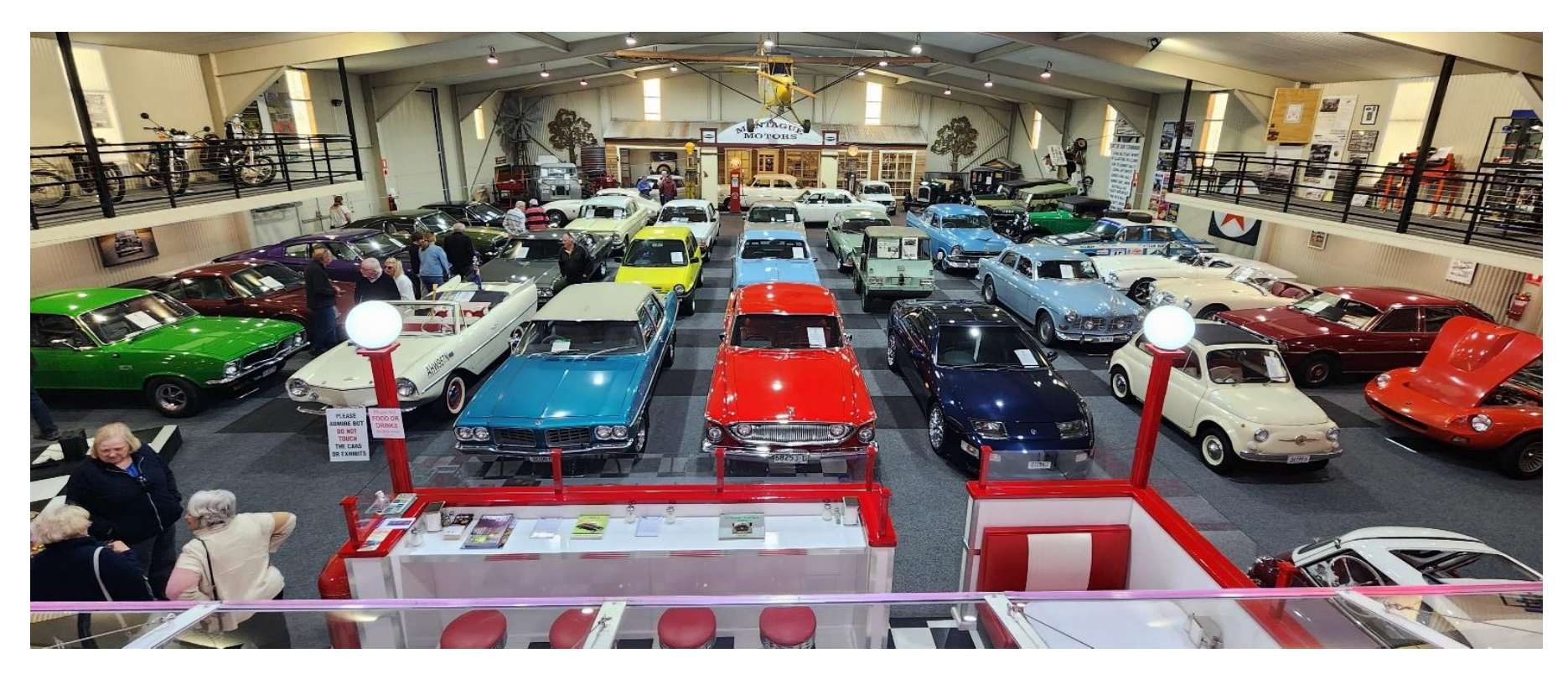
Car Club Museum – view from the gallery looking towards the mockup of the old garage

Opened in February 2022 it is a credit to the club members and the wider community and houses historical vehicles, 10 of which are owned by the club and motor bikes as well as motoring memorabilia, posters, photos, an extensive model car collection and a mockup of an old garage facade with old petrol pumps.