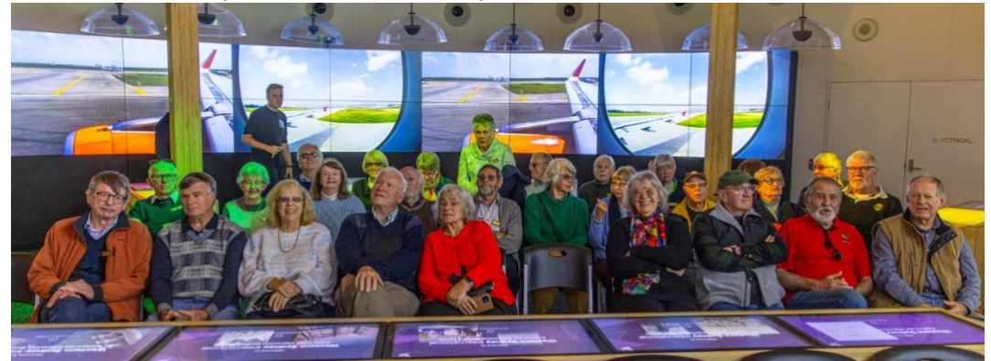
Group 1 settling in to enjoy the excellent Audio Visual presentation

A futuristic artist impression when 2 runways and 2 terminals are in use