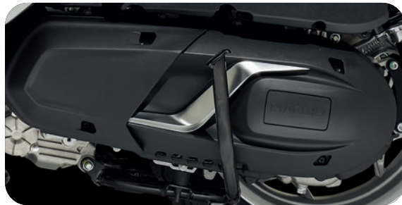
NEW 400 HPE ENGINE

The single-cylinder, four-stroke and four-valve 400 hpe engine with liquid cooling and electronic injection is considered to be one of the best in its category. Piaggio technical research focused on mechanical and thermodynamic performance, reducing the vibration and noise level. Its motorcycling heritage shines through in a few choices such as the automatic multi plate wet clutch, which ensures an extraordinary riding experience even in conditions of thermal stress and consistent performance over time.