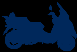
BLU ZAFFIRO OPACO