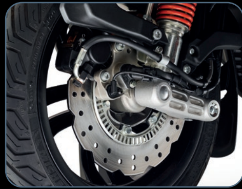
WAVE BRAKE DISCS