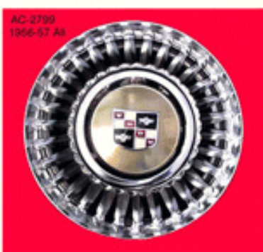
REMEMBER — Full Chromo Discs are still highly popular. Display and sell these too. Give 'em a choice and you'll not lose a single sale.

Here's the hottest accessory that's come over the horizon in a long, long time. Get in on the ground floor—order quick—and start cashing in on the extra sales and profits now. Fits all late model Studebakers; in fact, it can be installed on most cars with 15" wheels. Four are required per car. Equip demonstrators and show cars . . . put 'em on your accessories displays in the showroom, parts store and service station . . . or on actual spare wheels you may have lying around. Tell all your salesmen . . . and fire them up to present, demonstrate and SELL Spoke-Type Wheel Discs.