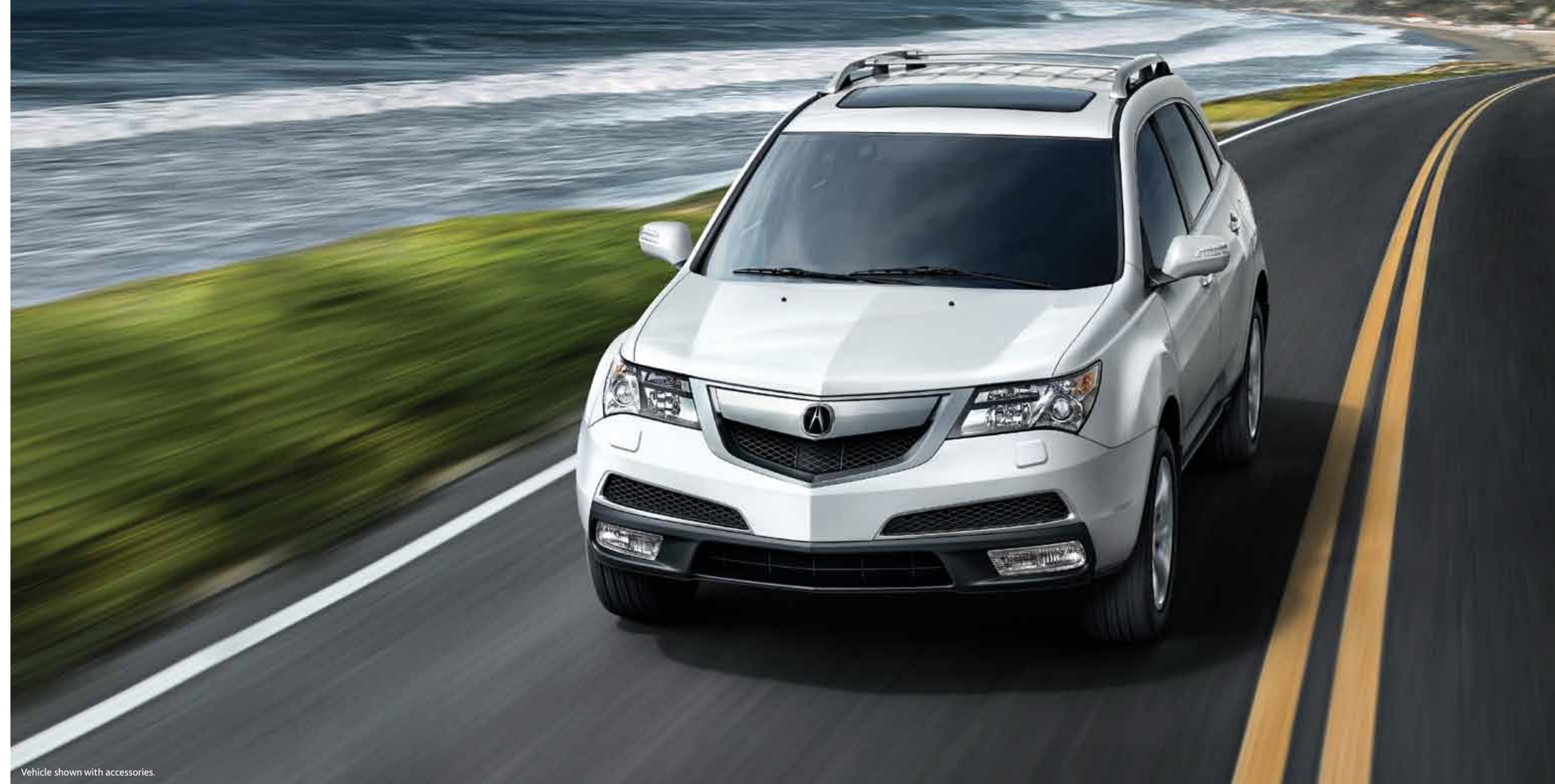
Vehicle shown with accessories.