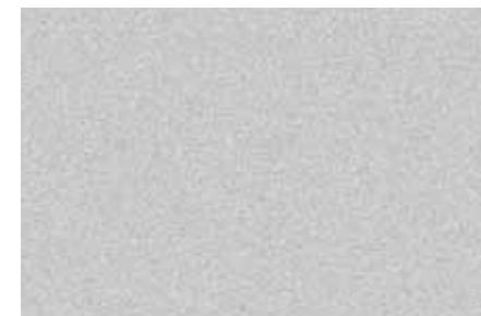
Alabaster Silver Metallic • NH-700M