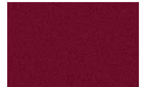
Basque Red Pearl II • R-548P