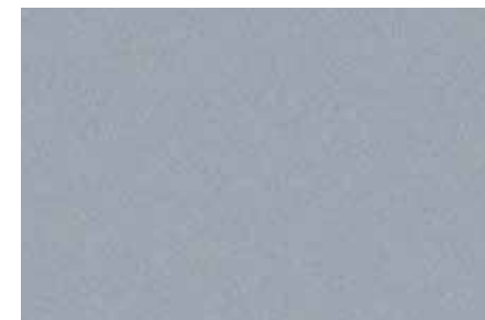
Forged Silver Metallic II • NH-789M