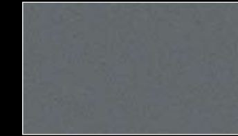
Polished Metal Metallic | NH-737M