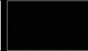
Crystal Black Pearl | NH-731P