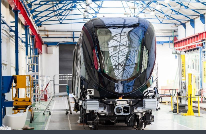
Riyadh Metropolis train in Alstom Katowice Site