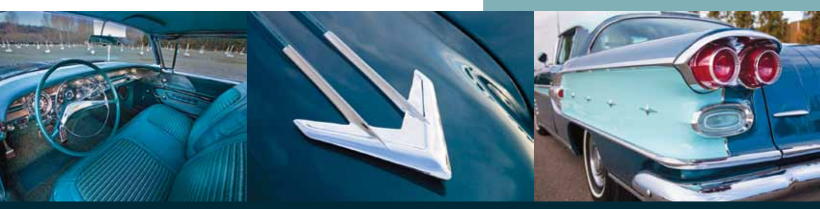
The name "Bonneville" was first applied to a 1954 GM Motorama concept car. The first production Bonneville appeared in 1957. Each dealer received one.