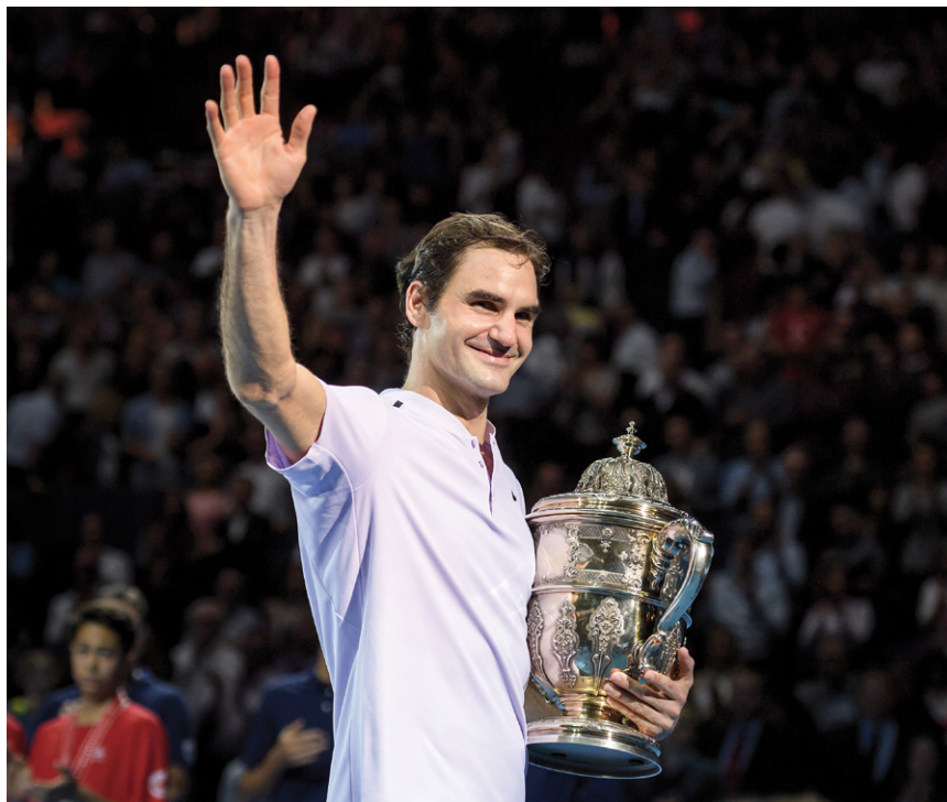
Roger Federer won his hometown title at Basel in 2017 to pass Ivan Lendl for second place with 95 championships.