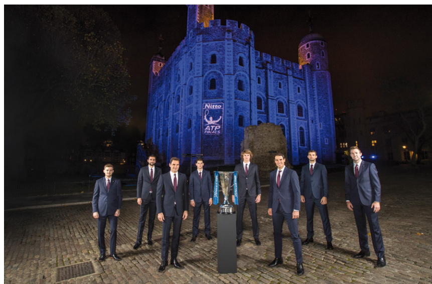
The 2017 Nitto ATP Finals qualifiers pose for the official photo at the Tower of London.