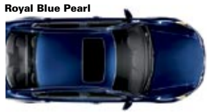
Royal Blue Pearl

No matter what interior trim you choose, you can be sure of one thing: legendary Honda quality. From the materials chosen to the meticulous craftsmanship employed, the inside of the new Accord is designed to retain its new-car look and feel for years to come. As for the outside, the 11 exterior colors are all corrosion-resistant and have been given a tough, durable finish to help preserve your Accord's sleek, glossy appearance.