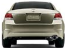
Bold Beige Metallic