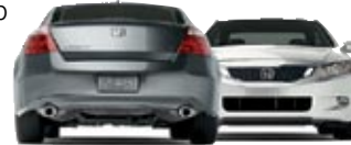
Polished Metal Metallic