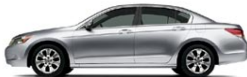
Alabaster Silver Metallic