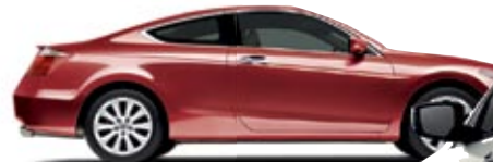
San Marino Red