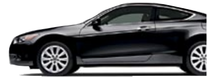
Nighthawk Black Pearl