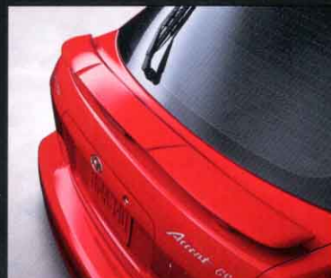
Add a sporty look to your Accent L or GS with an aerodynamic bodycolor rear spoiler.