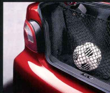
The Accent GL's available cargo net helps keep things in place.