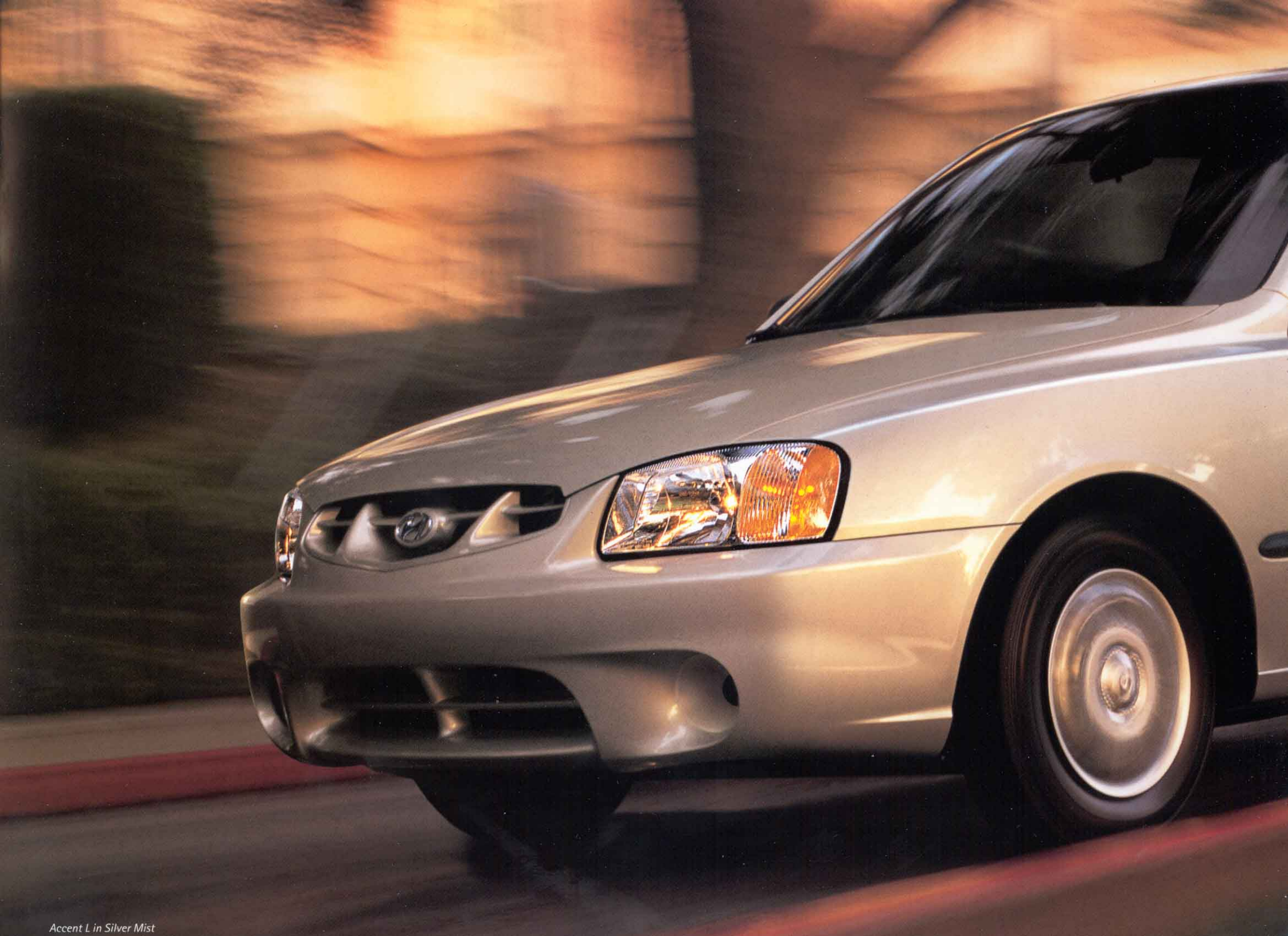
Accent L in Silver Mist