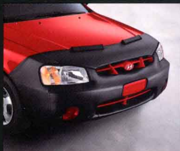
Protect your finish with a durable, high-quality front nose mask.

Your Hyundai dealer can show you a full line of genuine Hyundai accessories designed to make driving your Accent even more enjoyable. To keep your Hyundai looking and running like new, always use genuine Hyundai parts and accessories, which meet our own strict standards for quality and durability.