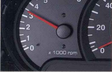
Clearly marked gauges are a driver-friendly feature. An analog tachometer is standard on the Accent GS and GL.