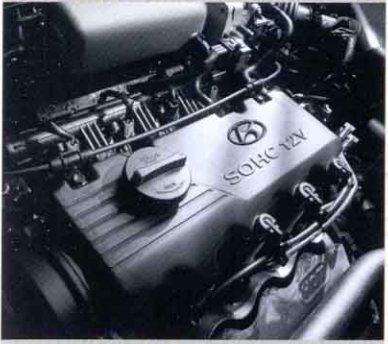
The Accent's self-tuning 1.5-liter engine virtually eliminates major scheduled service.