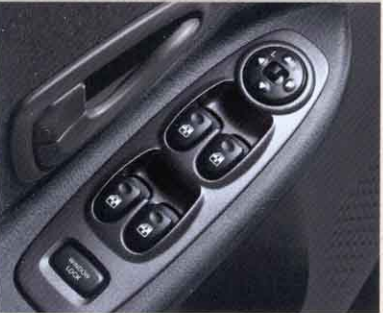
The Accent GS and GL offer the convenience of available power windows, door locks and mirrors.