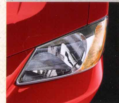
Aerodynamic, clear lens headlights illuminate the road with bright, evenly distributed halogen beams.