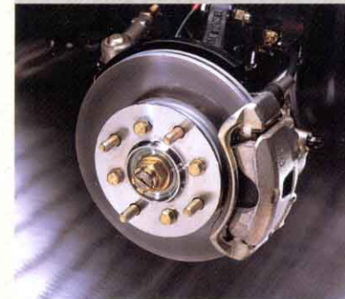
Standard power-assisted, ventilated front disc brakes have wear warning sensors that alert you when it's time for replacement.