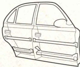
Steel side-impact door beams and built-in front and rear crumple zones are among Accent's standard protective features.

An affordable car that doesn't protect its passengers is no bargain. That's one reason why every 2002 Accent comes equipped with a host of standard protective features. Protecting the driver and front passenger are dual front airbags 1 and 3-point front seatbelts with adjustable shoulder height anchors. The front seatbelts also contain force limiters, and pretensioners that cinch the belt in the event of a moderate to severe frontal impact. Also standard are rear child-seat tether anchors and, on the 4-door Accent GL, childproof rear door locks. Finally, all Accents share structural safeguards like built-in front and rear crumple zones, 5-mph front