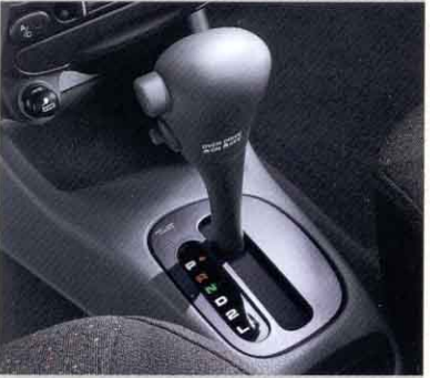
A 4-speed, electronically controlled automatic transmission, available on the Accent GS and GL, offers power and economy shift mode.