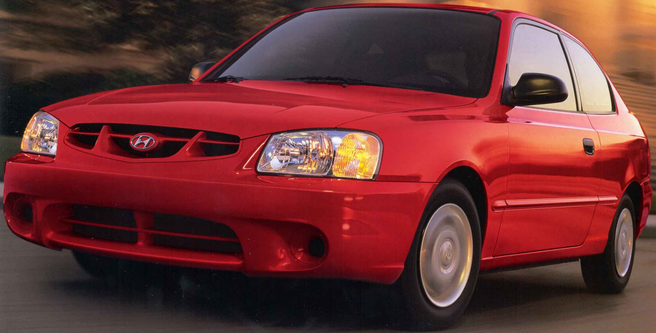
Accent GS in Retro Red