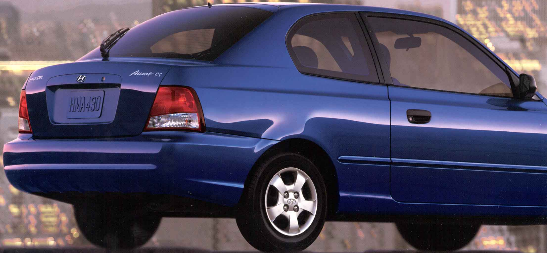
Accent GS in Coastal Blue