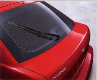
An electric rear window defroster with timer is standard on all Accents. The Accent GS also comes with a rear window wiper/washer.