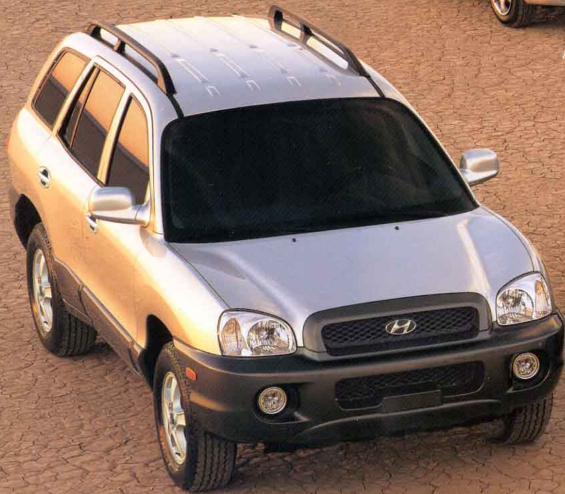
Santa Fe LX