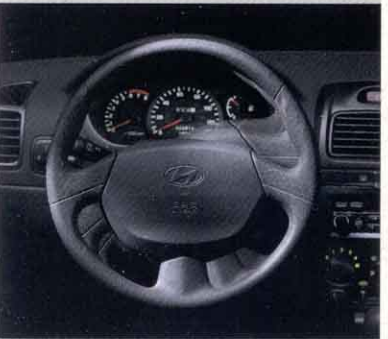
Whether you're on an open highway or a winding road, power-assisted rack-and-pinion steering offers excellent response and road feel.