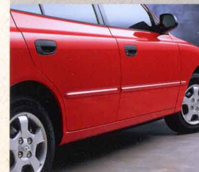
The Accent GS and GL come equipped with bodycolor protective bodyside moldings, bodycolor front and rear bumpers and deluxe full wheelcovers.