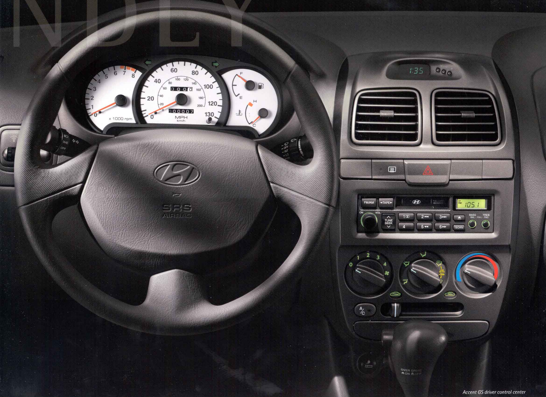
Accent GS driver control center