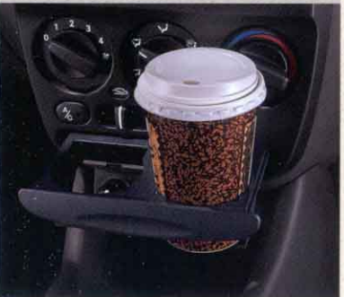
Dual front and single rear beverage holders, plus a full center console with storage compartment, are standard on Accent GS and GL.

When it comes to being well equipped, the 2002 Accent is anything but basic transportation. After all, there's nothing basic about an AM/FM stereo cassette with 4 speakers, dual remote mirrors, an electric rear window defroster with timer, variable intermittent windshield wipers and a removable cargo area cover. In fact, only two cars in Accent's class can top its standard features: the Accent GS and GL. Both come with amenities like air conditioning, a 60/40 split fold-down rear seatback, tachometer, quartz digital clock, a multi-adjustable driver's seat with lumbar support and fold-down armrest, full cut-pile carpeting and tinted glass. The 3-door GS also comes with a rear window wiper/washer, while the 4-door GL includes childproof rear door locks and a remote trunk release. And if that's not enough, both models offer desirable options like power windows, door locks and mirrors, an AM/FM stereo and CD player and a 4-speed, electronically controlled automatic transmission. In other words, the only thing plain about Accent GS and GL is their value.