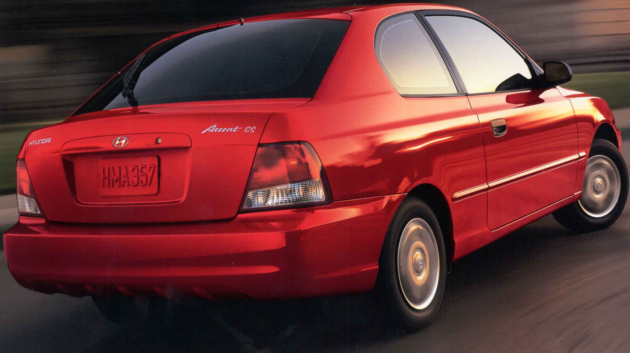
Accent GS in Retro Red