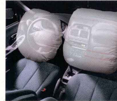
Dual front airbags are standard on every Accent. To assure readiness, the airbag system checks itself at every start up.