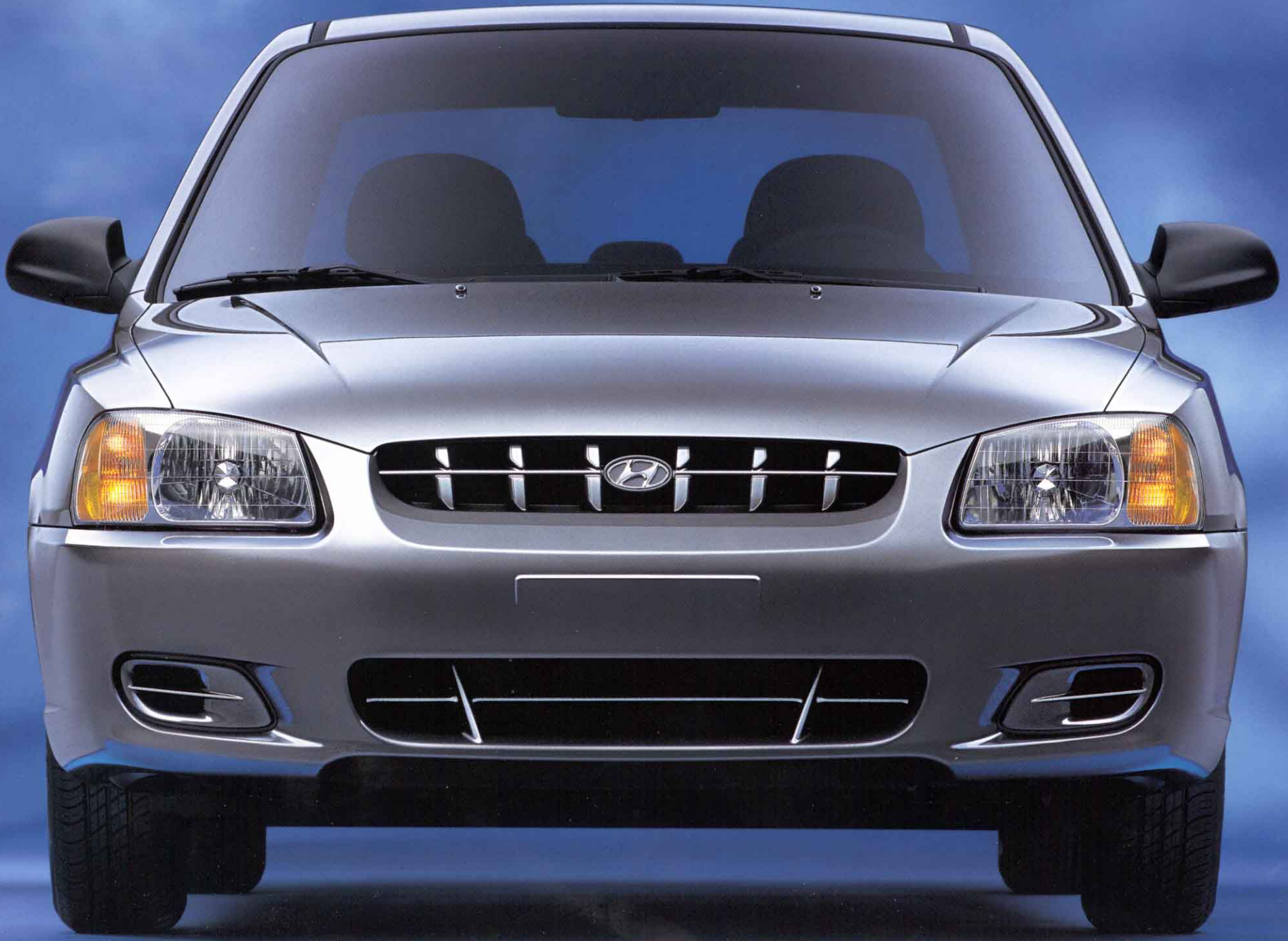
Accent GL in Charcoal Gray