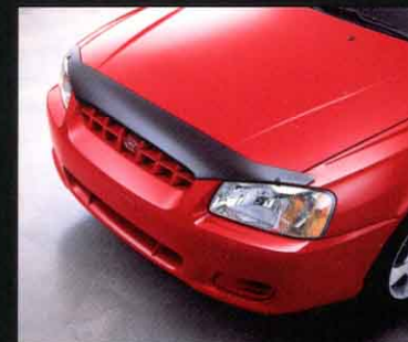
A custom-fitting hood deflector helps protect against chipping.