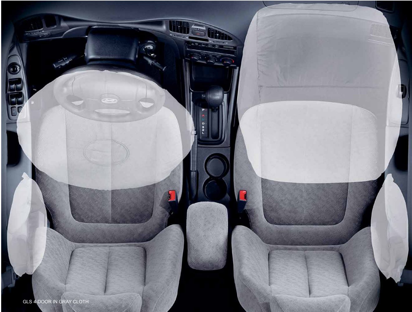
GLS 4-DOOR IN GRAY CLOTH

■ PROTECT YOUR VALUABLES. Your safety, as well as your passengers', is of the utmost importance to us. That's why dual front and front seat-mounted side-impact airbags 1 are standard, as well as front seatbelts with pretensioners and force limiters, 3-point seatbelts for all seating positions, rear LATCH child-seat attachment system, childproof rear door locks and more. All housed safely within its steel-reinforced unibody structure.