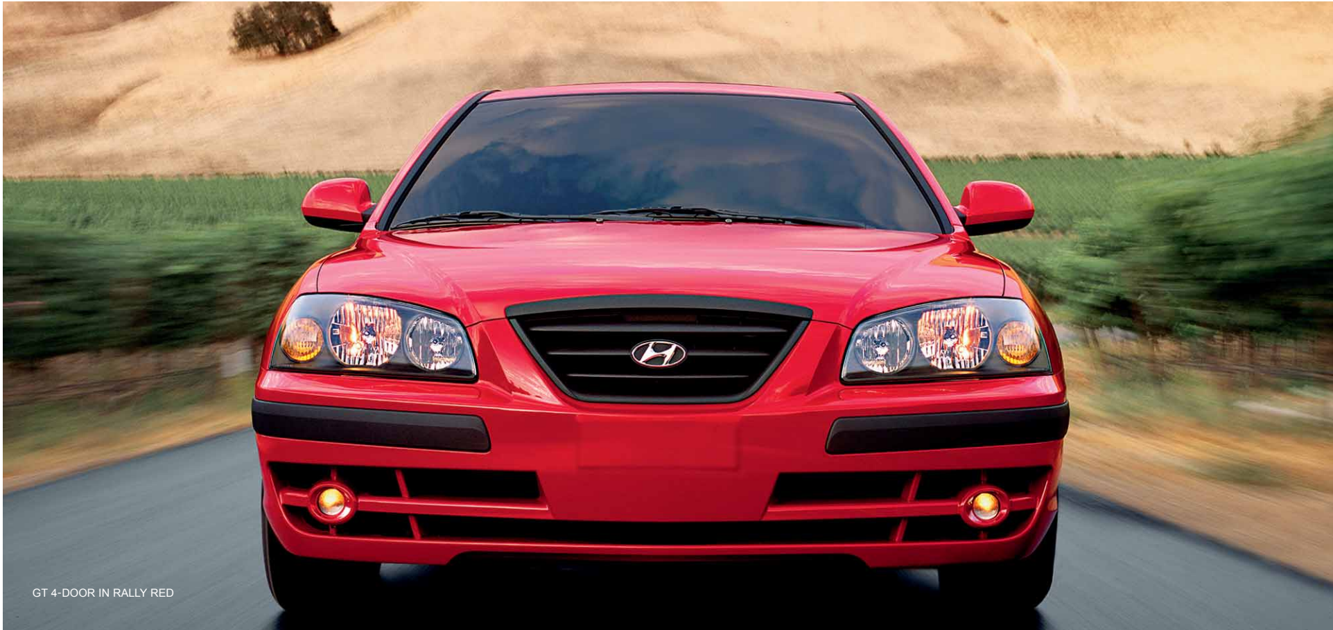
GT 4-DOOR IN RALLY RED