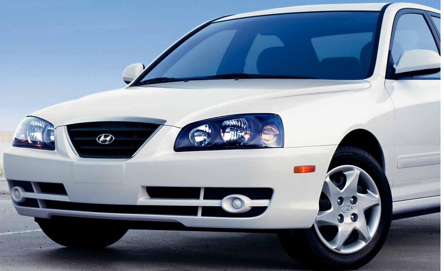
GLS 4-DOOR IN NORDIC WHITE

■ LOOK SHARP. You can count on it in the Elantra. But as we all know, looks alone will only get you so far. So whether you choose the 4-door or 5-door GLS, with crisp, clean lines, or their sporty, European-style GT counterparts, we've made sure you also get a superior level of features compared to the competition. A very satisfying way to get everything you need. And an even better way to keep heads turning in your direction.