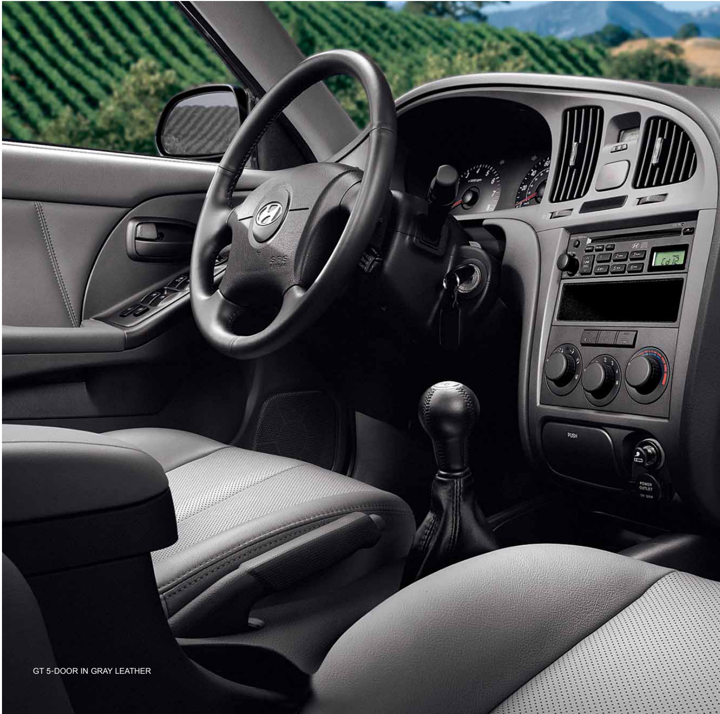
GT 5-DOOR IN GRAY LEATHER