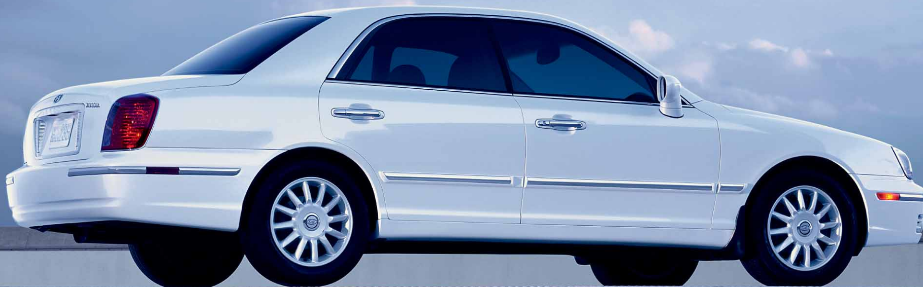
XG350L IN POWDER WHITE PEARL