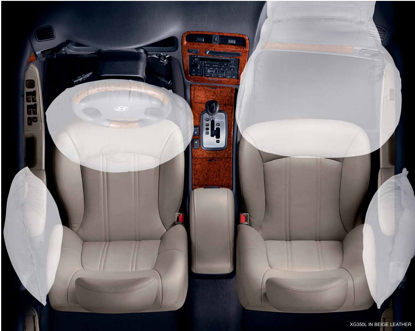
XG350L IN BEIGE LEATHER

■ CHECK YOUR WORRIES AT THE DOOR. The XG350 has earned the government's highest safety rating, NHTSA's 5-stars* for the driver and front passenger in a frontal collision. You have the protection of four airbags, 1 3-point front and rear seatbelts, rear LATCH child-seat attachment system, and a range of other high-tech standard safety features, all secured by the steel-reinforced unibody structure.