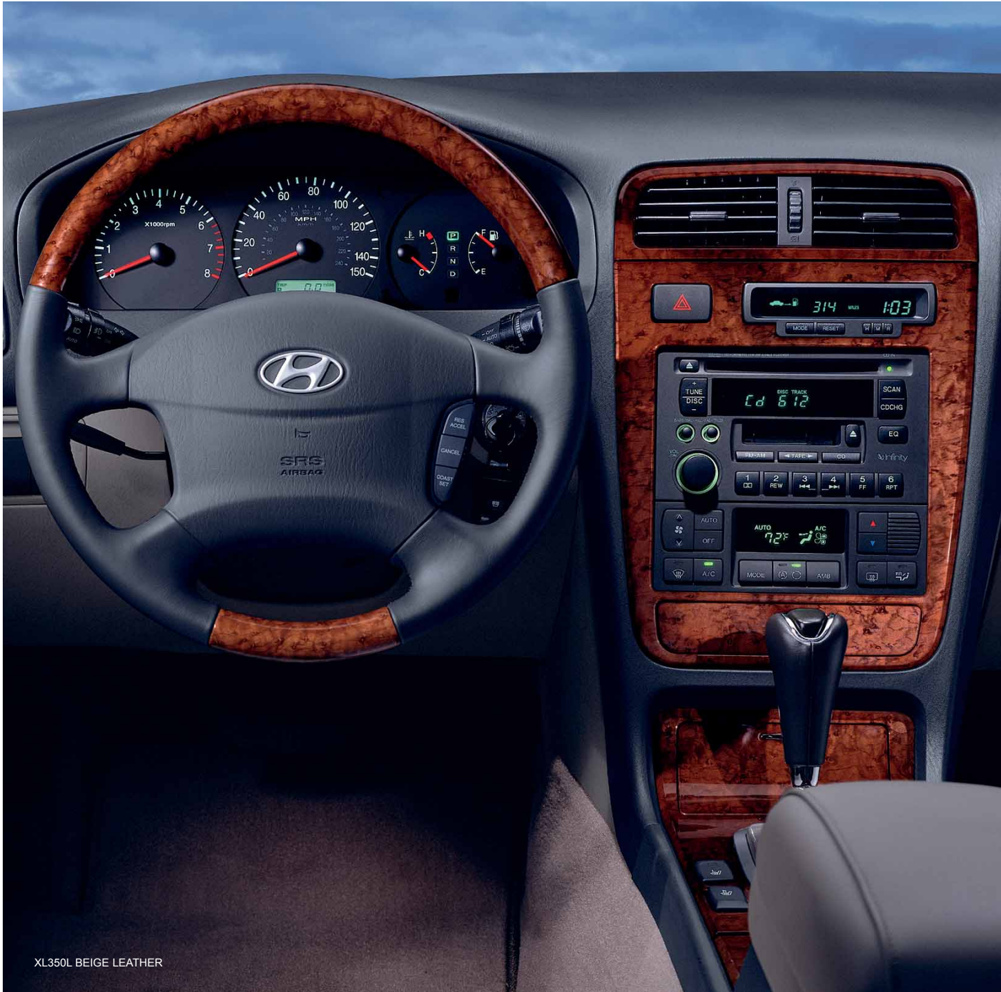
XL350L BEIGE LEATHER