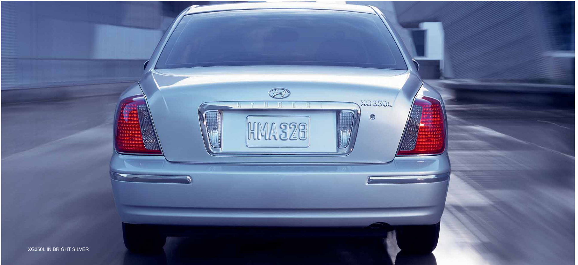
XG350L IN BRIGHT SILVER