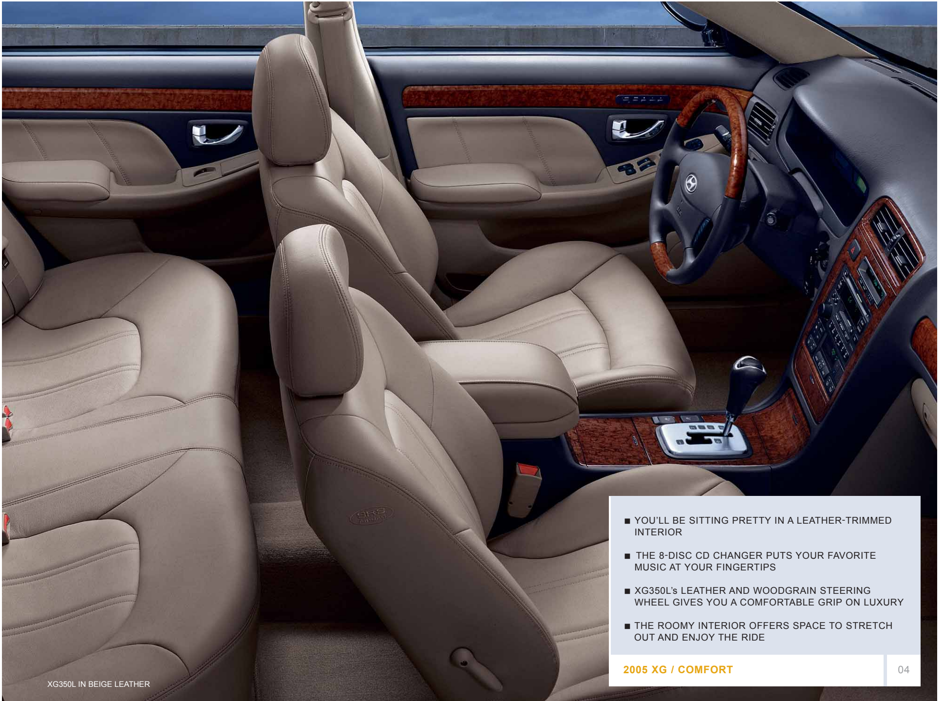
XG350L IN BEIGE LEATHER