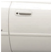
Diamond White Pearl 5 with Charcoal or Ivory interior