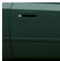
Rainforest Pearl 6 with Charcoal or Ivory interior