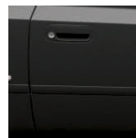
Black Sand Pearl with Charcoal or Ivory interior