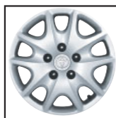
Standard 5-spoke styled steel wheel