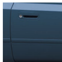
Indigo Ink Pearl 6 with Charcoal or Ivory interior