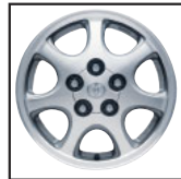
SE available 15" aluminum alloy wheel 1