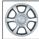
SE V6 available 16" aluminum alloy wheel