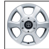
SE V6 available 16" aluminum alloy wheel 2