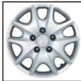
SE standard 15" steel wheel with full wheel cover