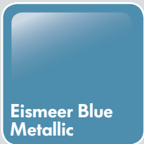
Eismeer Blue Metallic