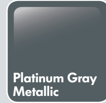
Platinum Gray Metallic