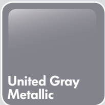
United Gray Metallic