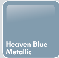
Heaven Blue Metallic

New Beetle New Beetle Convertible Rabbit