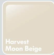
Harvest Moon Beige