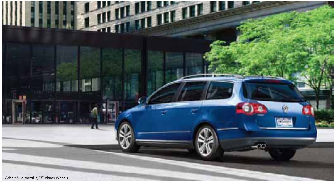
Cobalt Blue Metallic, 17" Akiros Wheels

*2007 and 2008 Kiplinger's Finance "Best in Class" Passat Wagon 2.0T. **Passat offers a brake disc wipe feature, an electronic parking brake with auto hold, and a push start key fob system. ***EPA estimates only. Your mileage may vary. †Government star ratings are part of the National Highway Traffic Safety Administration's (NHTSA's) New Car Assessment program ( www.safercar.gov ).