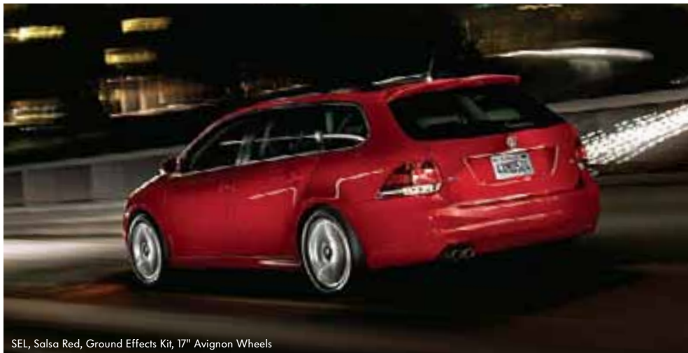
SEL, Salsa Red, Ground Effects Kit, 17" Avignon Wheels

*EPA estimates only. Your mileage may vary. **38 city/44 highway (automatic) real world fuel economy based on AMCI testing. ***Airbags are supplemental restraints only and will not deploy under all crash circumstances. Always use safety belts and seat children only in the rear, using restraint systems, appropriate for their size and age. †Government star ratings are part of the National Highway Traffic Safety Administration's (NHTSA's) New Car Assessment program ( www.safercar.gov ).