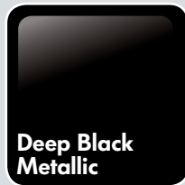
Deep Black Metallic