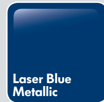
Laser Blue Metallic