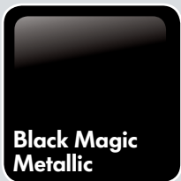
Black Magic Metallic