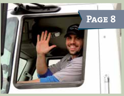
FIND US ONLINE BLOOMINGTON MN.gov