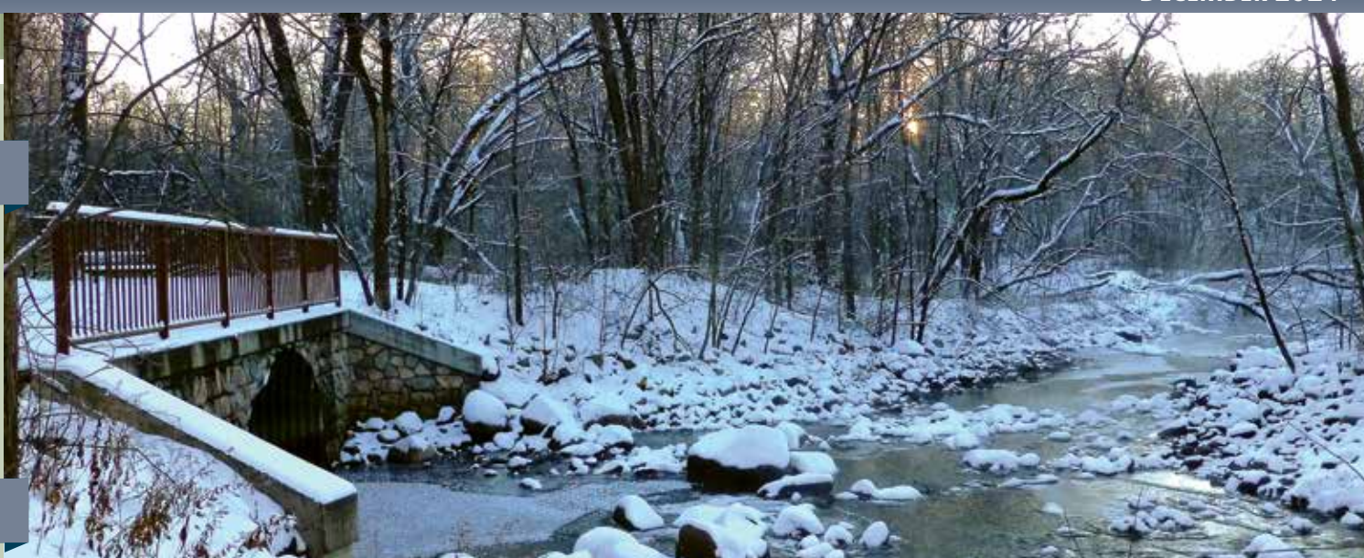
Nine Mile Creek is a great place for a hike any time of year, but it is especially serene in the winter. The creek's source is two lakes -Bryant Lake in Eden Prairie and Mud Lake in Edina. Visit the City's website to share your winter beauty shots.