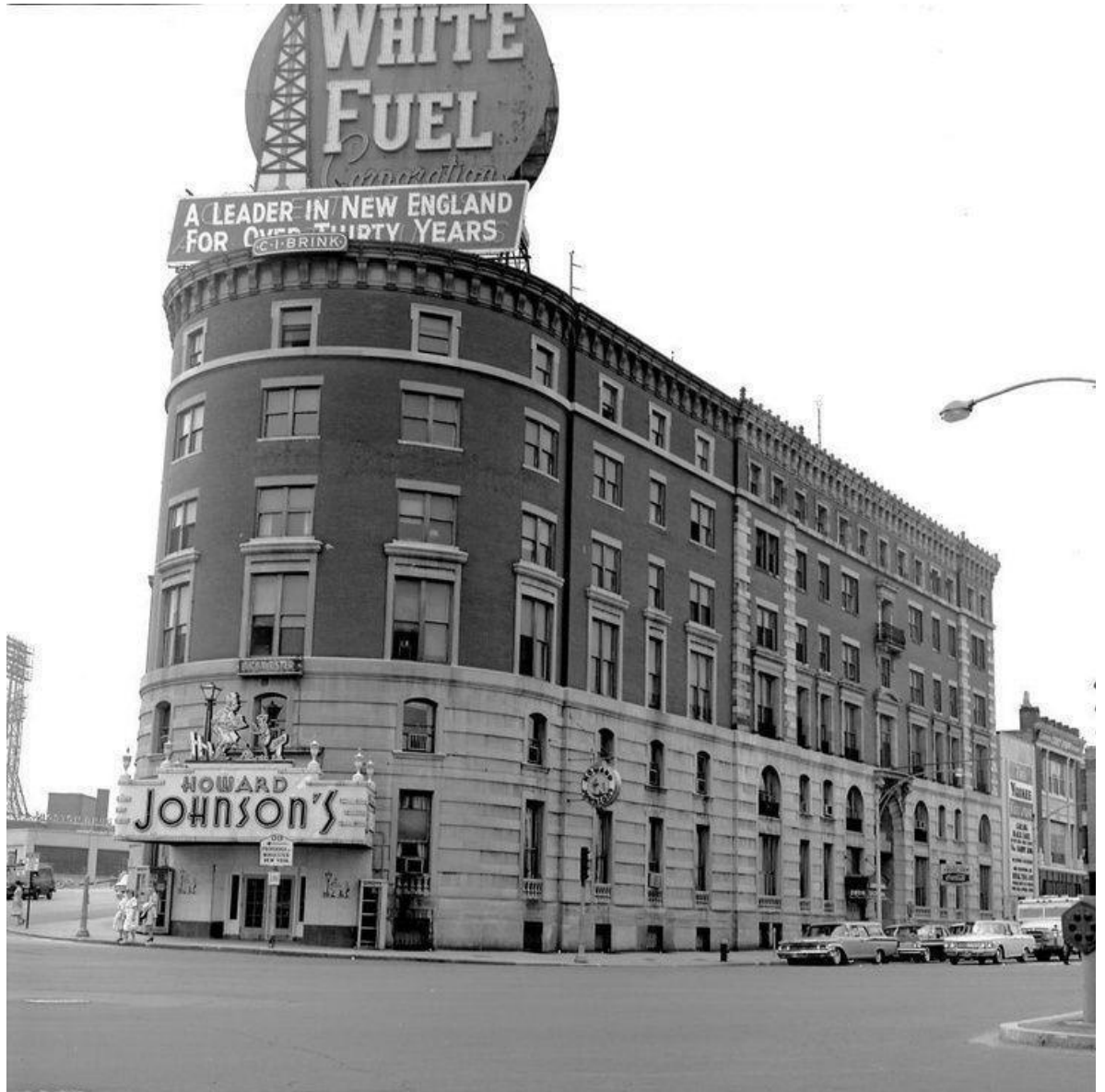
Figure 19. Undated (early 1960s) view south from Commonwealth Avenue, showing neon signs of Howard Johnson's restaurant and White Fuel Corporation on Kenmore Square elevation.