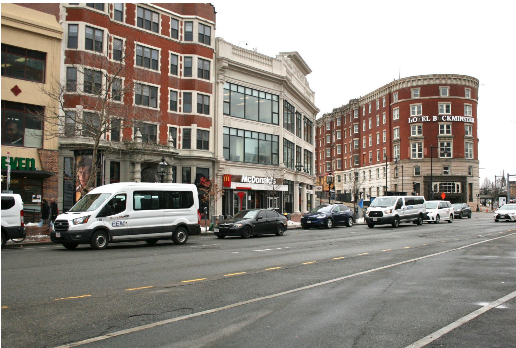
Figure 7. View southwest from Commonwealth Avenue. March 2023.