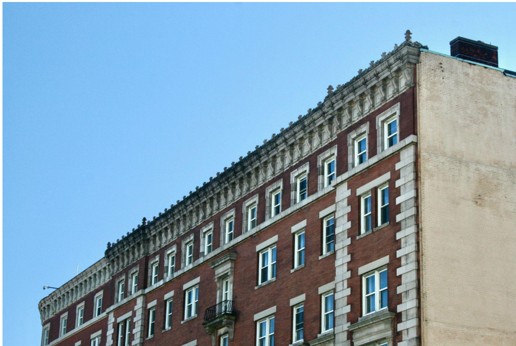
Figure 5. Beacon Street elevation, entablature detail. October 2022.