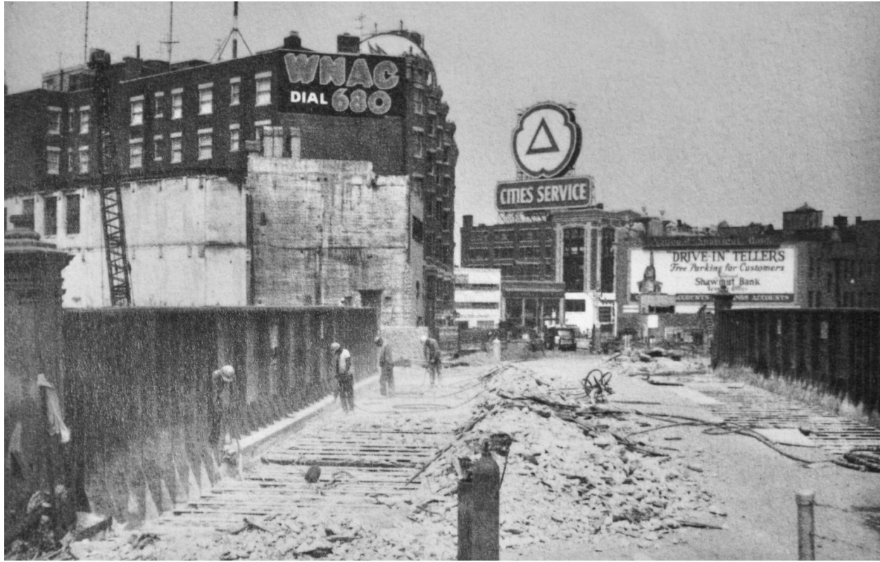
Figure 20. View northeast on Brookline Avenue toward Kenmore Square during demolition of the old Brookline Avenue bridge over the New York Central (Boston & Albany) Railroad (summer 1963). Hotel Buckminster is on the left, bearing a wall sign for radio station WNAC. Construction of a new bridge to span the Massachusetts Turnpike Extension raised the street grade on Brookline Avenue.