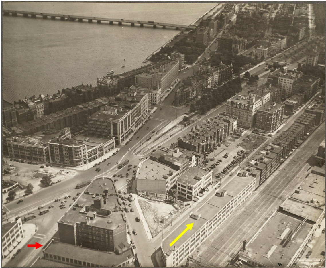
Figure 16. Aerial view (1929) northeast through the Kenmore Square area, showing the Hotel Buckminster in the left foreground. The building abutting the southwest elevation of the Buckminster (red arrow), demolished in 2003, is shown at its original one-story height. All buildings lining the south side of Newbury Street (yellow arrow) would be demolished ca. 1963 for construction of the Massachusetts Turnpike Extension.