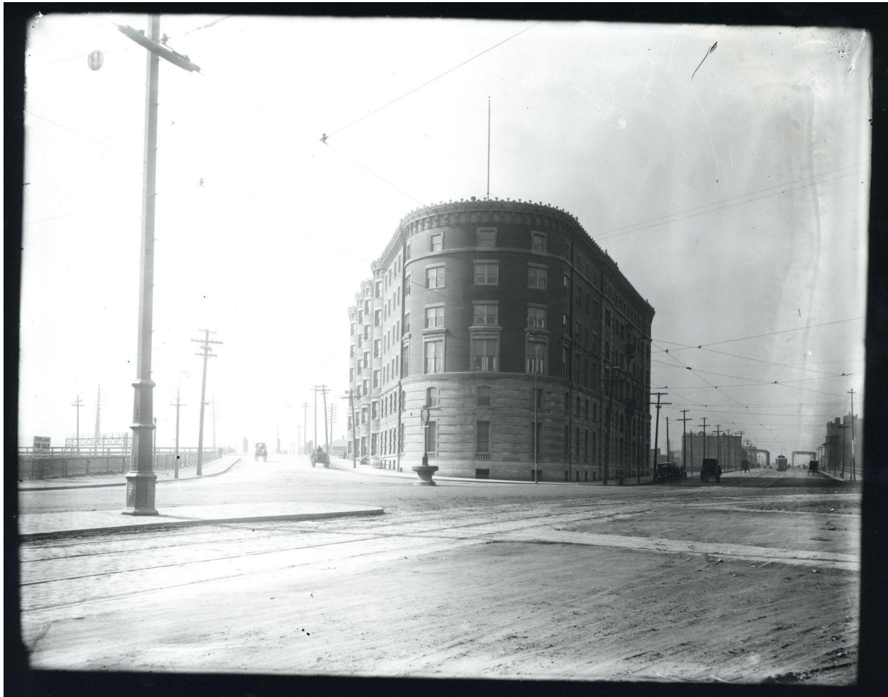
Figure 14. View southwest from Beacon Street (ca. 1912), with Brookline Avenue (left) and Beacon Street (right) elevations. Photograph predates the naming of this intersection with Commonwealth Avenue as Governor Square, later known as Kenmore Square.