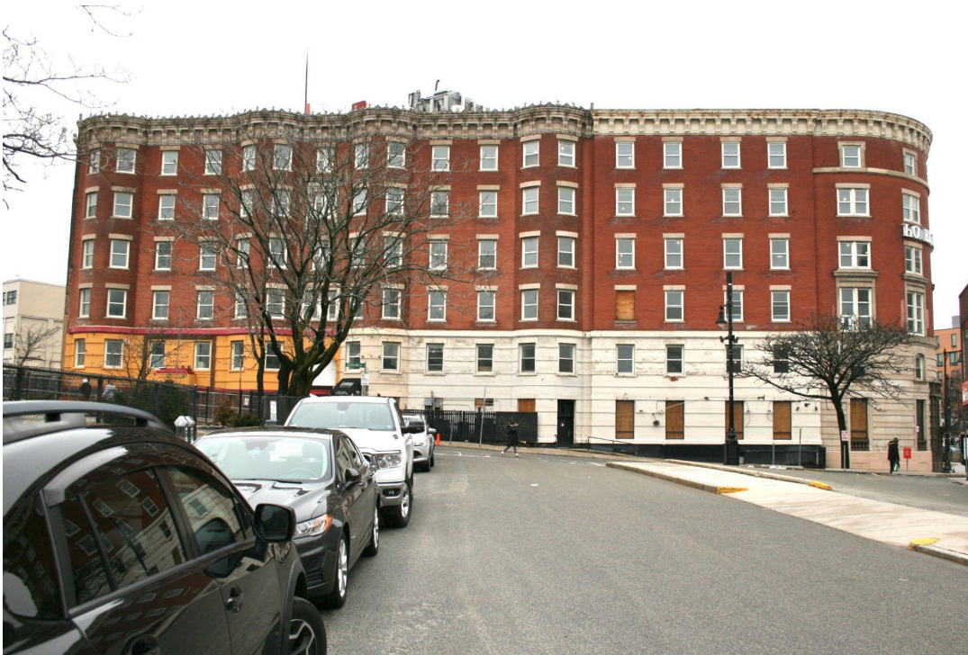
Figure 9. Brookline Avenue elevation, view northwest from Newbury Street. March 2023.