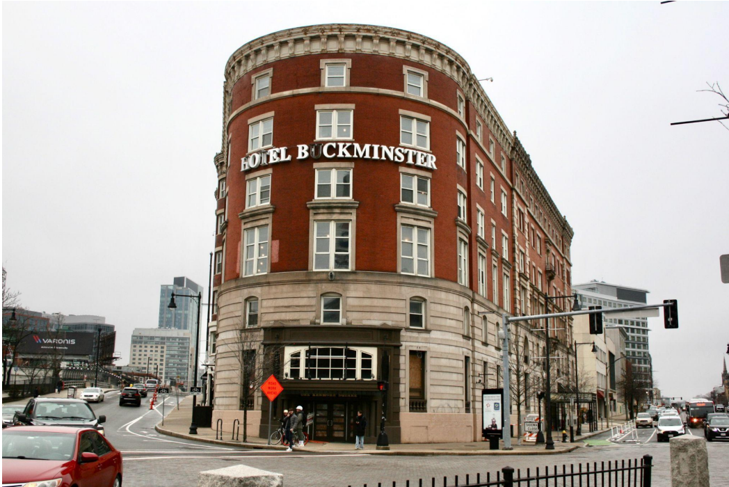
Figure 6. View southwest from Kenmore Square (Beacon Street on right). March 2023.