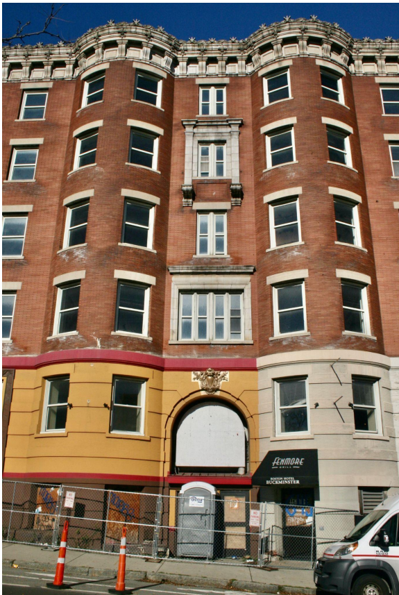
Figure 11. Brookline Avenue elevation, detail of main entrance bay. October 2022.