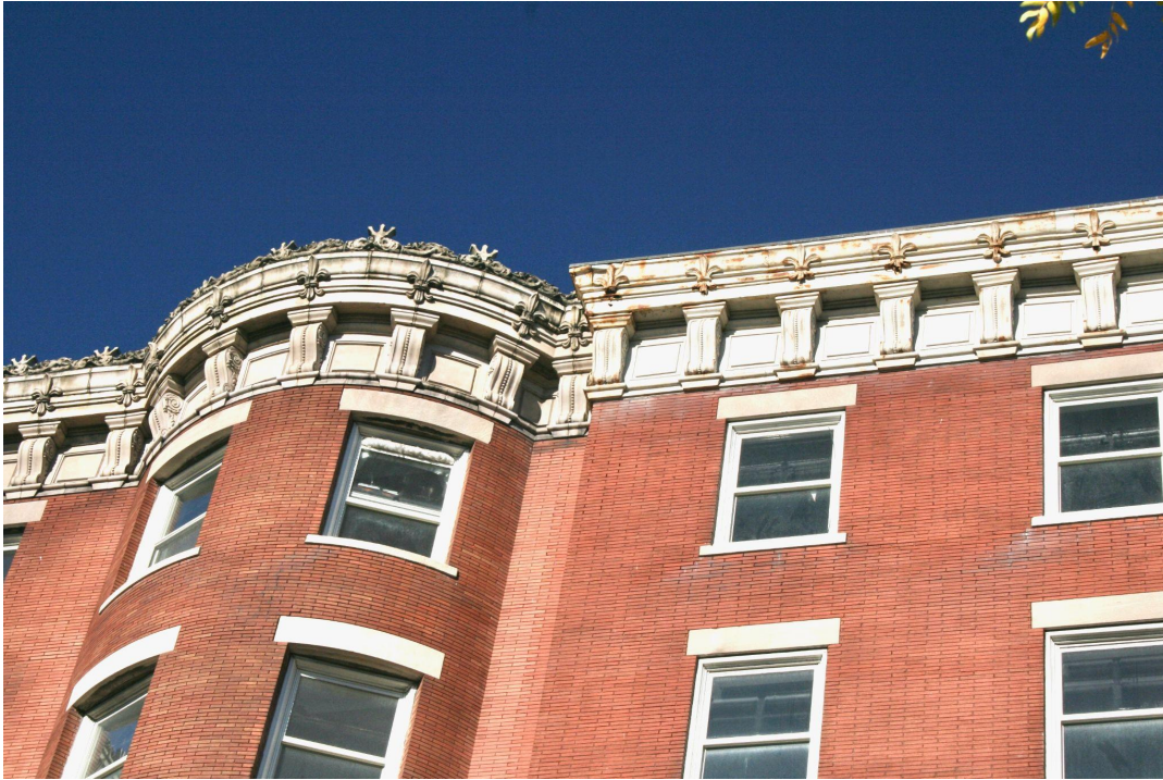
Figure 8. Entablature detail, Brookline Avenue elevation: 1897 (left) and 1902 (right). October 2022.