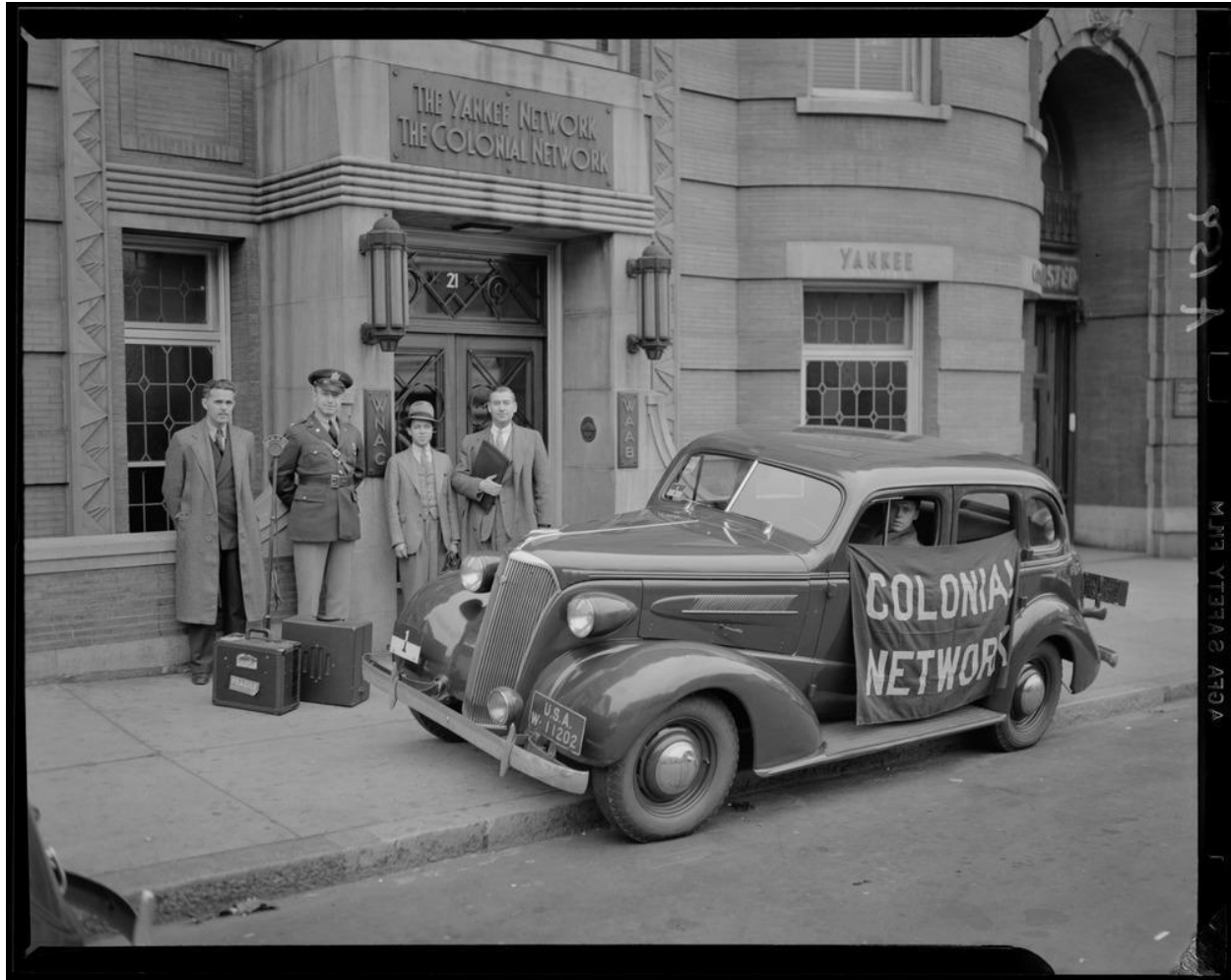
Figure 18. Brookline Avenue entrances for the Yankee and Colonial Networks (left) and the Hotel Buckminster (right). Photograph appears to date to the hotel's occupation by the U. S. Army Service Forces First Service Command (1942-1946). Comparison with Figure 12 illustrates the change in the street grade of Brookline Avenue, due to construction in 1963 of a new Brookline Avenue bridge over the Massachusetts Turnpike Extension.