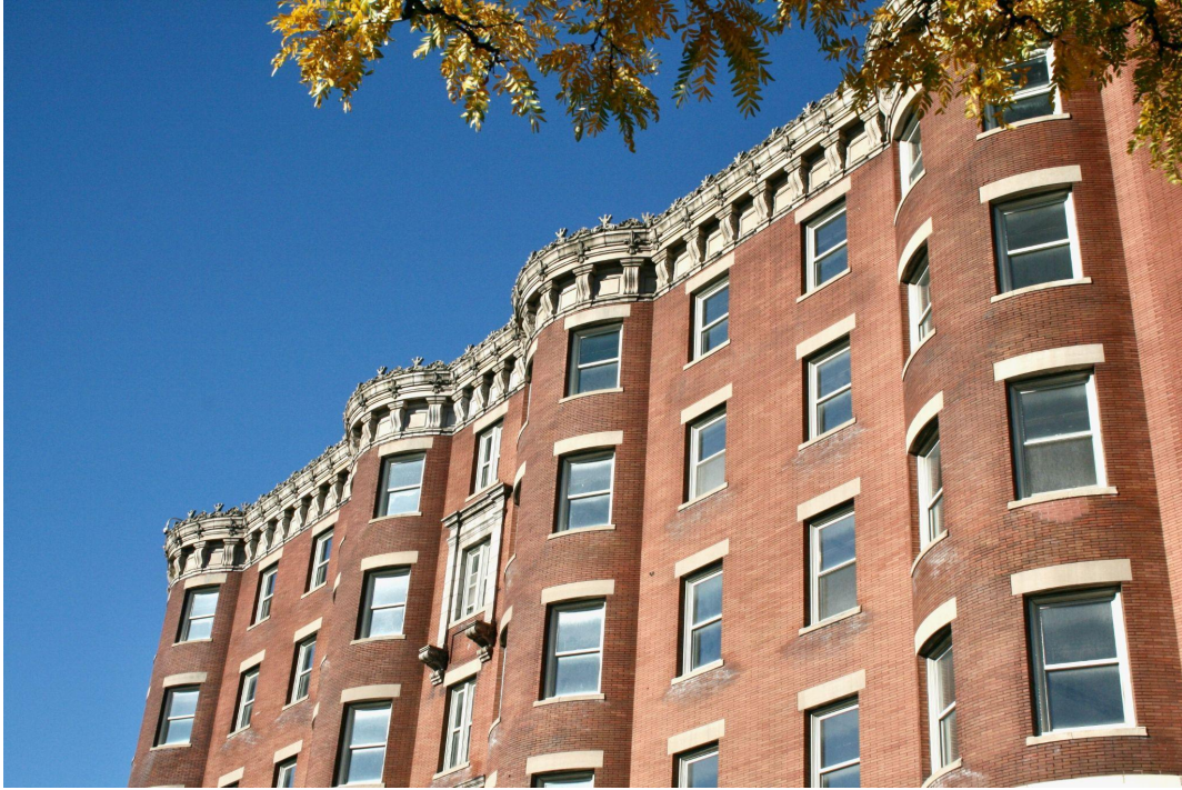
Figure 10. Brookline Avenue elevation, detail of bow windows. October 2022.