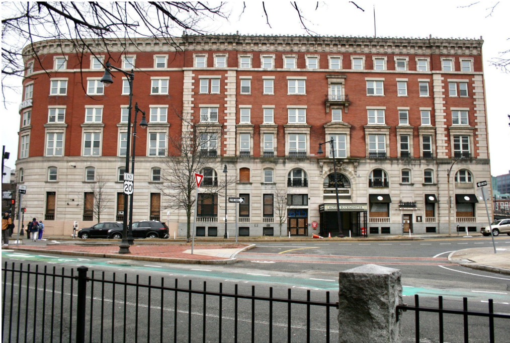
Figure 2. Beacon Street elevation, view southeast from Commonwealth Avenue. March 2023.