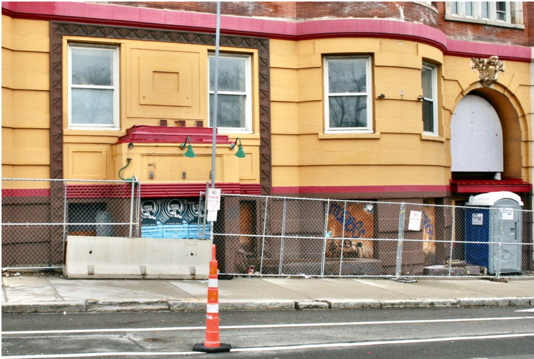
Figure 12. Brookline Avenue elevation, broadcasting (left) and hotel entrances. March 2023.