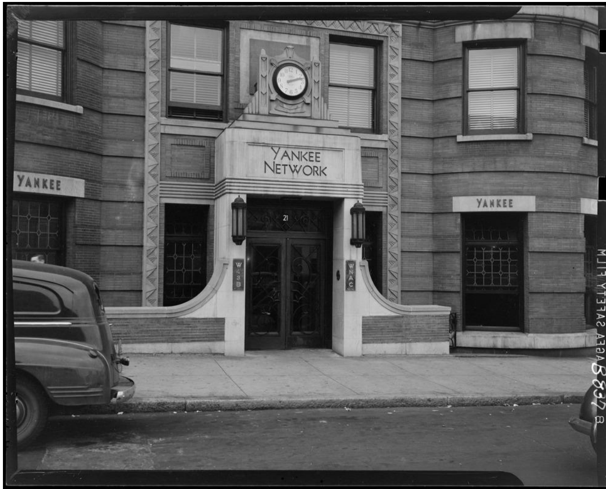
Figure 17. Yankee Network entrance, 21 Brookline Avenue (1942).