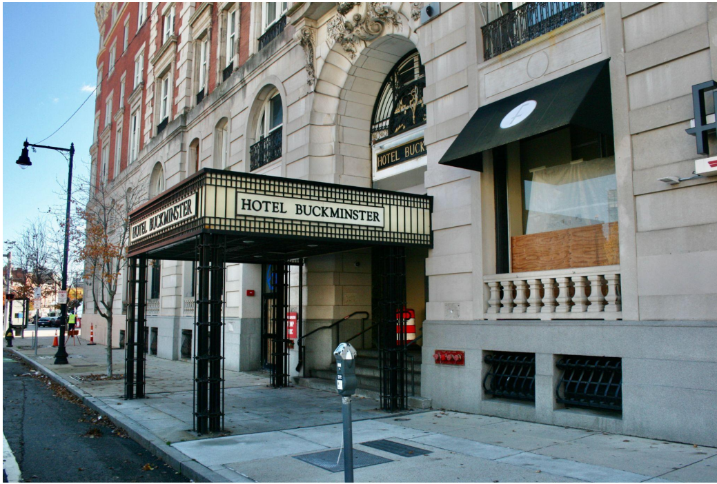
Figure 4. Beacon Street elevation, main entrance. March 2023.