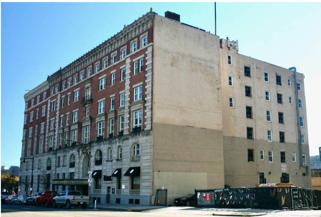
Figure 13. Beacon Street (left) and southwest elevations, view east. October 2022.