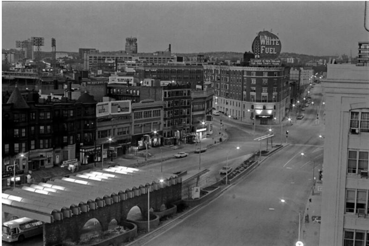
Figure 21. View southwest at dusk toward Hotel Buckminster, then operated as Leavitt Hall of Grahm Junior College, with White Fuel sign on roof (1970).