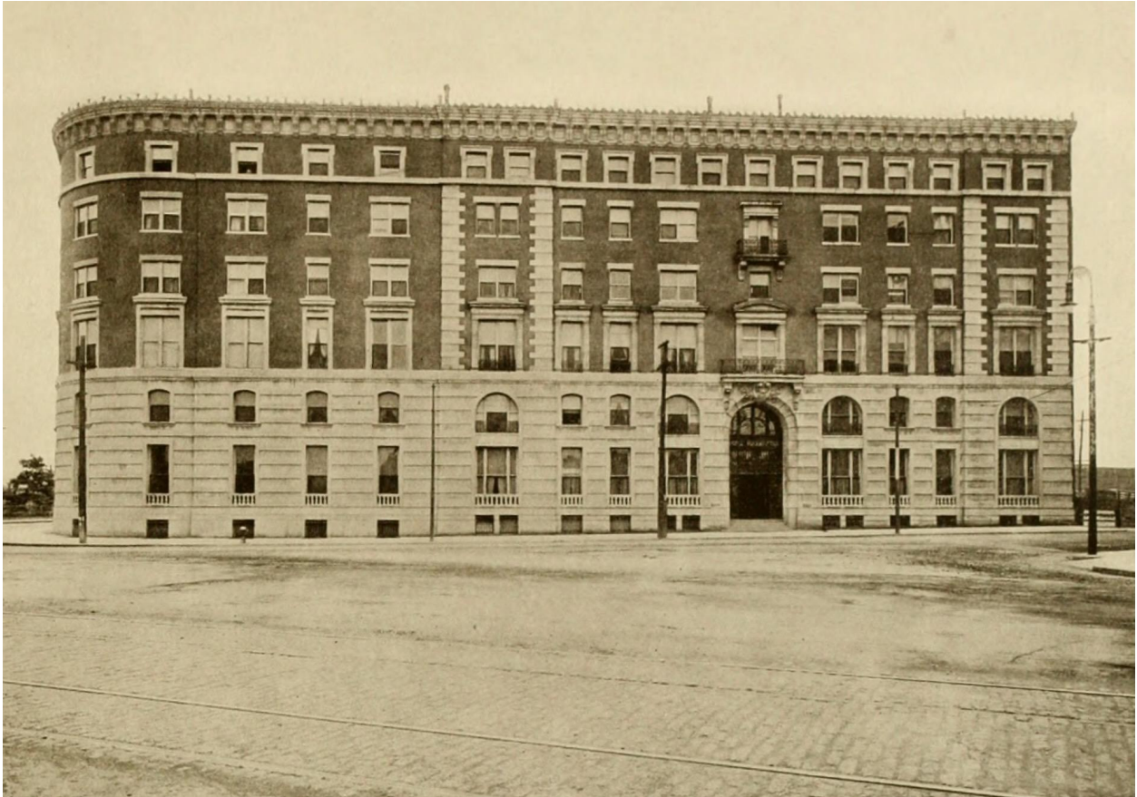
Figure 15. Beacon Street elevation (1914). View southeast from Commonwealth Avenue.