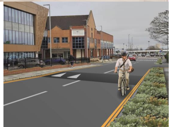
Indicative visualisation of improved public realm on Wellington Road North

We also hope our new LUF Project display area will be open also in the main market hall to find out more across all the project workstreams. Find it towards the back of the market near the barbers.