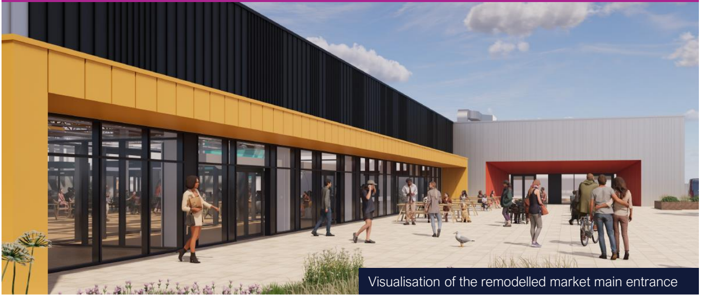
Visualisation of the remodelled market main entrance