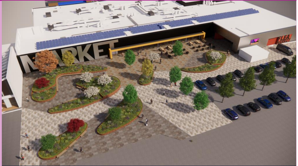
Indicative visualisations of the proposed landscaping around the Market

Please note images are currently indicative and will undergo further development.