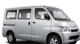
Gran Max Van