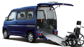
Atrai Wagon Sloper

Daihatsu provides safe and easy-to-operate vehicles to enable as many people as possible to enjoy the freedom of moving from place to place, convenience, fun and pleasure that automobiles can deliver.