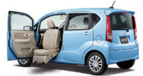
Move Front Seat Lift