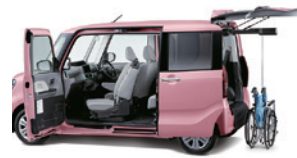
Tanto Welcome Turn Seat