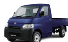
Gran Max Pickup