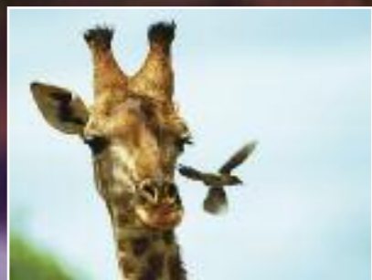
South Africa page 6

South Africa truly is "a world in one country". No country on the African continent can boast such a diversity of attractions and abundance of activities and interests. South Africa really does have something for everyone and every interest.