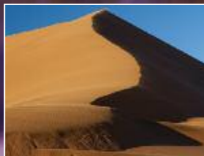
Namibia page 50

Over twice the size of Great Britain, Botswana has a population of less than 2m and almost 40% of the country is devoted to wildlife. With the world's largest inland Delta and Africa's highest population of elephant, Botswana is a true safari lover's dream destination.