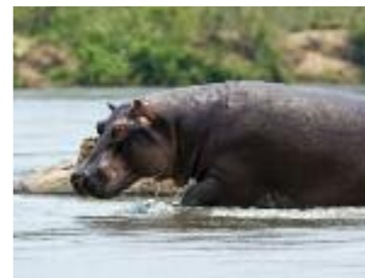
Malawi page 94

Home to one of the great natural wonders of the World – Victoria Falls – Zimbabwe also has some of Africa's finest big game reserves with few visitors and abundant wildlife. The mighty Zambezi offers superb canoe safaris and the south of the country is rich in cultural history.