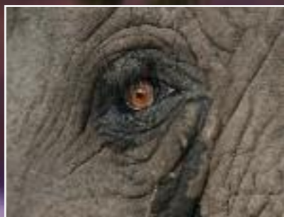
Botswana page 38

South Africa truly is "a world in one country". No country on the African continent can boast such a diversity of attractions and abundance of activities and interests. South Africa really does have something for everyone and every interest.