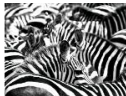
Kenya page 78

The Pearl of Africa is home to a lot more than the traditional safari as it is one of the best places for primate viewing with mountain gorillas and chimpanzees the major attraction. Uganda also offers exceptional birdwatching, Lake Victoria and the source of the Nile.