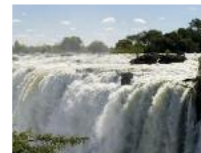
Zimbabwe page 136

Mozambique has become an increasingly popular destination, especially for honeymooners and those who desire barefoot luxury without the crowds. Visitors are lured by the pristine white beaches and clear waters, ideal for diving and snorkelling, untouched wilderness areas and excellent bird watching.