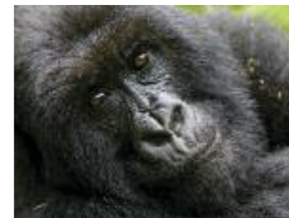
Rwanda page 118

Dubbed the 'Warm Heart of Africa' due to the friendliness of the people, Lake Malawi is an inland sea of warm water and pristine sandy beaches. Malawi is also of particular interest to nature lovers and especially keen birdwatchers.