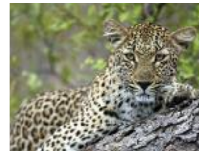
Zambia page 100

Famous for the great migration, Tanzania has so many more wildlife reserves than the justifiably famous "northern circuit". The south is home to little visited reserves, as well as chimpanzees. The coast is home to the spice Island of Zanzibar and other idyllic barefoot paradise islands.