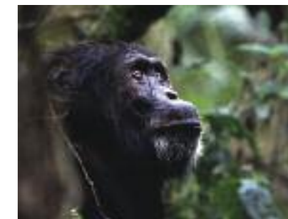
Uganda page 126

Another gem for the safari lover and the home of the walking safari, Zambia has some of the finest protected areas in Africa making it another favourite for safari lovers. In addition, the spectacular Victoria Falls are also accessible from Livingstone.