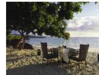
Indian Ocean page 144

Rwanda is a green undulating landscape of hills, gardens and tea plantations. It is home to a third of the world's remaining Mountain Gorillas, as well as a third of Africa's bird species, several species of primates, volcanoes, game reserves, resorts and islands on the expansive Lake Kivu.