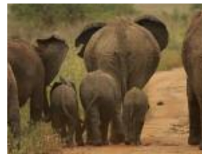
Tanzania page 60

Namibia is immense even by African standards. But it's what occupies this seemingly endless space that makes it special. Namibia is filled with rugged, beautiful landscapes of every kind, creating a unique environment in which an amazing wealth of wildlife has adapted and thrives.