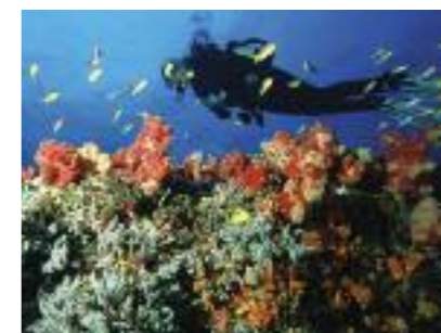
Mozambique page 112

Kenya is one of the world's great tourism destinations, known for its remarkable diversity of landscapes, wildlife and cultures. Kenya is Africa's original safari destination, attracting explorers, adventurers and travellers for centuries. It is home to Africa's famous 'Big Five' along with miles of pristine coastline.