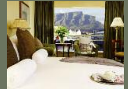
TABLE BAY HOTEL ◆ Elegant rooms and suites ◆ Sea or Table Mountain views ◆ Situated on the V&A Waterfront ◆ Multiple dining options ◆ Pool and spa available

THE BAY HOTEL ◆ 78 bright, modern rooms and suites ◆ Located in the heart of Camps Bay ◆ Four sea-facing pools ◆ Treatments available at the on-site spa ◆ 12 Apostle Mountain range back drop