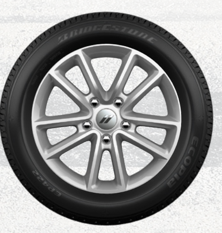
17-inch Tech Silver aluminum Standard on SXT