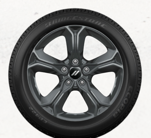
19-inch Black aluminum Standard on Crossroad FWD and AWD