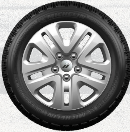
17-inch steel with wheel cover Available on CVP