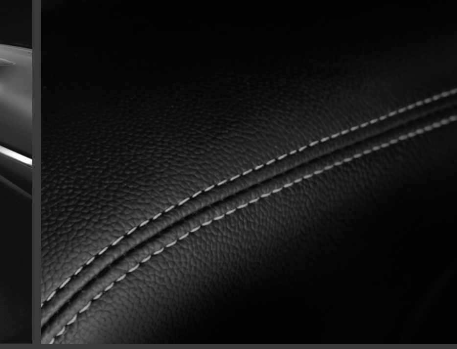
Leather-faced — Black with Light Grey accent stitching Standard on GT and Crossroad AWD

20 // EXTERIOR COLOURS INTERIOR COLOURS // 21