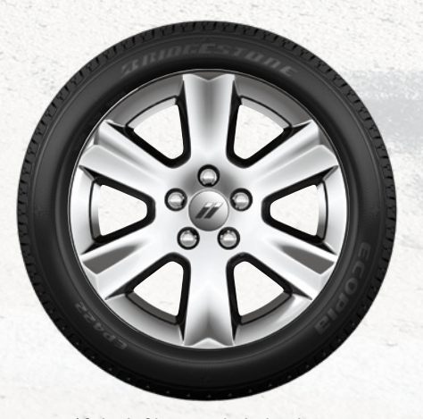
19-inch Chrome-clad aluminum Available on GT