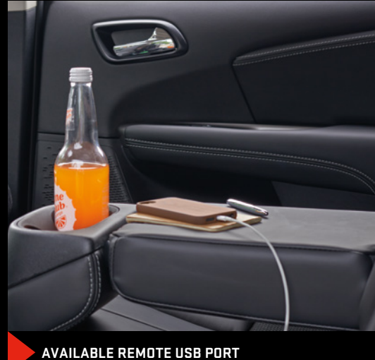
AVAILABLE REMOTE 030 FOR

A standard hidden storage bin and access door to the tool-and-jack compartment are located behind the rear seat. When hauling gear is a priority, simply fold down the second- and available third-row seats.