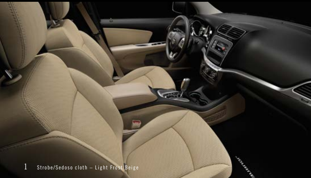
1 Strobe/Sedoso cloth – Light Frost Beige