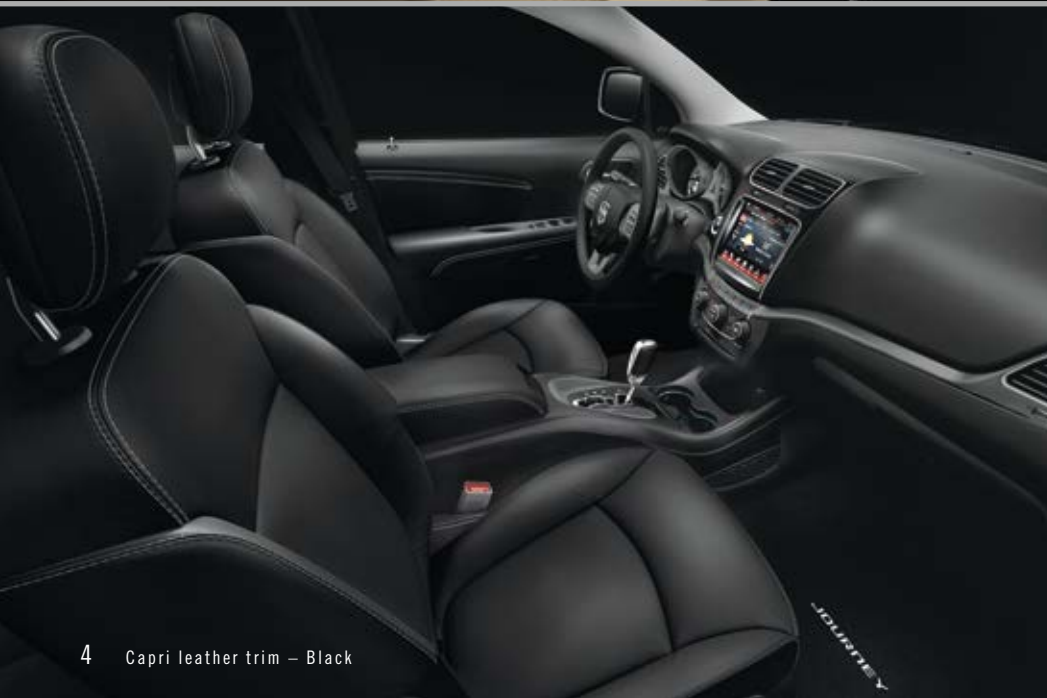
4 Capri leather trim – Black