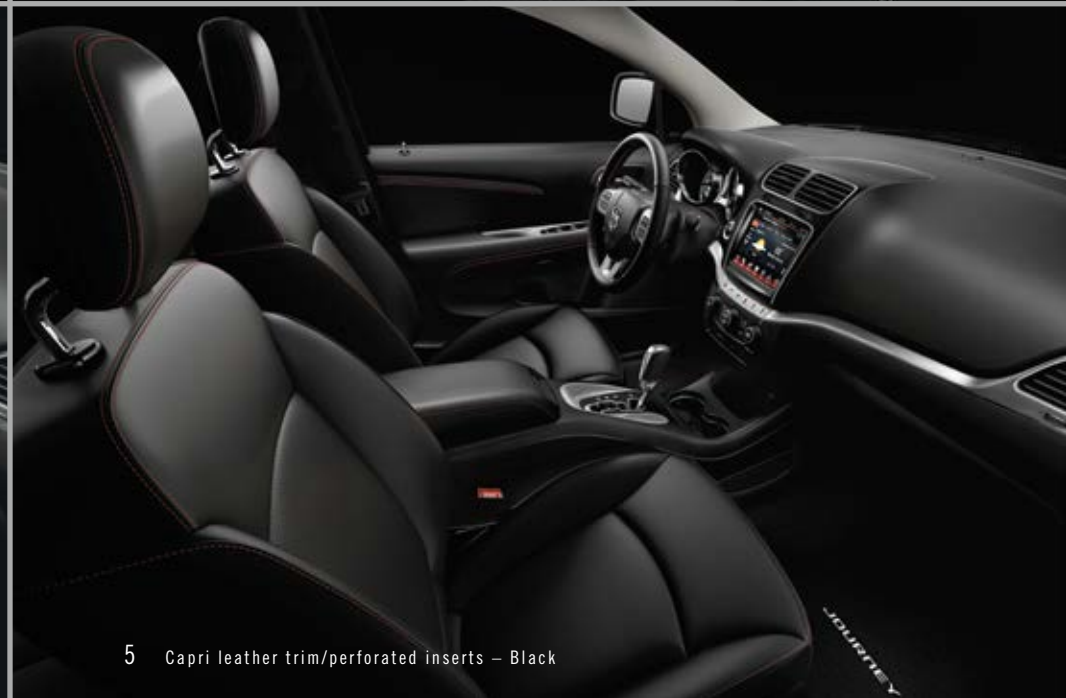
5 Capri leather trim/perforated inserts – Black

MORE INTERIOR CHOICES FEATURED ON THE NEXT PAGE.