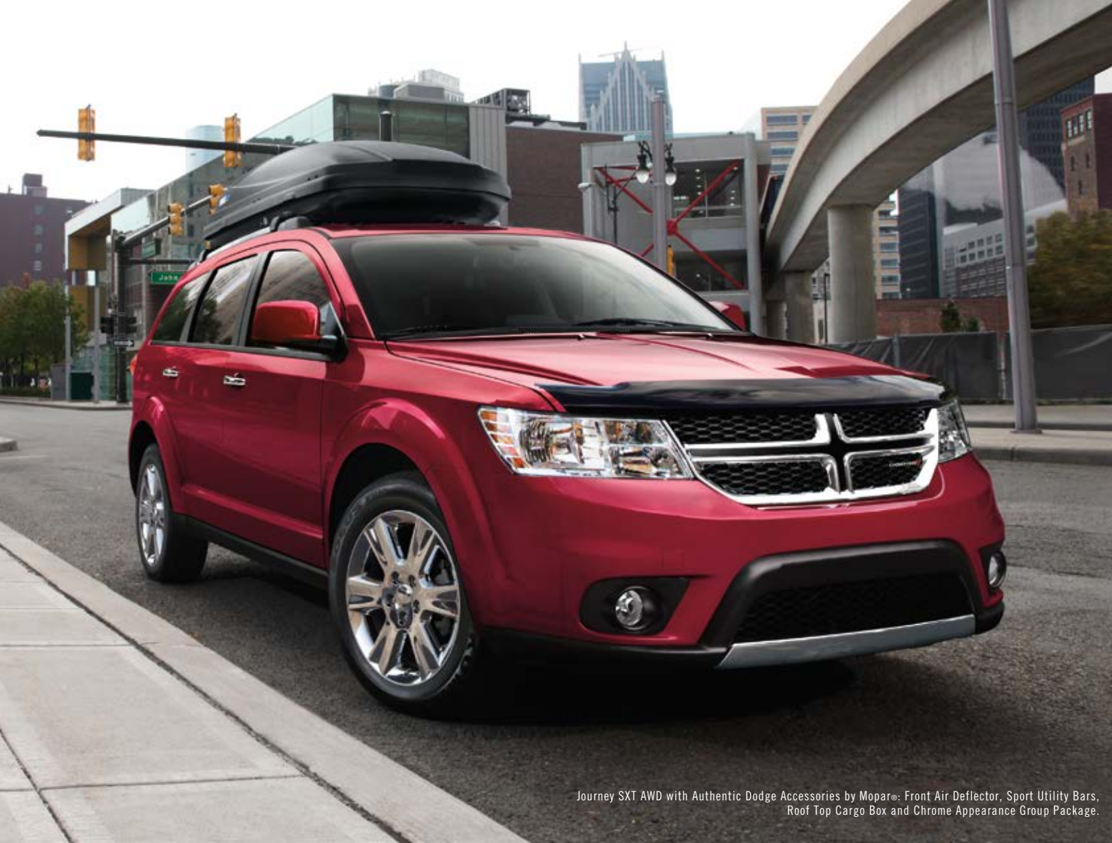
Journey SXT AWD with Authentic Dodge Accessories by Mopar: Front Air Deflector, Sport Utility Bars, Roof Top Cargo Box and Chrome Appearance Group Package.