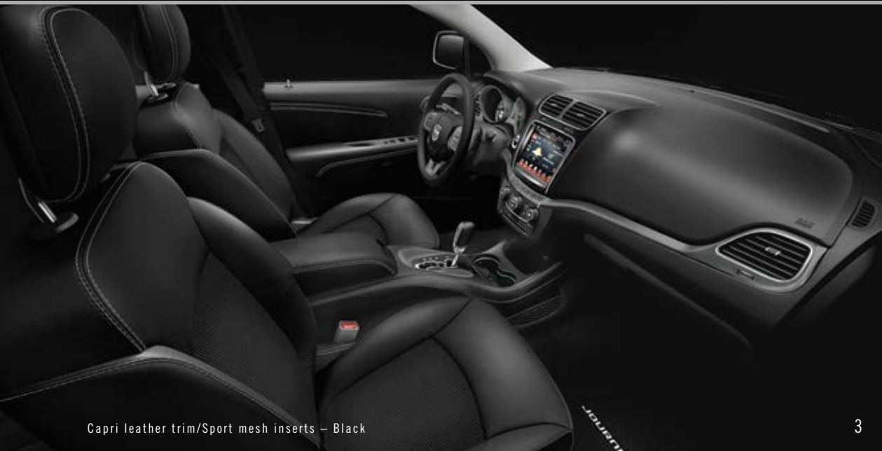
Capri leather trim/Sport mesh inserts – Black