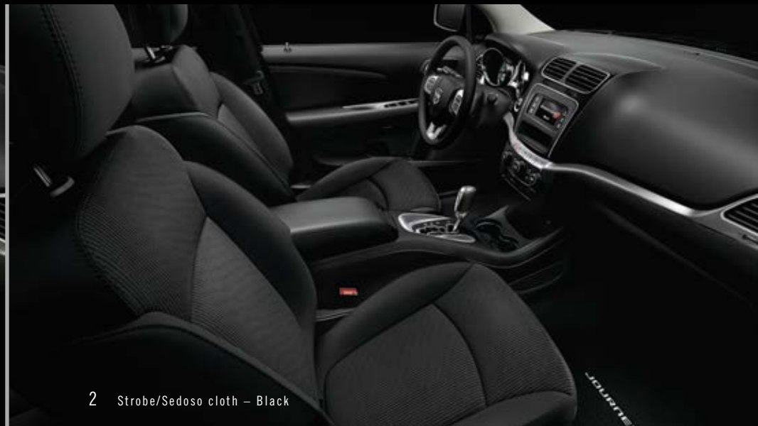
2 Strobe/Sedoso cloth – Black