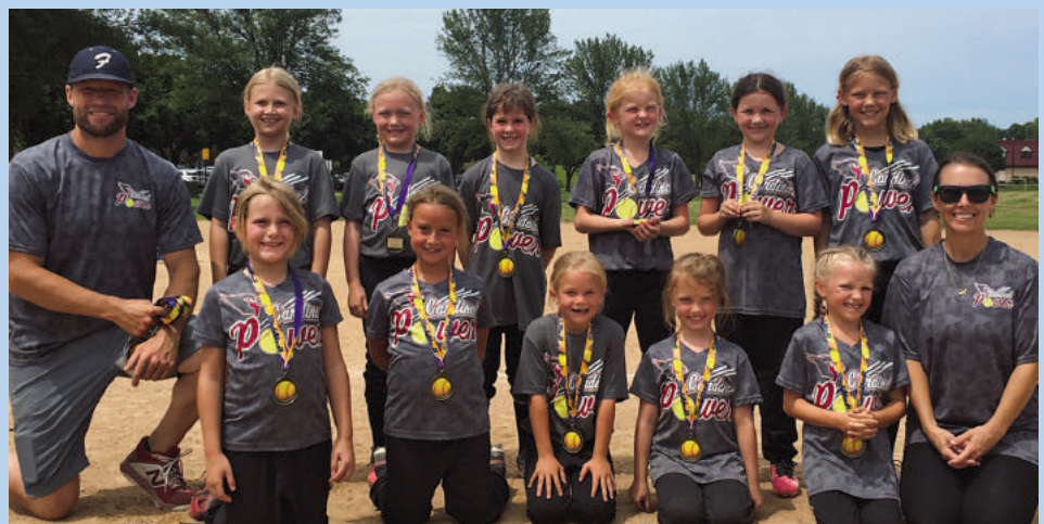
The 8U Cardinal Power softball team participated in the Southern Stars League team tournament on Saturday in New Ulm. The team played 3 games.

USA Track & Field (USATF) is the National Governing Body for track & field, long-distance running and race walking in the United States. USATF encompasses the world's oldest organized sports, the most-watched events of Olympic broadcasts, the No. 1 high school and junior high school participatory sport and more than 30 million adult runners in the United States.