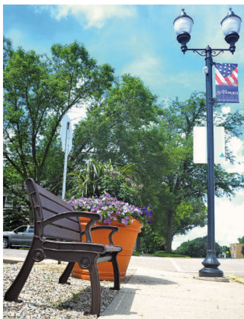
Some recent beautification efforts in Sherburn have included new flower pots, street lighting and benches along Main Street.

In the past, the C and C has donated money towards many things, including the security systems at the school as well as the digital sign. They, along with many other organizations, contributed to the Sherburn's Centennial Park (the South park) which was updated a few years ago with new playground equipment. The updates really enhanced the park and