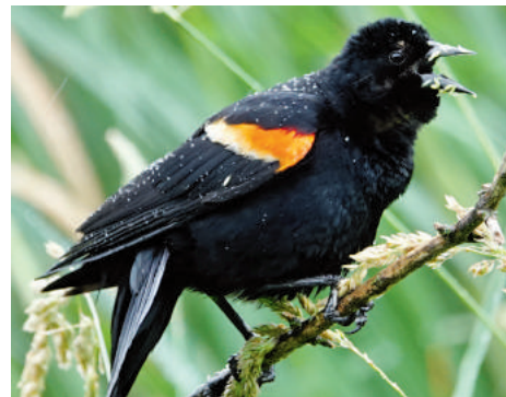
A red-winged blackbird is a feisty fellow, more than willing to attack a larger bird. This one was taking a lunch break from being feisty.

wrote, "Like large dark lazy butterflies they sweep over the glades looking for death, to eat it, to make it vanish, to make of it the miracle: resurrection."