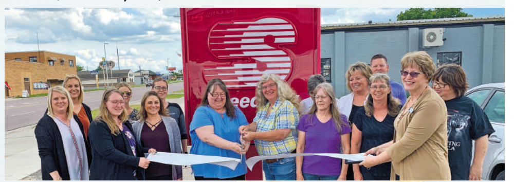
Fairmont Area Chamber Ambassadors celebrate the rebranding and transition of the two former 'Super America' locations in Fairmont to 'Speedway' convenience stores. (Submitted photo)