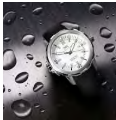
Lot 159 (front cover)