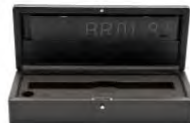
BELL & ROSS - a complete watch box. £60-90