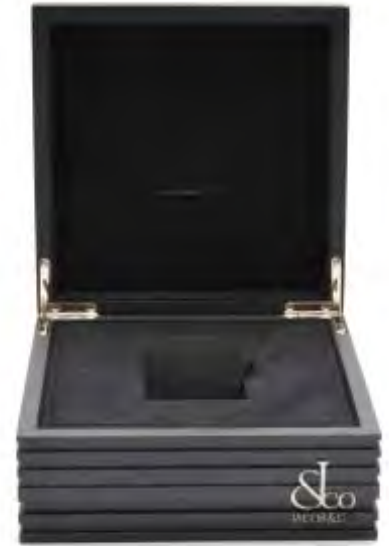
JACOB & CO - a complete watch box. £40-60