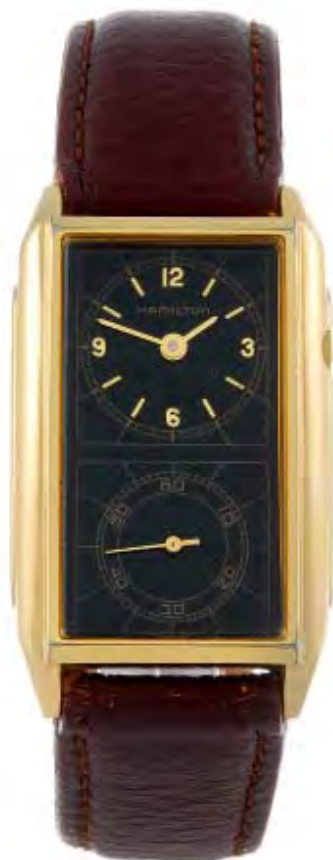
HAMILTON - a gentleman's Seckron wrist watch. Gold plated case with stainless steel case back. Numbered 6214. Unsigned quartz movement. Black dial with baton hour markers, quarterly Arabic numerals, subsidiary seconds dial to six. Fitted to an unsigned brown leather strap with gold plated pin buckle. 24mm. Box. £120-180