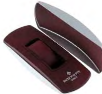
PATEK PHILIPPE - a complete watch box. £50-80