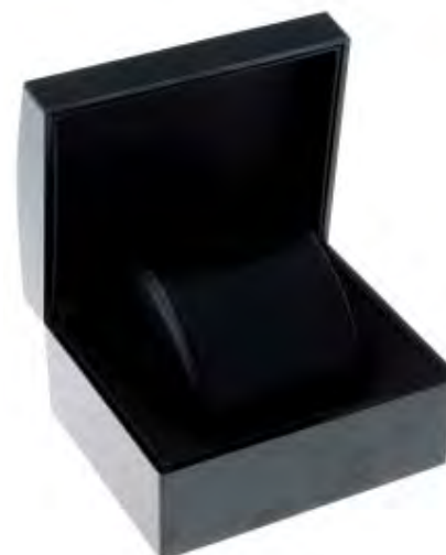
BREITLING - a complete watch box. £40-60