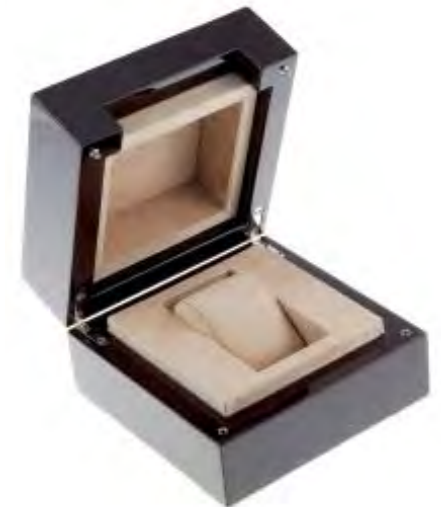
ZENITH - a complete watch box. £60-90