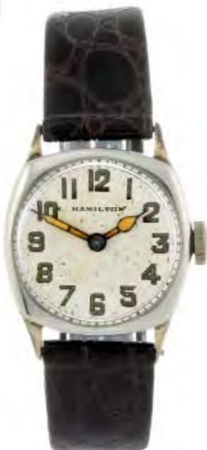
HAMILTON - a gentleman's wrist watch. White metal case, stamped 14K. Signed manual wind calibre 986. Silvered dial with luminous Arabic numeral hour markers. Fitted to an unsigned brown leather strap with gold plated pin buckle. 27mm. £120-180