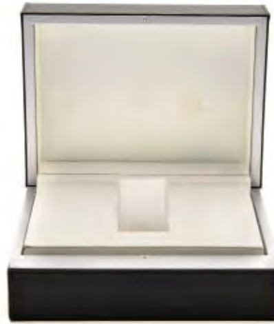
IWC - a complete watch box. £50-80