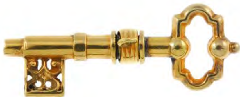
A yellow metal pocket watch key. 31mm. 3gms. £90-140