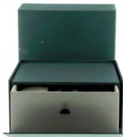
BALL - a complete watch box. £40-60