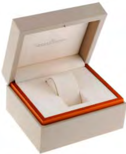
JAEGER-LECOULTRE - a complete watch box. £50-80