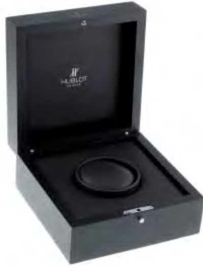
HUBLLOT - a complete watch box. £80-120