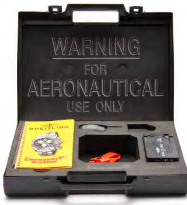
BREITLING - a complete Emergency watch box. £40-60