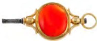
A yellow metal pocket watch key set with a carnelian. 49mm. 7gms. £180-260