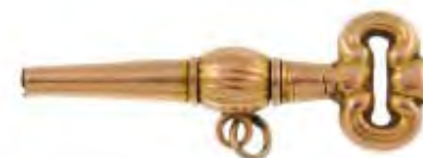
A yellow metal pocket watch key. 38mm. 3gms. £90-140