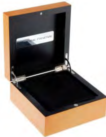
PANERAI - a complete watch box. £70-100