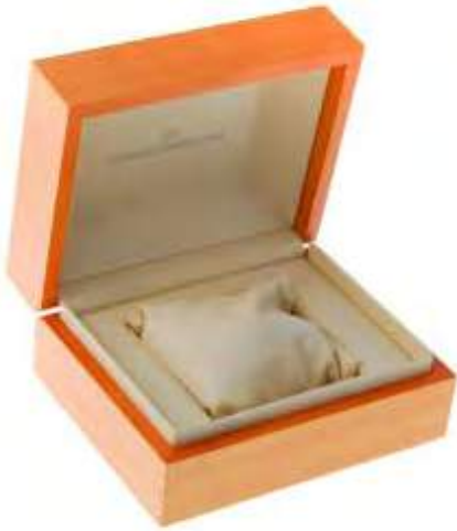
GIRARD-PERREGAUX - a complete watch box. £50-80