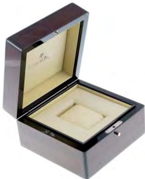
AUDEMARS PIGUET - a complete watch box. £70-100