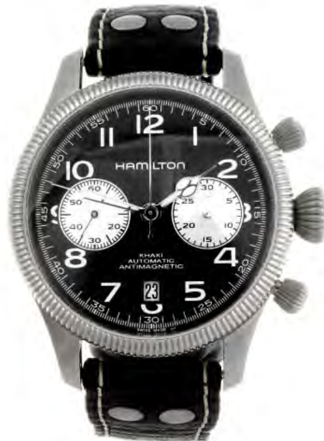
HAMILTON - a gentleman's Khaki Pioneer chronograph wrist watch. Stainless steel case. Numbered H604160. Signed automatic calibre H31 with quick date set. Black dial with Arabic numeral hour markers, subsidiary recorder dials to three and nine, date aperture to six. Fitted to a signed black leather strap with stainless steel pin buckle. 41mm. £300-500