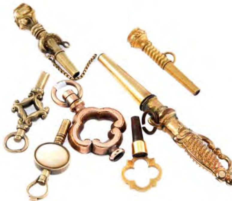
A small group of seven yellow metal pocket watch keys. One in the shape of a sword. 12gms. £160-220