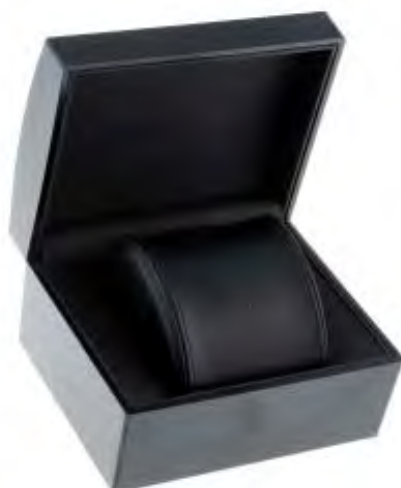
BREITLING - a complete watch box. £40-60