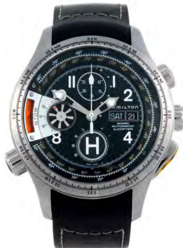
HAMILTON - a gentleman's Khaki Aviation X-Copter chronograph wrist watch. Stainless steel case with calibrated bezel. Numbered H766160. Signed automatic movement with quick day and date set. Black dial with Arabic numeral hour markers, subsidiary recorder dials to six, nine and twelve, day and date aperture to three. Fitted to a signed rubber strap with stainless steel pin buckle. 45mm. £200-300