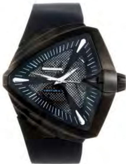
HAMILTON - a gentleman's Ventura wrist watch. PVD treated stainless steel case with exhibition case back. Numbered H246150. Signed automatic movement. Mesh dial with luminous hour markers to one, five and nine. Fitted to a signed black rubber strap with stainless steel pin buckle. 46mm. £180-260