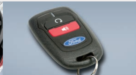
Remote start systems

Shop the complete collection at accessories.ford.com