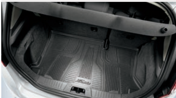
Cargo area protector