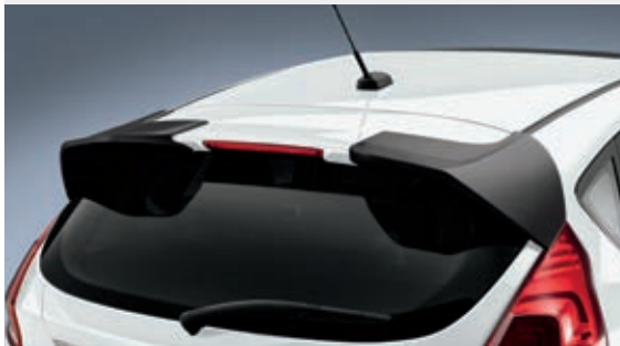
Rear spoiler winglets

1 Ford Licensed Accessory. 2 Additional components may be required. See dealer for details.