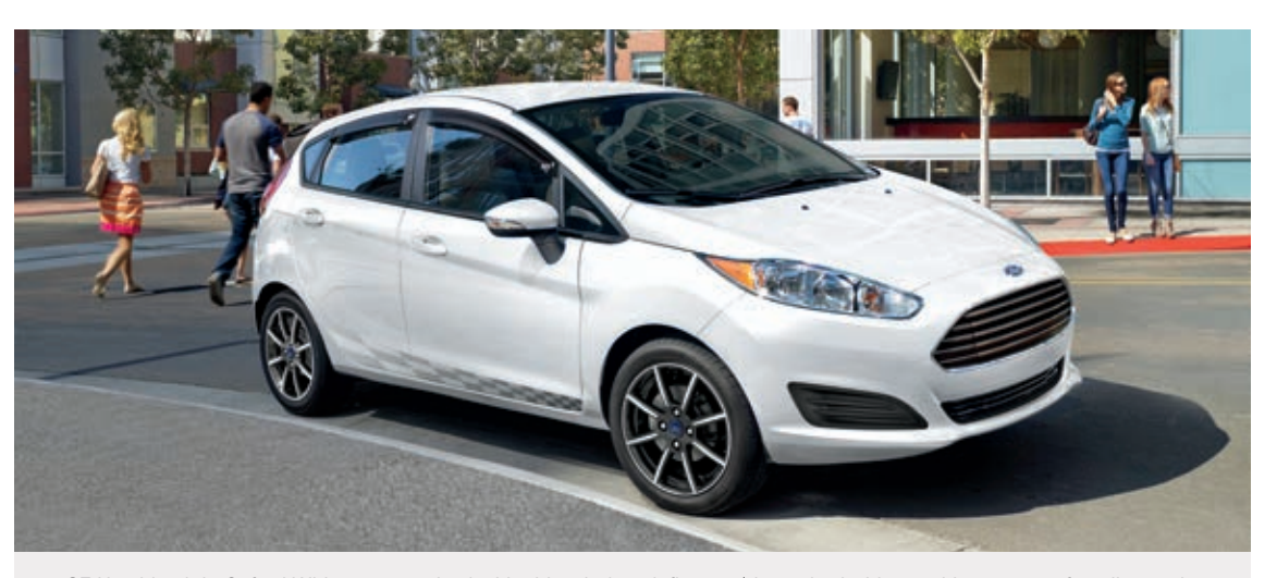
SE Hatchback in Oxford White accessorized with side window deflectors, lower bodyside graphics, rear roof spoiler, and 16" 8-spoke Black-painted machined aluminum wheels<sup>2</sup>

<sup>1</sup>Ford Licensed Accessory. <sup>2</sup>Additional components may be required. See dealer for details.