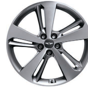
20" MEDIUM METALLIC GRAY