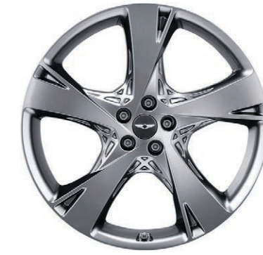
22" MEDIUM SPATTERING